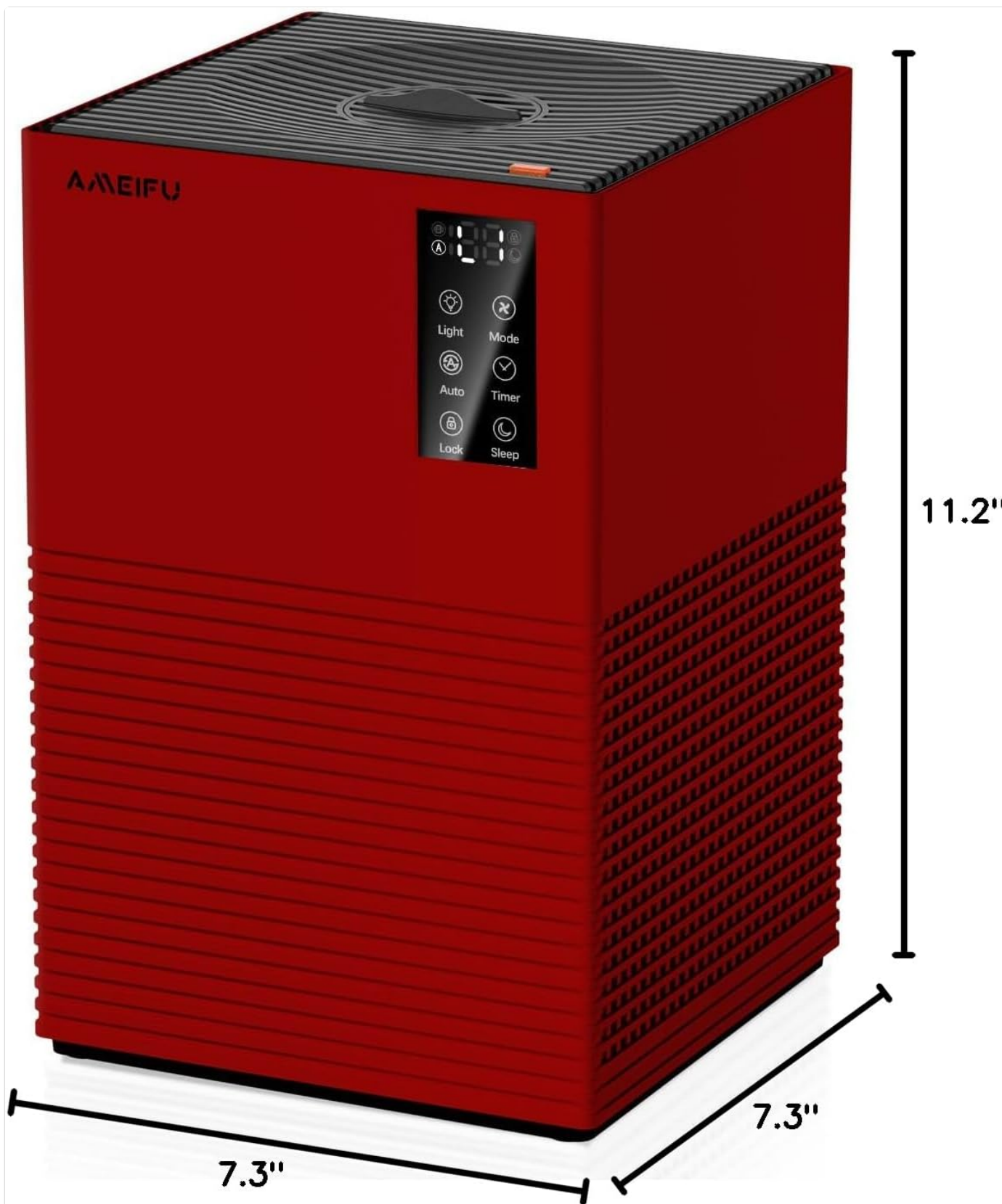
Image: Detailed dimensions of the AMEIFU F2 Air Purifier.