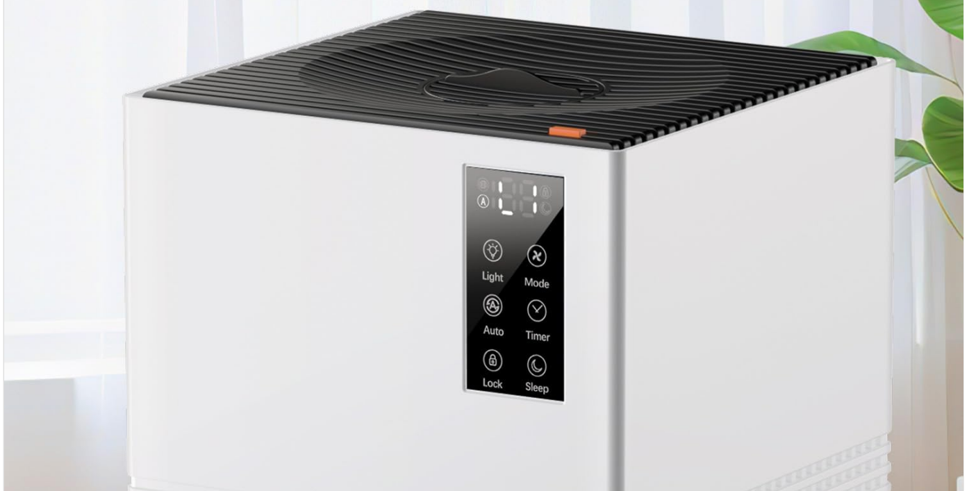
Image: The AMEIFU F2 Air Purifier effectively cleans air in a large room, providing 360-degree coverage.