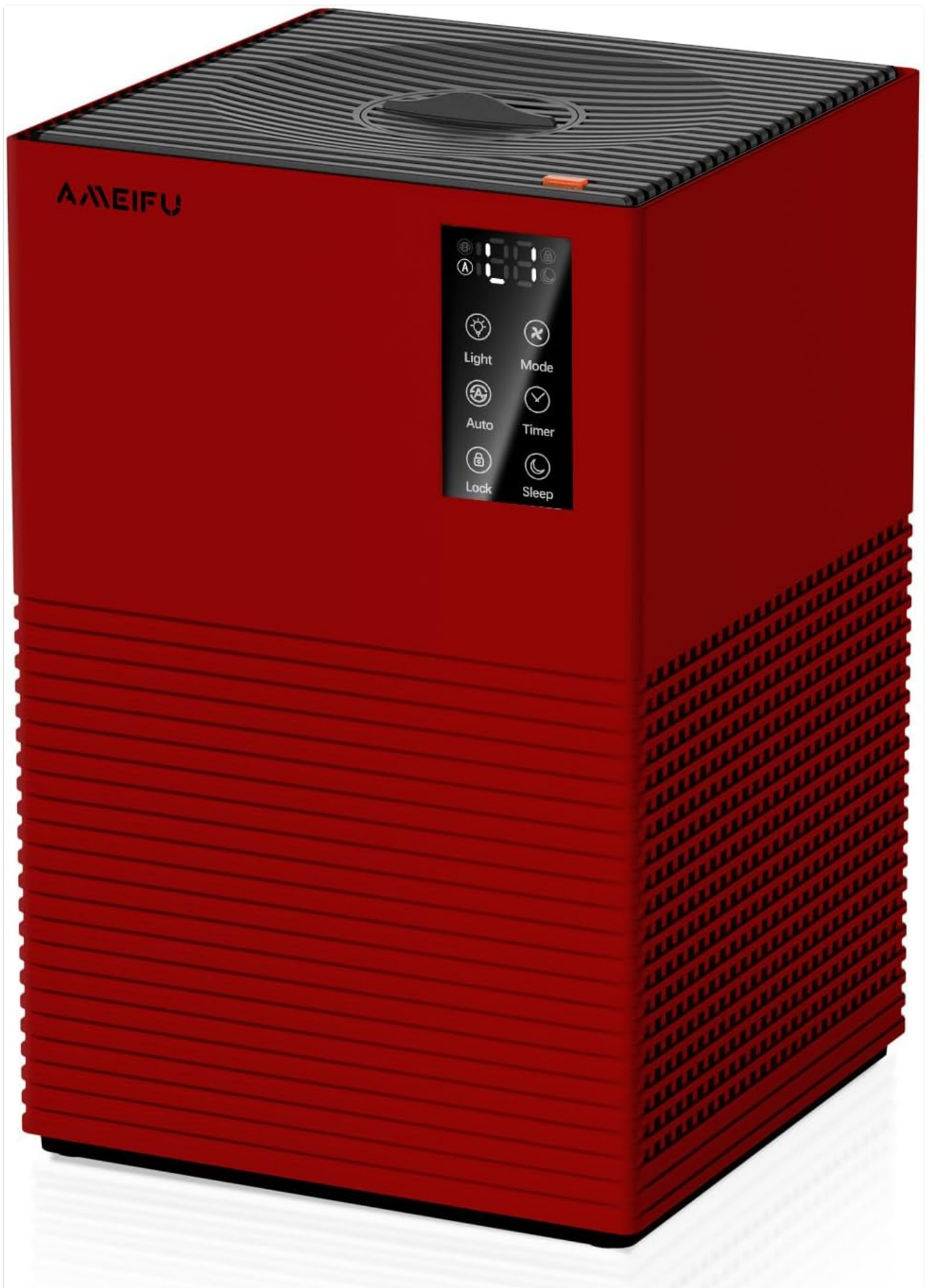
Image: The AMEIFU F2 Air Purifier, showcasing its compact and modern design.