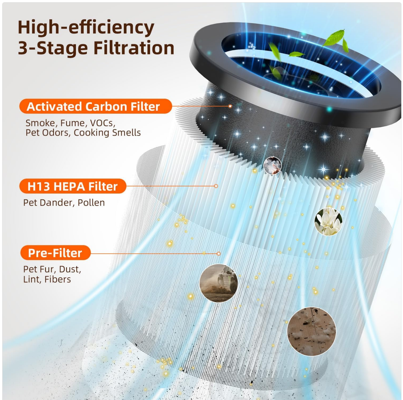
Image: Illustration of the 3-stage filtration system, including Pre-Filter, H13 HEPA Filter, and Activated Carbon Filter.