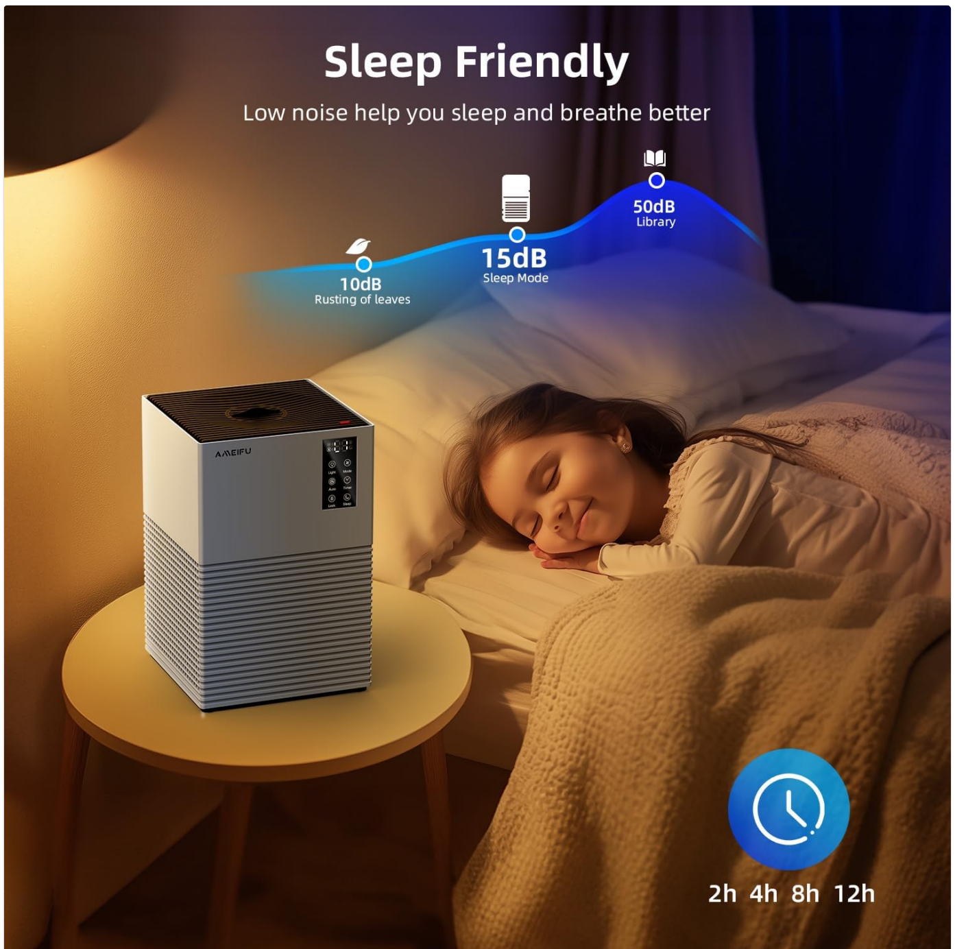
Image: The child lock feature ensures safe operation around children and pets by preventing unintended button presses.