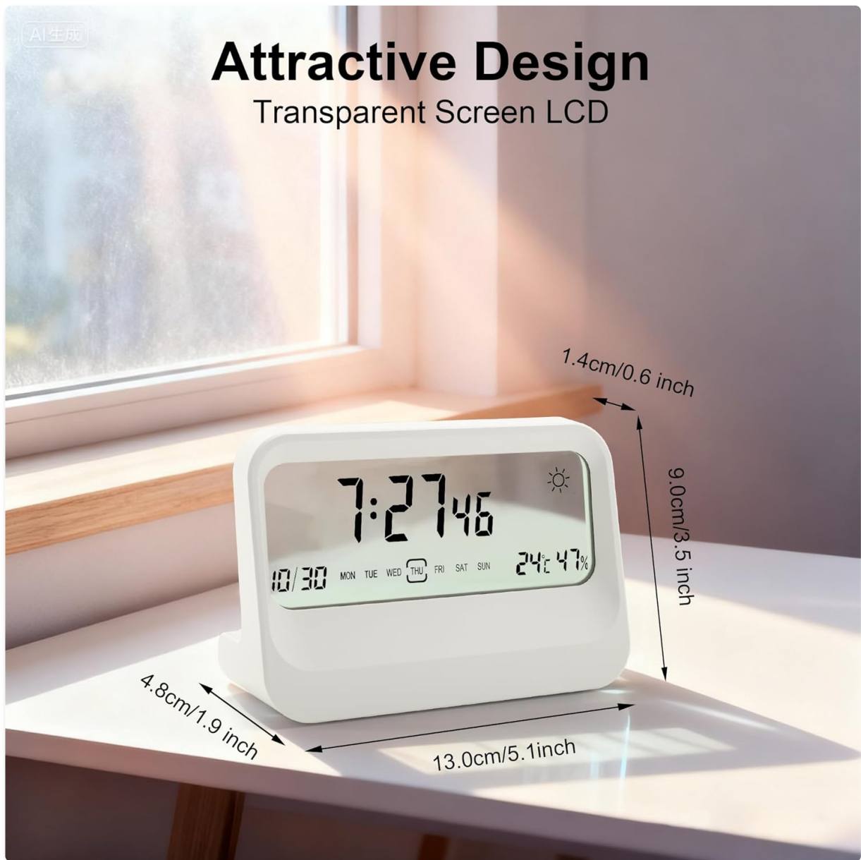
Dimensions of the Lafocuse Digital Alarm Clock.