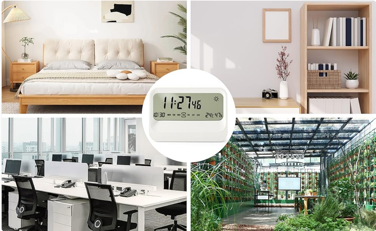
Illustration of the 12-hour and 24-hour time format switching on the Lafofuse Digital Alarm Clock.

7. To switch between 12-hour and 24-hour format, press the °C/°F button while in normal time display mode.