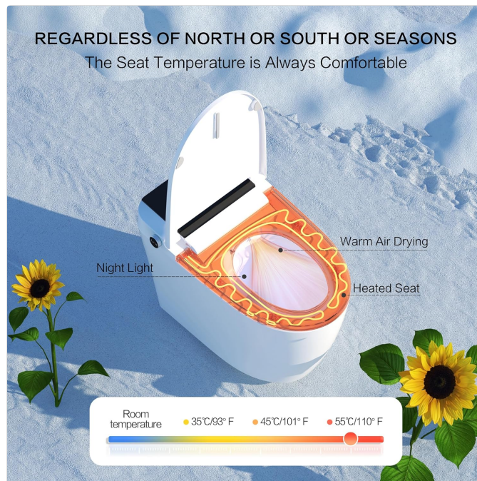
Image: A visual representation of the heated seat, warm air drying, and night light features, highlighting temperature adjustability.