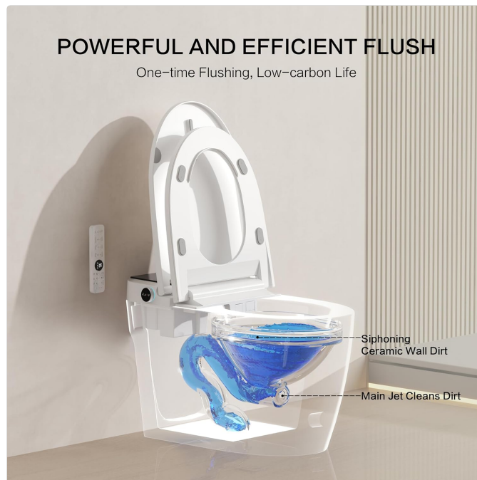
Image: An illustration of the powerful and efficient siphonic flush system, showing how it cleans the ceramic wall and uses a main jet.