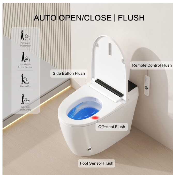
Image: Visual guide to the automatic lid and flushing features, including foot sensor and remote control options.