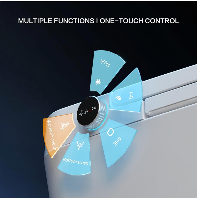
Image: A close-up of the one-touch knob, indicating its rotational and press functions for various wash and flush operations.

Your browser does not support the video tag.