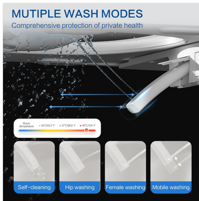
Image: An overview of the multiple bidet wash modes and temperature settings available on the smart toilet.