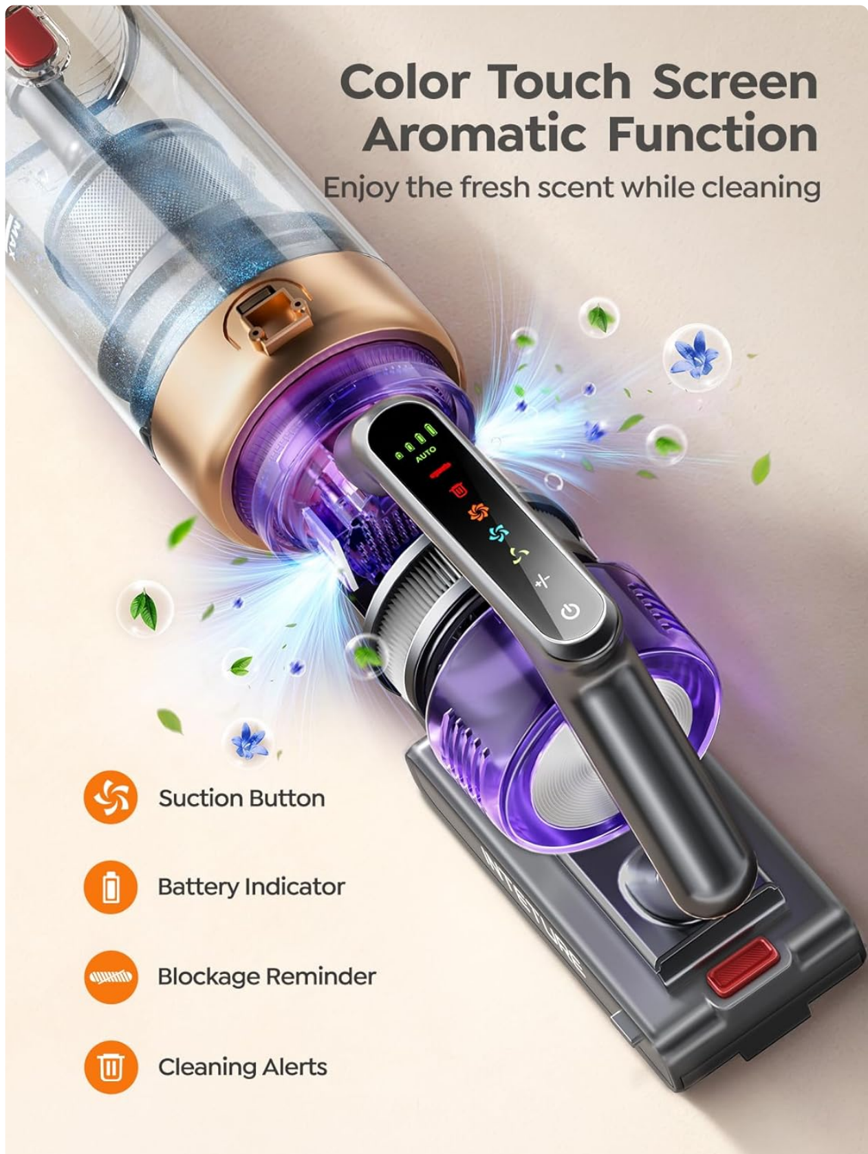
Figure 2: LED touchscreen for mode selection and battery status.

The intuitive touch screen allows for easy control and monitoring of the vacuum's performance.