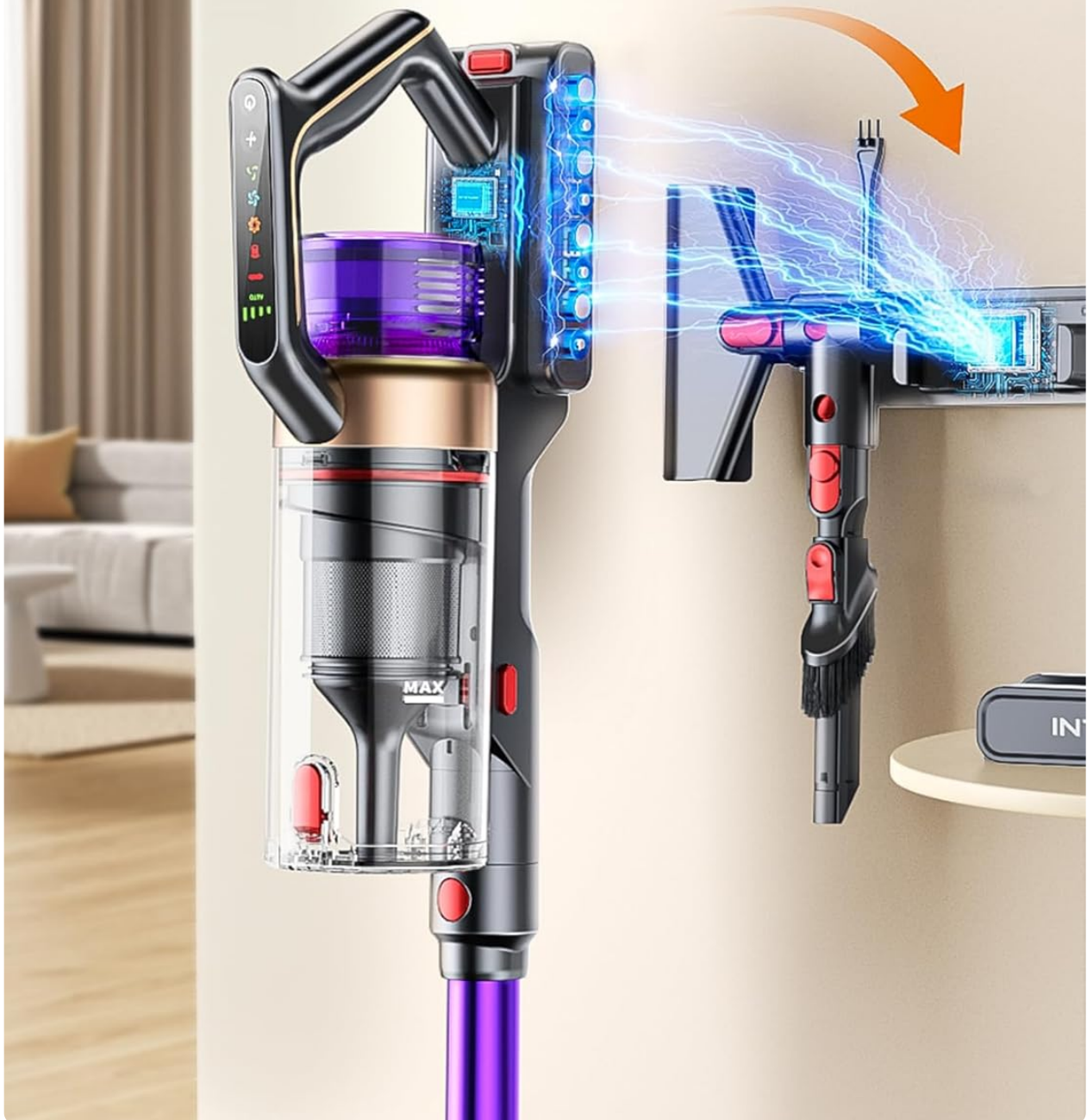
Figure 1: Wall-mount charging and storage station for the INTETURE BP30.

The wall-mount charging dock provides convenient storage and charging for the vacuum and its accessories.