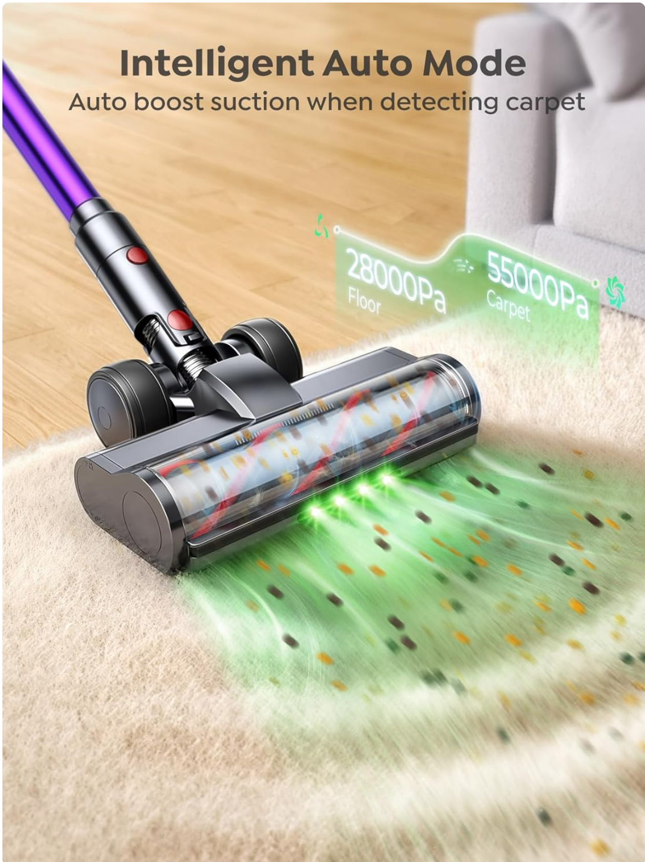
Figure 3: Auto mode intelligently adjusts suction for different surfaces.

In Auto mode, the vacuum cleaner automatically adjusts suction power when transitioning between different floor types, such as hardwood and carpet, ensuring optimal cleaning efficiency.