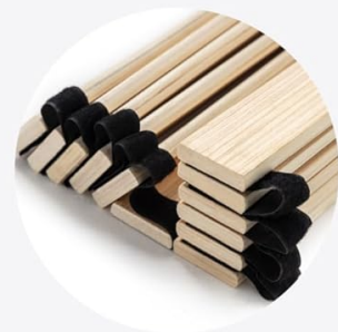
Sturdy Wooden Slats