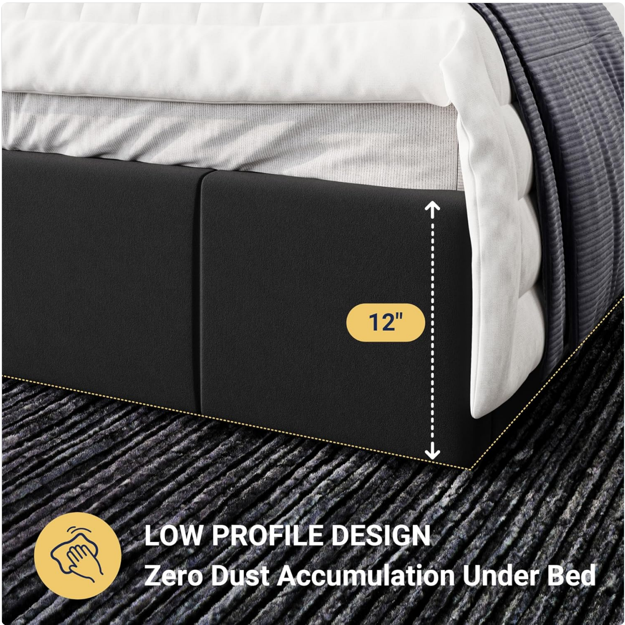
Figure 2.1: Detail of the soft, skin-friendly Dutch velvet fabric and high-density foam padding.