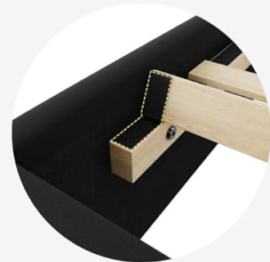
Easy to Assemble