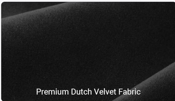
Premium Dutch Velvet Fabric