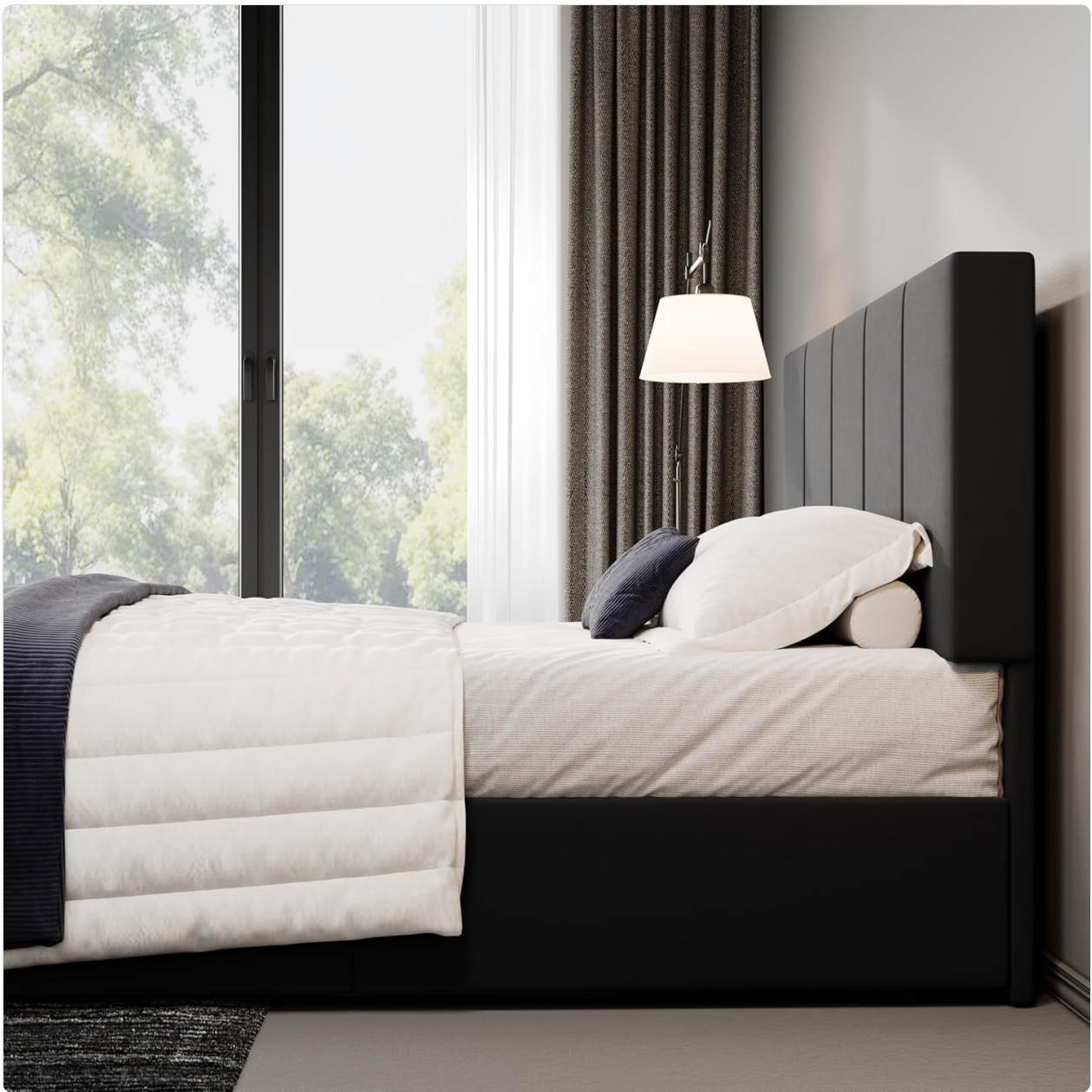
Figure 4.1: Key assembly features including noise-reducing foam, simple assembly design, and robust wooden slats.