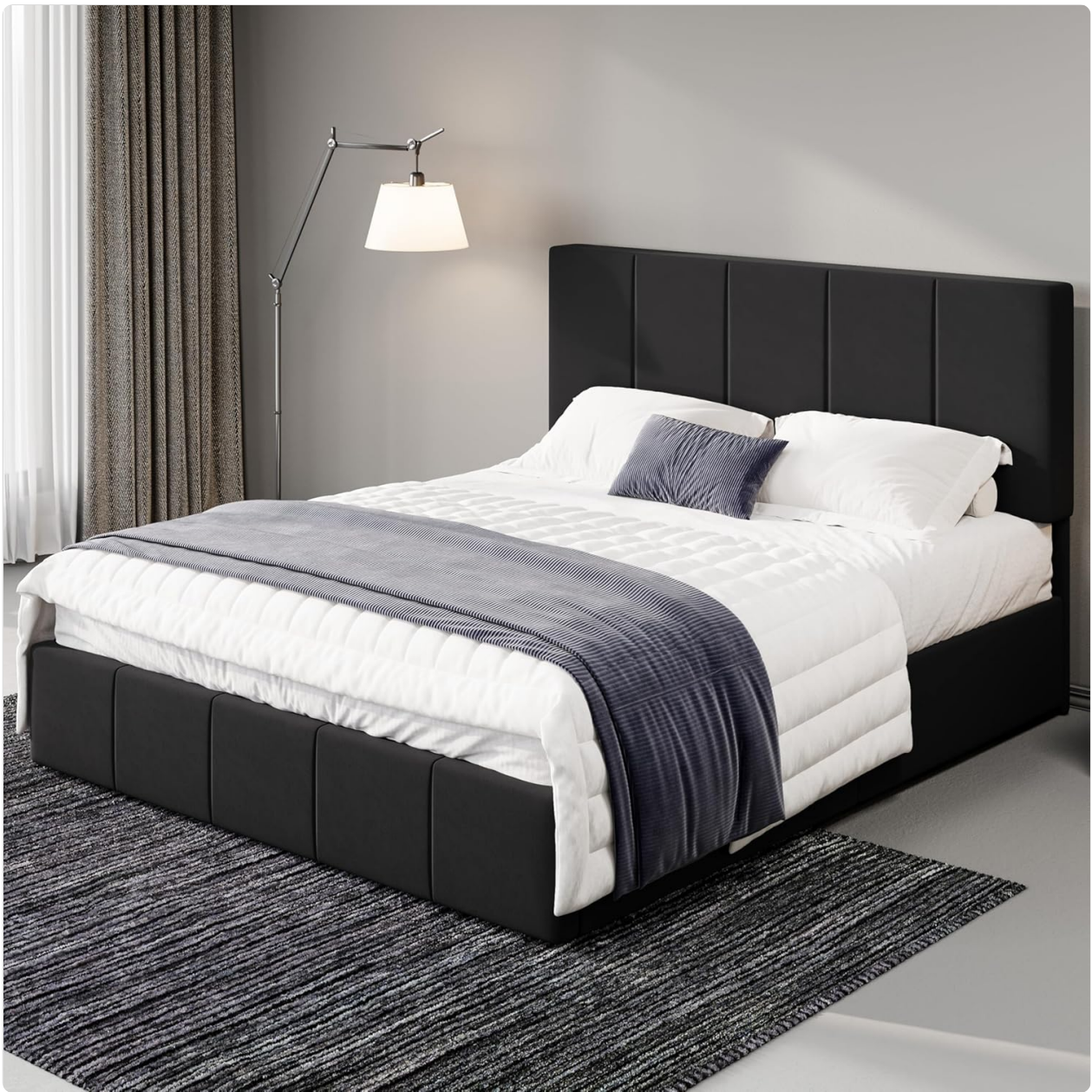
Figure 1.1: Allewie Full Size Dutch Velvet Upholstered Platform Bed Frame (Black Full)