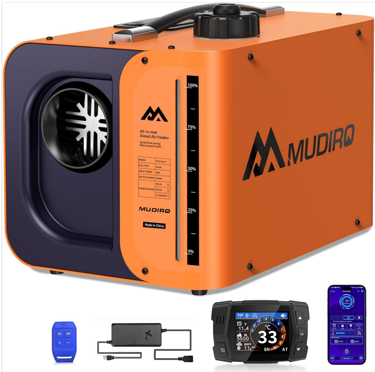
Image: The MUDIRO M-5S Ultra Diesel Heater shown with its main unit, remote control, power adapter, and TFT display.