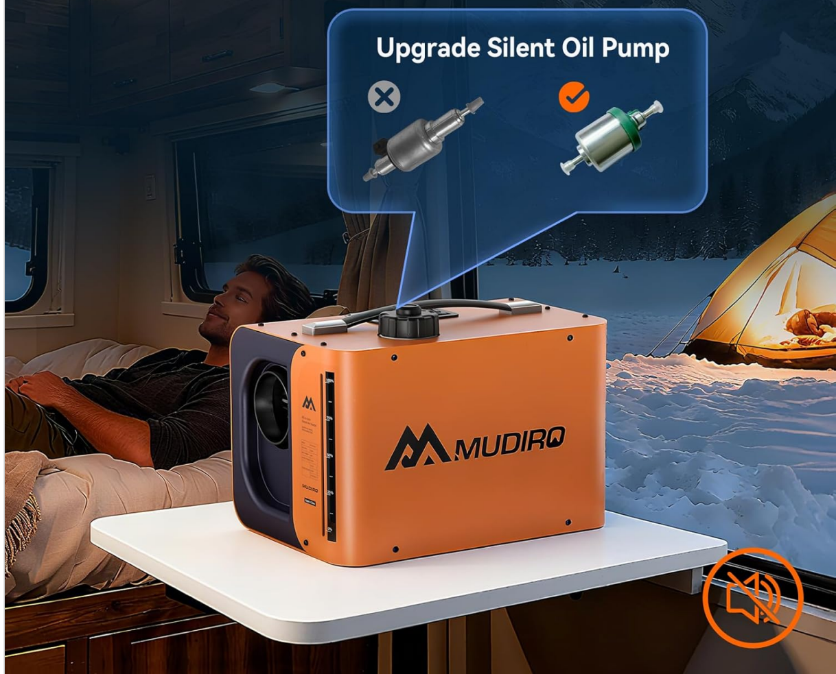
Image: The MUDIRO M-5S Ultra Diesel Heater operating quietly in an RV interior, emphasizing its low-noise design for undisturbed sleep or work.