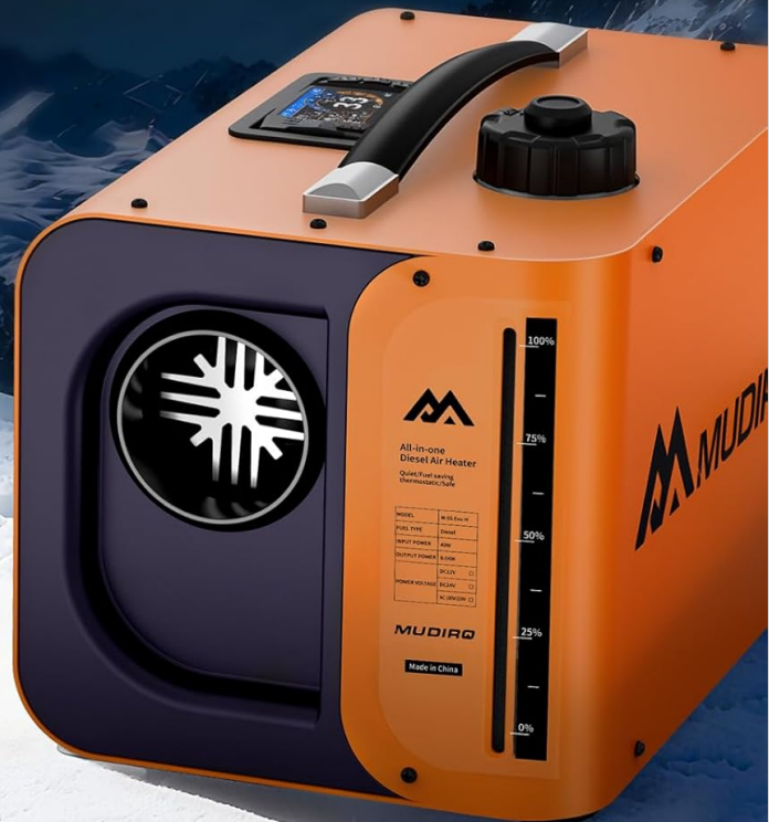
Image: The MUDIRO M-5S Ultra Diesel Heater operating in a snowy outdoor setting, highlighting its auto-adaptive high altitude mode with real-time altitude display on the control panel.