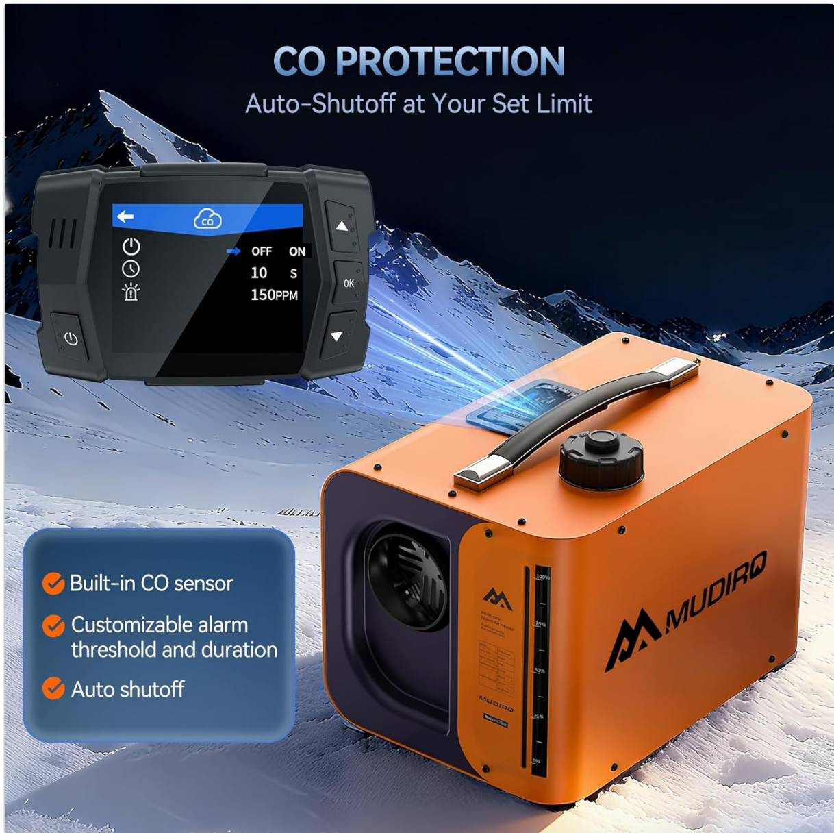
Image: The MUDIRO M-5S Ultra Diesel Heater control panel displaying CO protection features, indicating a built-in sensor for enhanced safety.