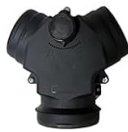
Three Direct Links