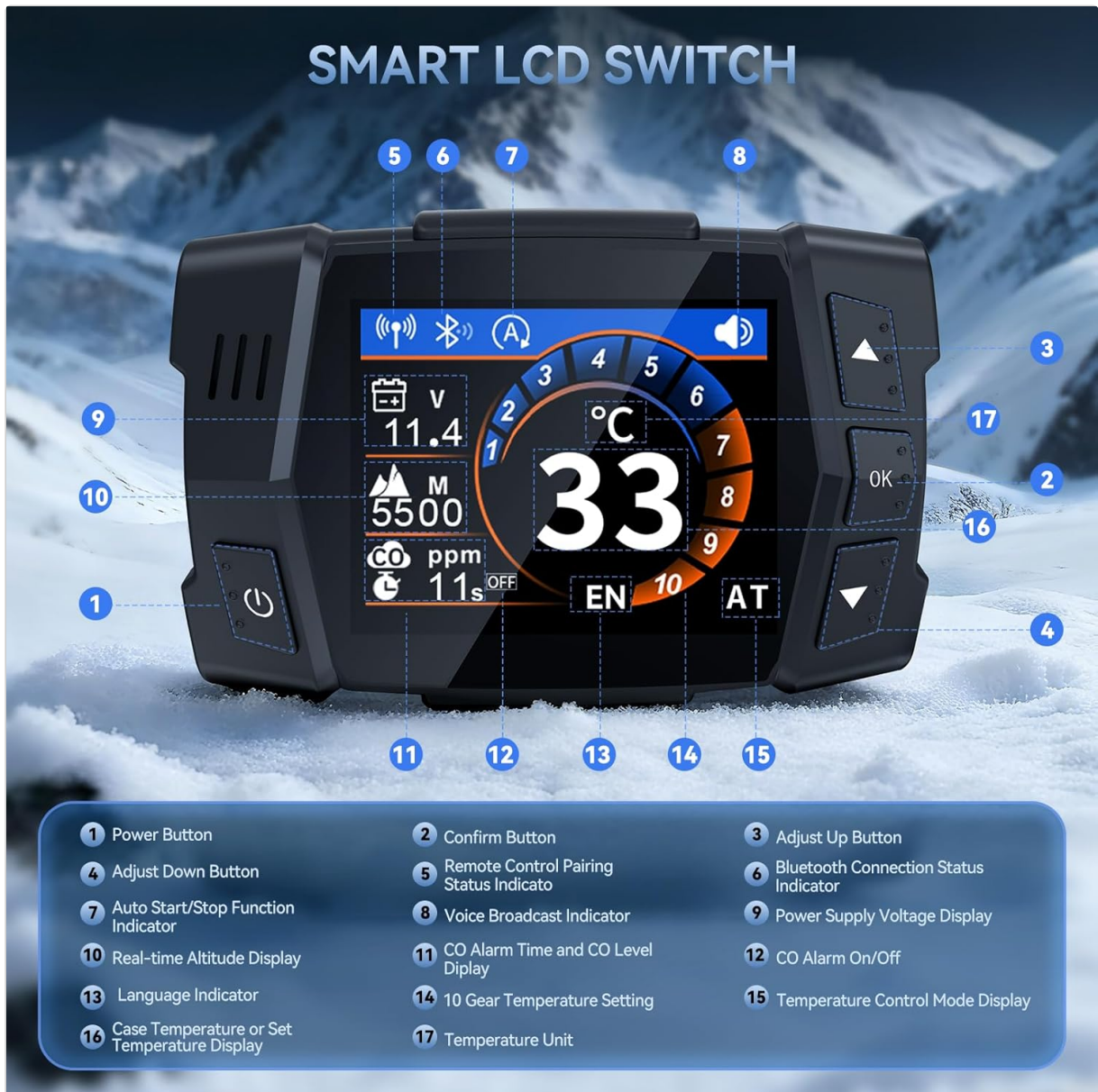
Image: A detailed view of the MUDIRO M-5S Ultra's Smart LCD Switch, highlighting various buttons and display elements for control and monitoring.