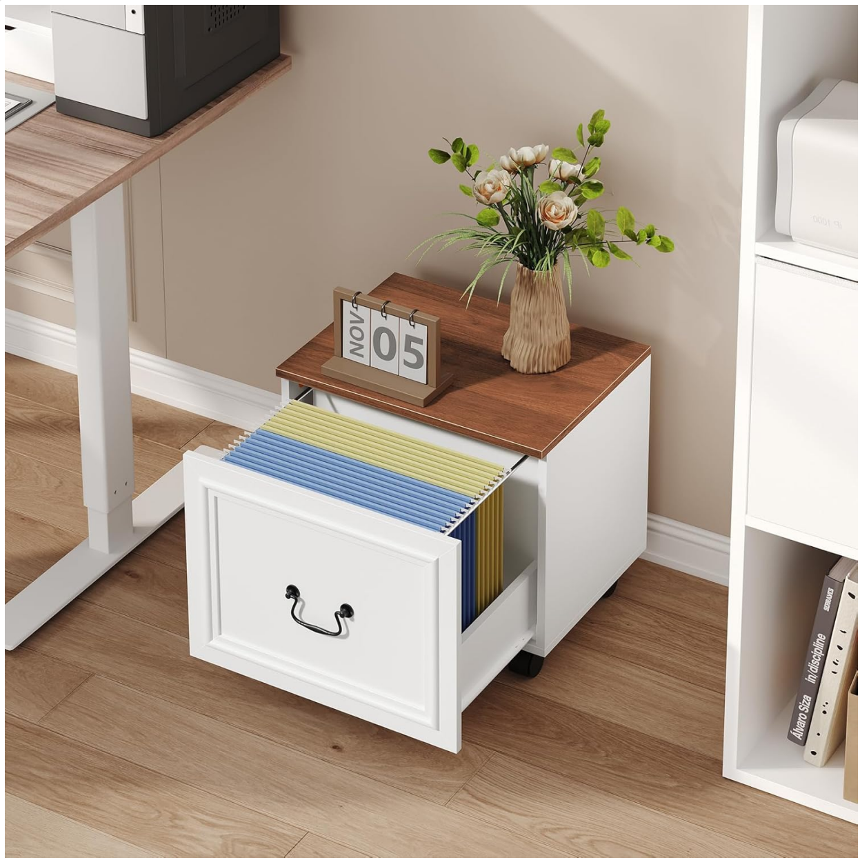
Image Description: An overhead view of the MAHANCRIS FCBA3701 File Cabinet with its single drawer fully extended. The drawer contains various colored hanging files, demonstrating its capacity and functionality for organizing documents. The cabinet is positioned next to a desk and a small bookshelf in a home office setting.