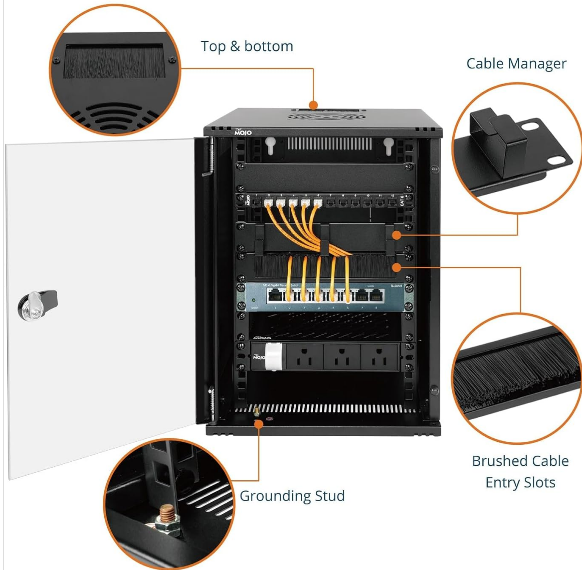
Image: Internal view of the cabinet showcasing installed network equipment, cable management, and power strip.