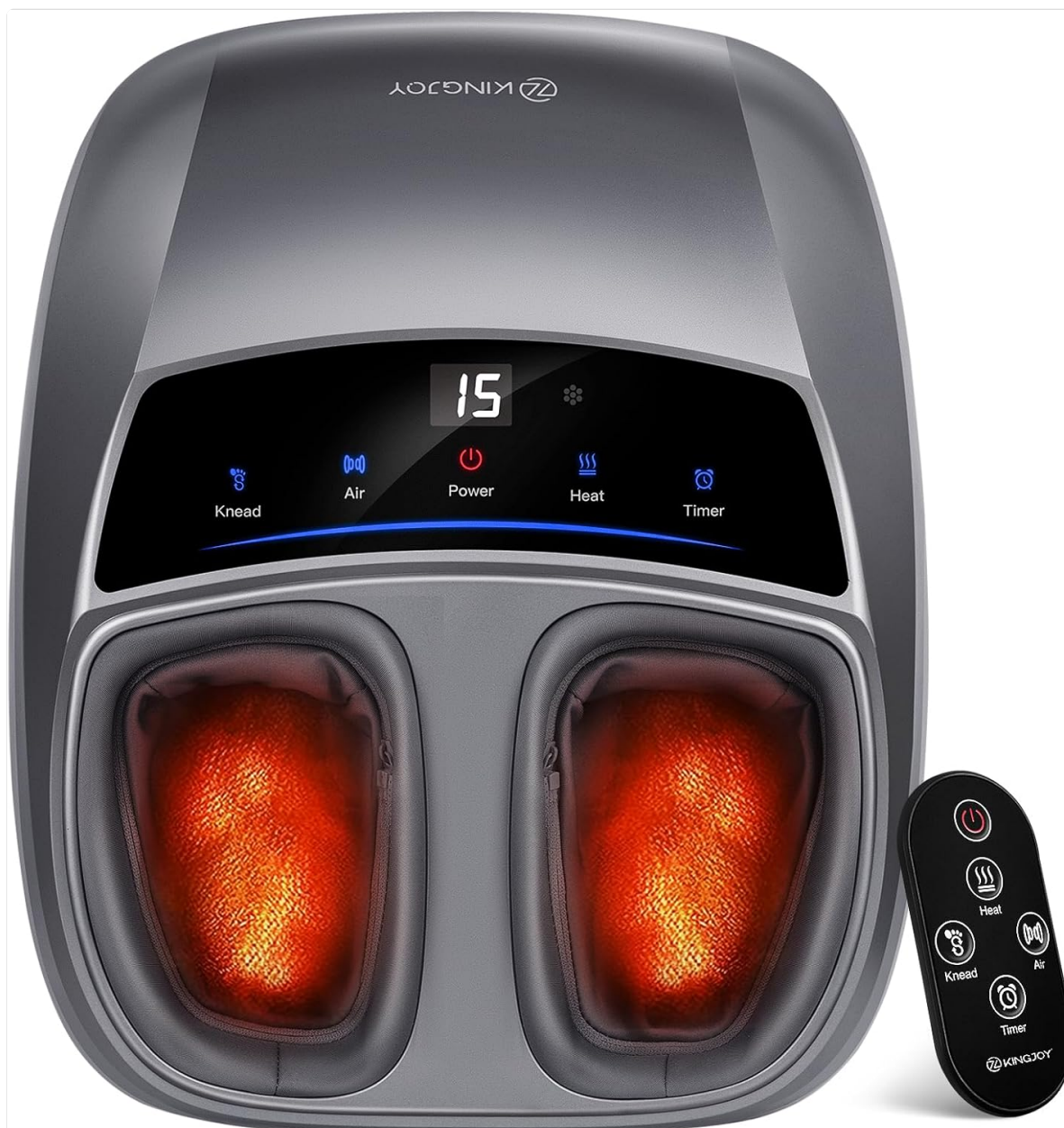
Image: The KINGJOY KJF1 Foot Massager, a gray unit with foot inserts and a digital display, accompanied by its remote control.

therapy. It is suitable for various foot discomforts, including those associated with plantar fasciitis and neuropathy.