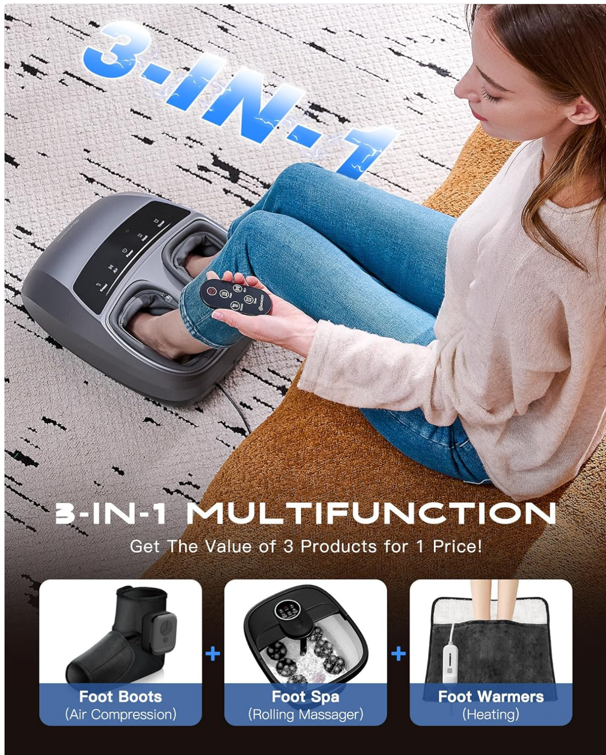
Image: An illustration highlighting the 3-in-1 multifunctionality of the massager, comparing it to foot boots (air compression), a foot spa (rolling massager), and foot warmers (heating).