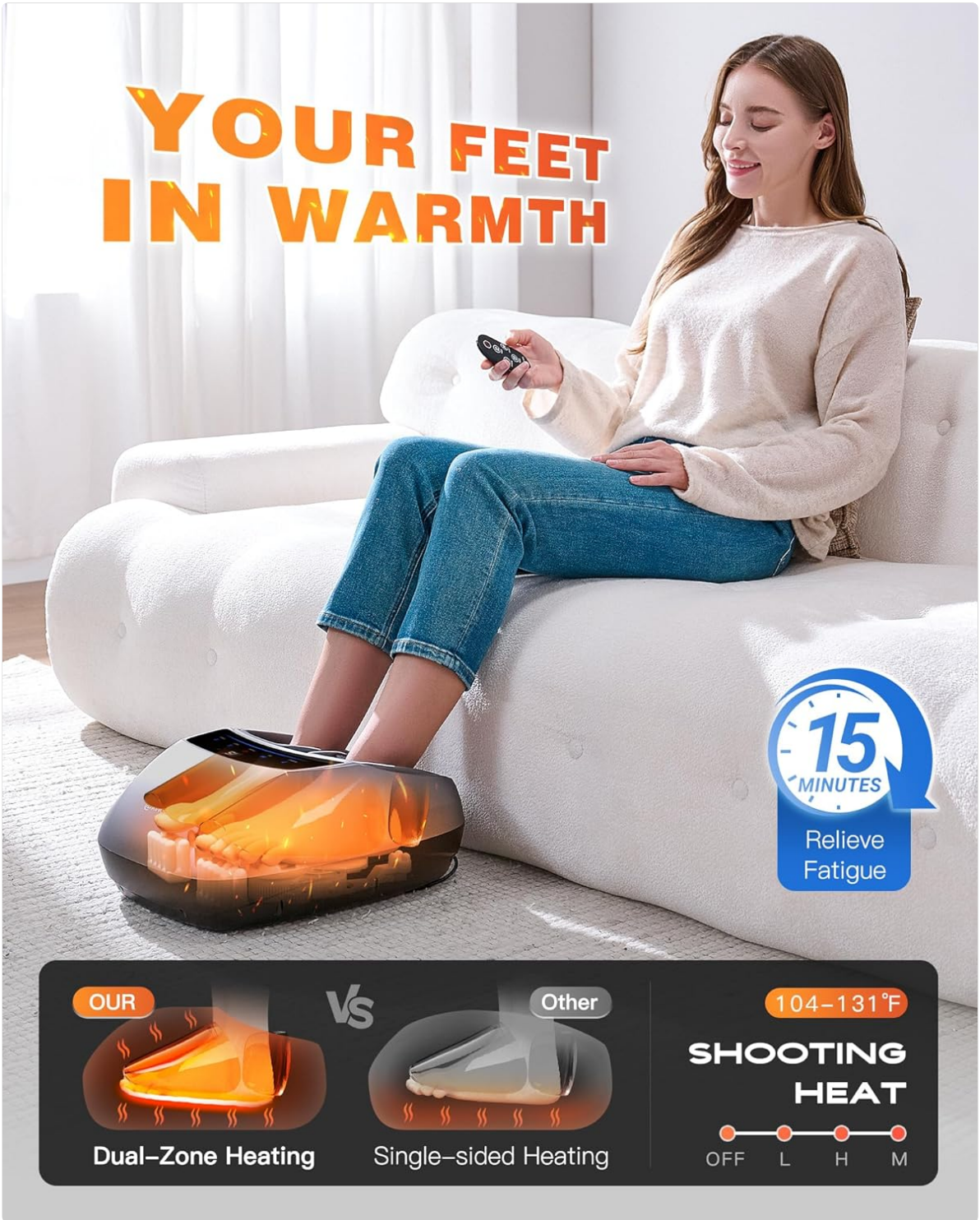
Image: A person using the foot massager, illustrating the dual-zone heating feature with visual indicators for heat on both the top and bottom of the feet.