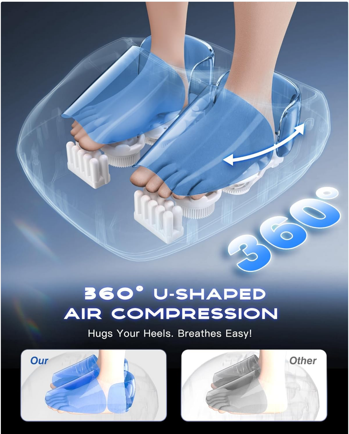
Image: A diagram showing the 360-degree U-shaped air compression system of the foot massager, highlighting how it hugs the heels and provides compression.