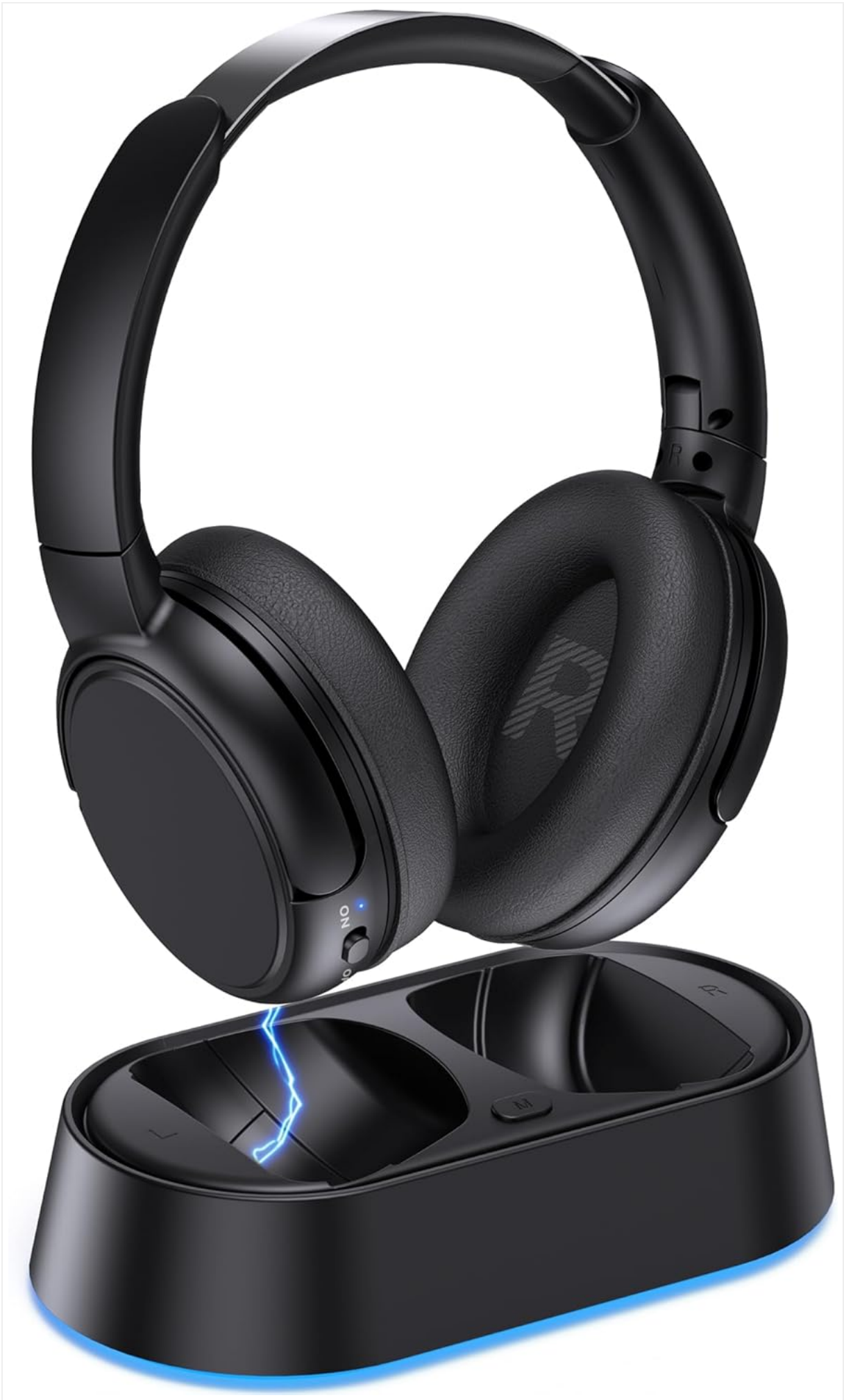
Figure 1: Swiitech CH-211 Wireless TV Headphones and Charging Base.