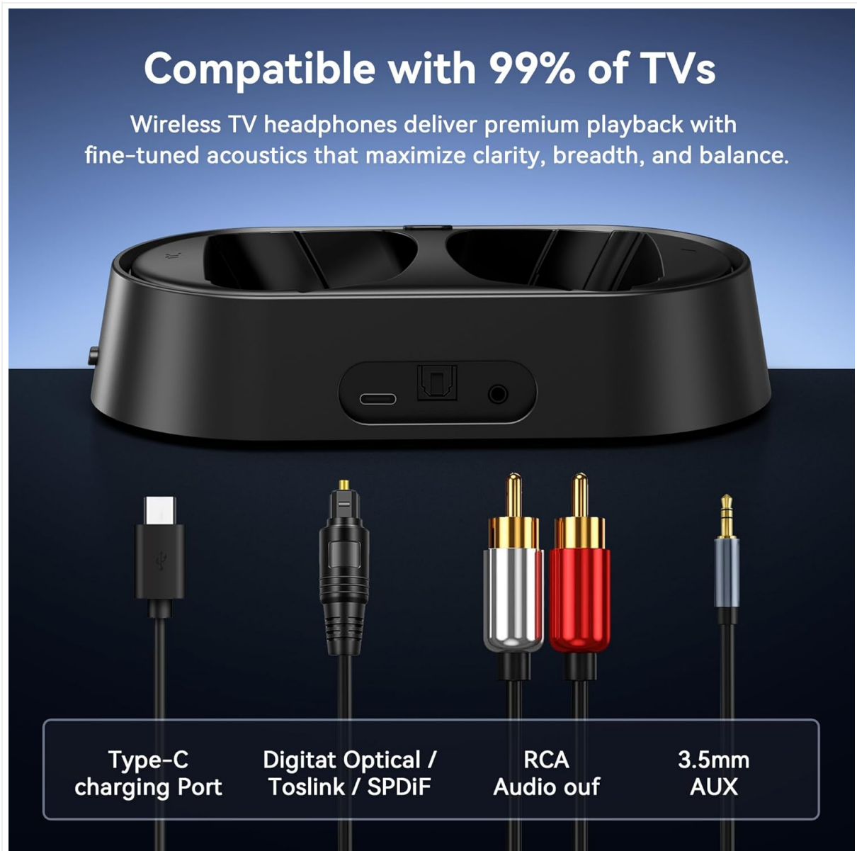
Figure 3: Visual guide for connecting the headphones to your TV.