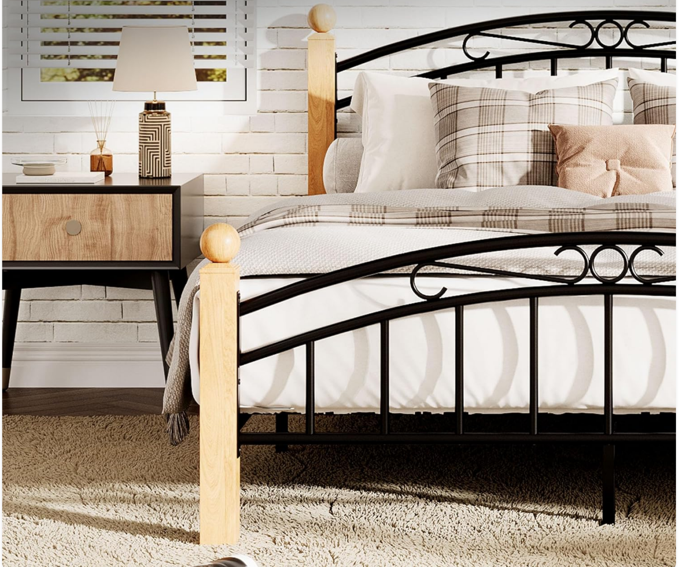
Image: A close-up view highlighting the simple, modern iron art design of the bed frame's headboard and footboard.

Timeless Design Meets Sturdy Construction.