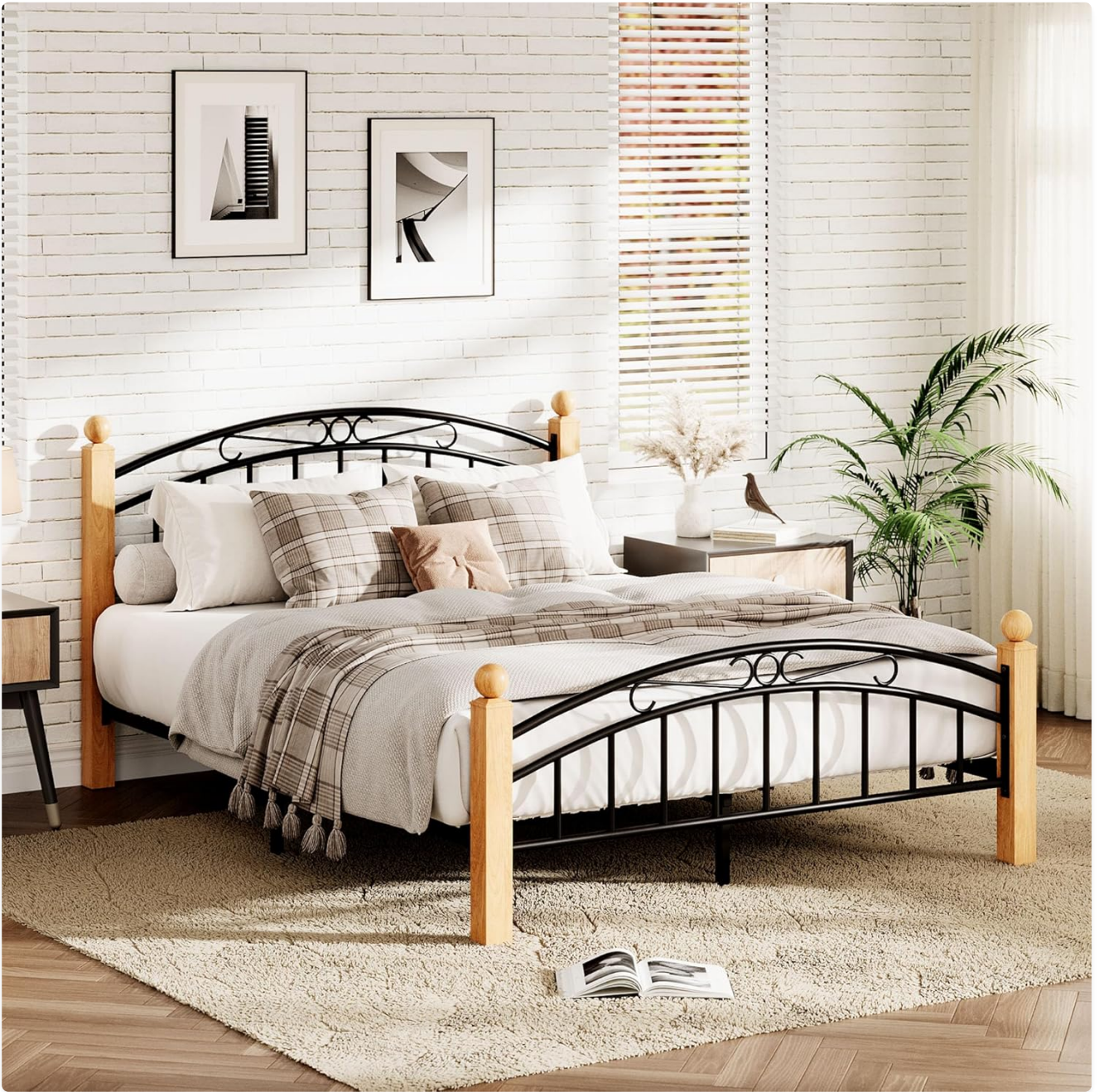
Image: The Amyove Queen Metal Bed Frame, fully assembled with bedding, in a modern bedroom setting.