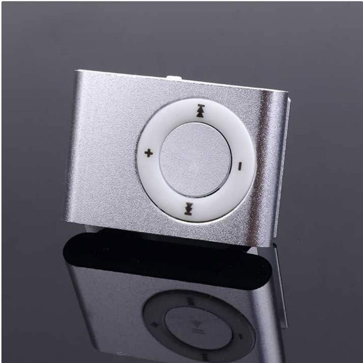
Figure 2: Front View of MP3 Player

A close-up view of the MP3 player's front panel, showing the central control pad.