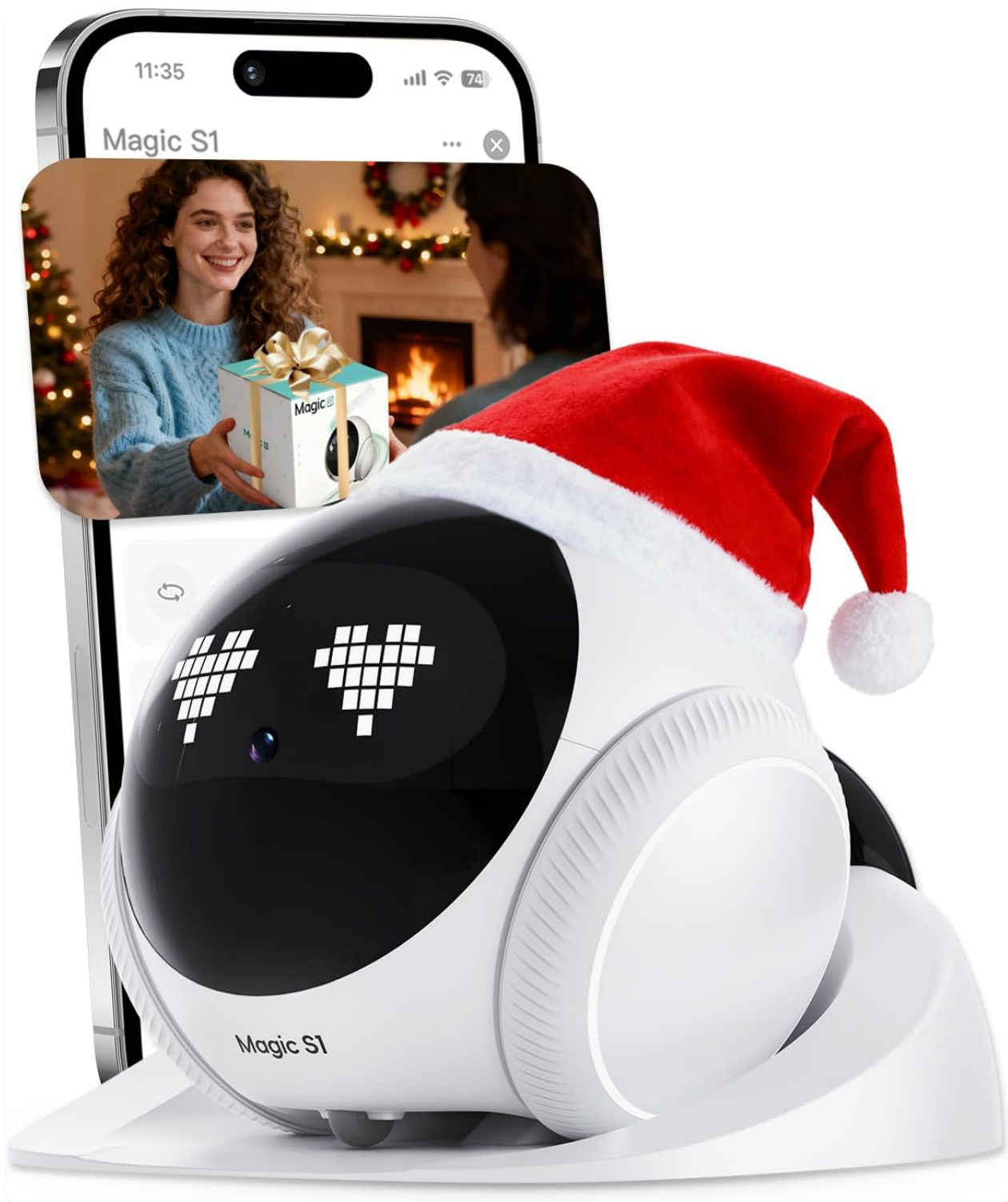
Image: The Crigge Magic S1 Camera Robot, its charging station, power adapter, and instruction manual as packaged.