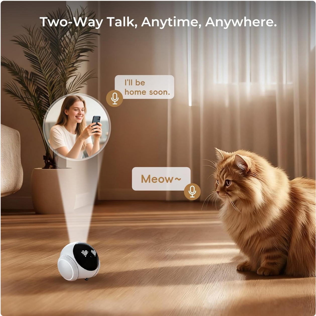
Image: Two-way talk feature allows users to communicate with pets or family members remotely.