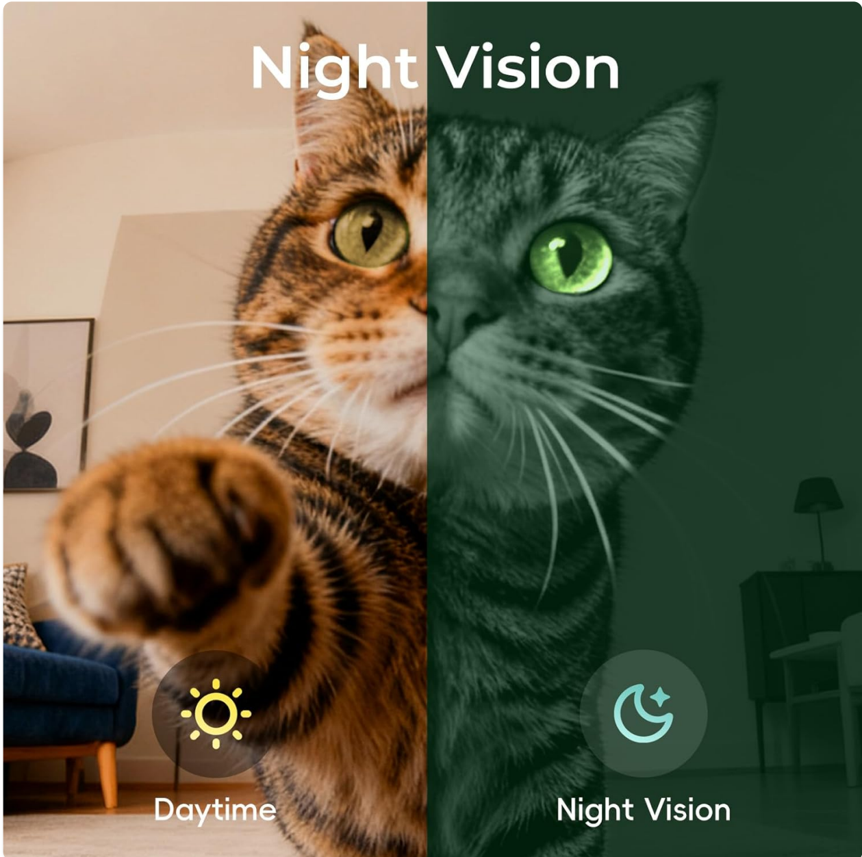
Image: Enhanced night vision provides clear monitoring in low-light conditions.

The camera features enhanced night vision, providing clear black-and-white video even in complete darkness, ensuring continuous monitoring around the clock.