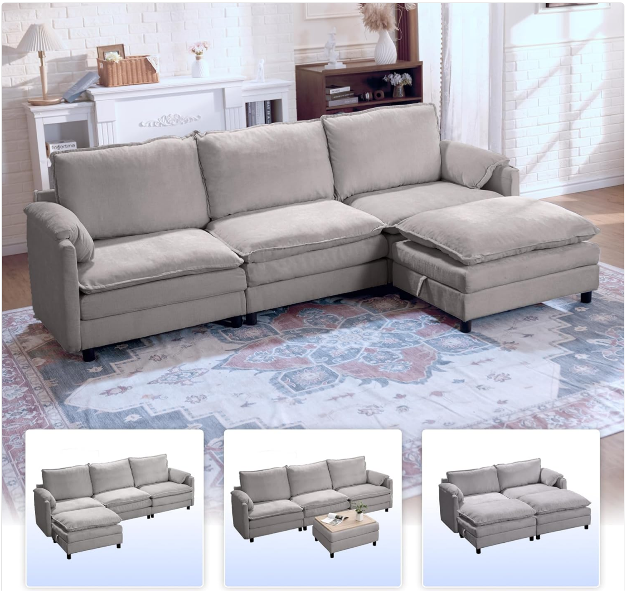
Image 1.1: The FLEXISPOT SF6 Cloud Sectional Couch in Grey, showcasing its L-shaped configuration with an ottoman.