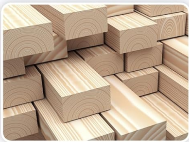
Hard Solid Wood Frame