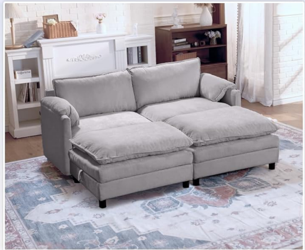
Image 4.1: Examples of various modular configurations possible with the SF6 sectional couch.