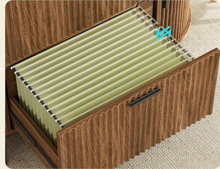
letter size / A4 size