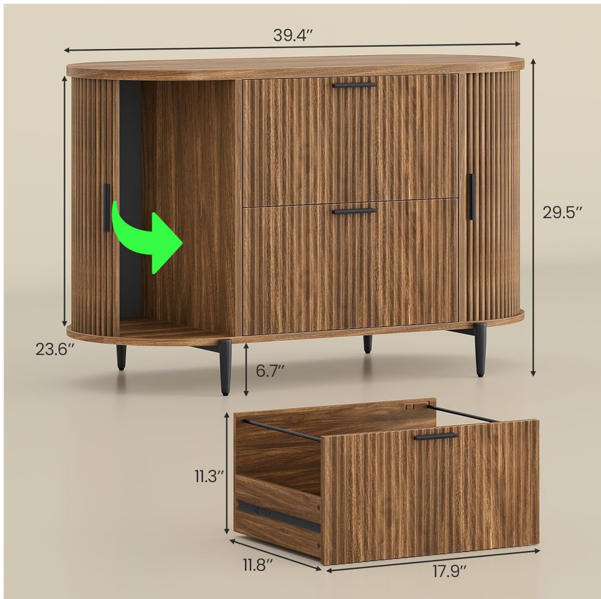
Image: A technical diagram illustrating the overall dimensions of the SEDETA 2 Drawer File Cabinet, including width, depth, and height.