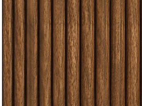
Image: A close-up view of the curved sliding door, demonstrating its smooth movement along the track to reveal the storage compartment.

The cabinet features curved sliding doors on both sides. To open, gently push the door along its track. To close, pull the door back until it aligns with the cabinet front. Ensure the doors slide smoothly without obstruction.