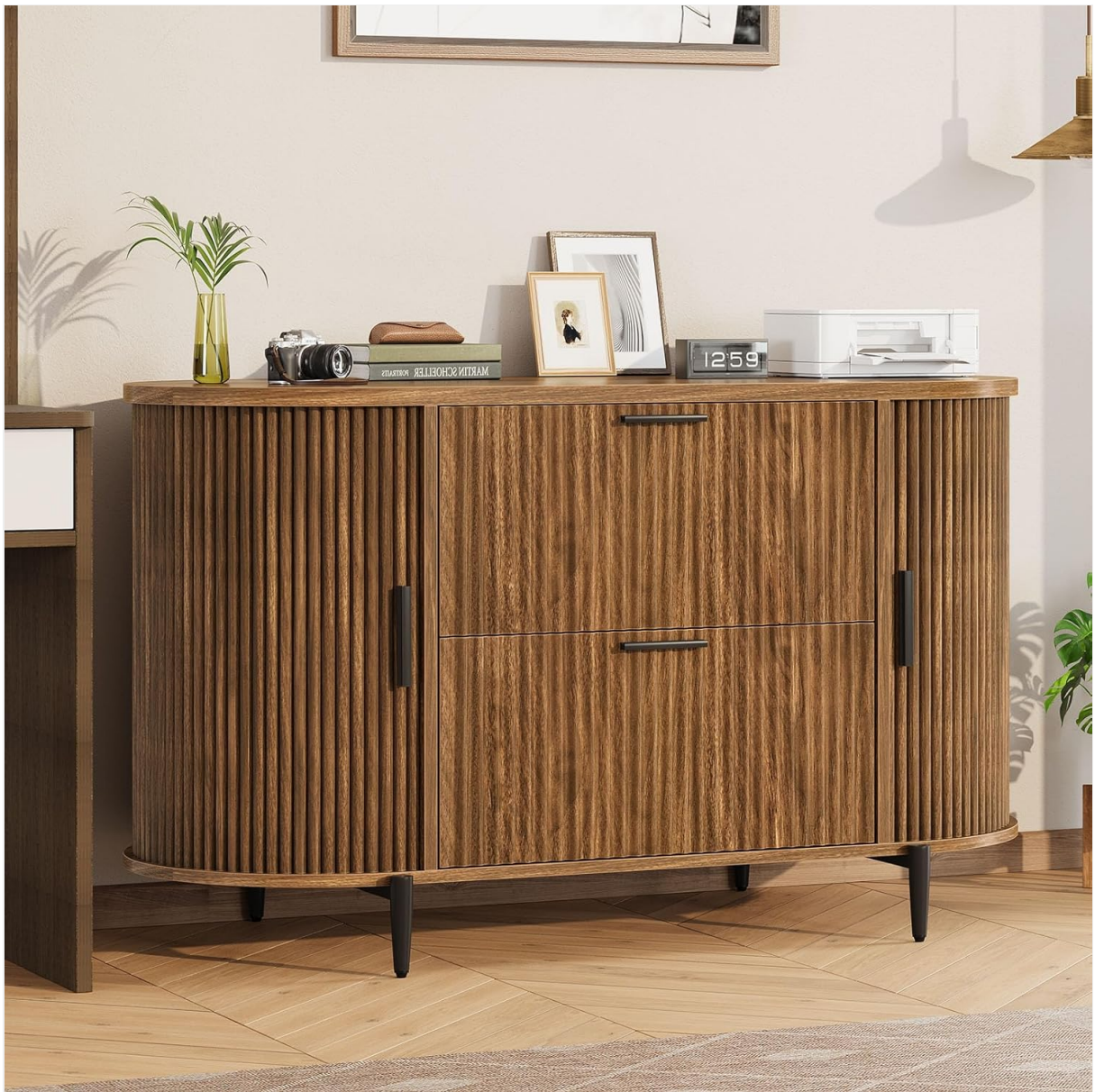
Image: The SEDETA 2 Drawer File Cabinet, brown finish, positioned in a home office with a printer and decorative items on top, showcasing its elegant design and functionality.