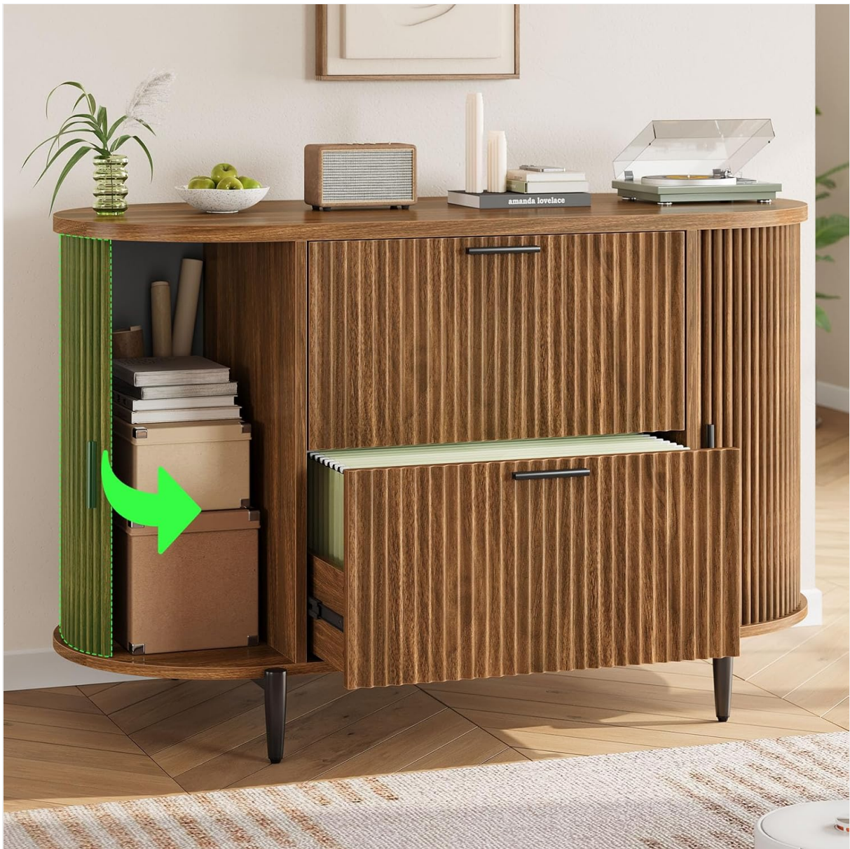
Image: The file cabinet with its left sliding door open, revealing internal storage space, and the upper file drawer pulled out, displaying organized hanging files.