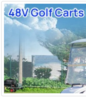
Figure 7.1: 48V 100Ah LiFePO4 Battery Specifications.