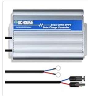
Figure 7.3: 300W MPPT Solar Charge Controller Specifications.