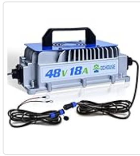
Figure 7.4: 48V 18A Charger Specifications.