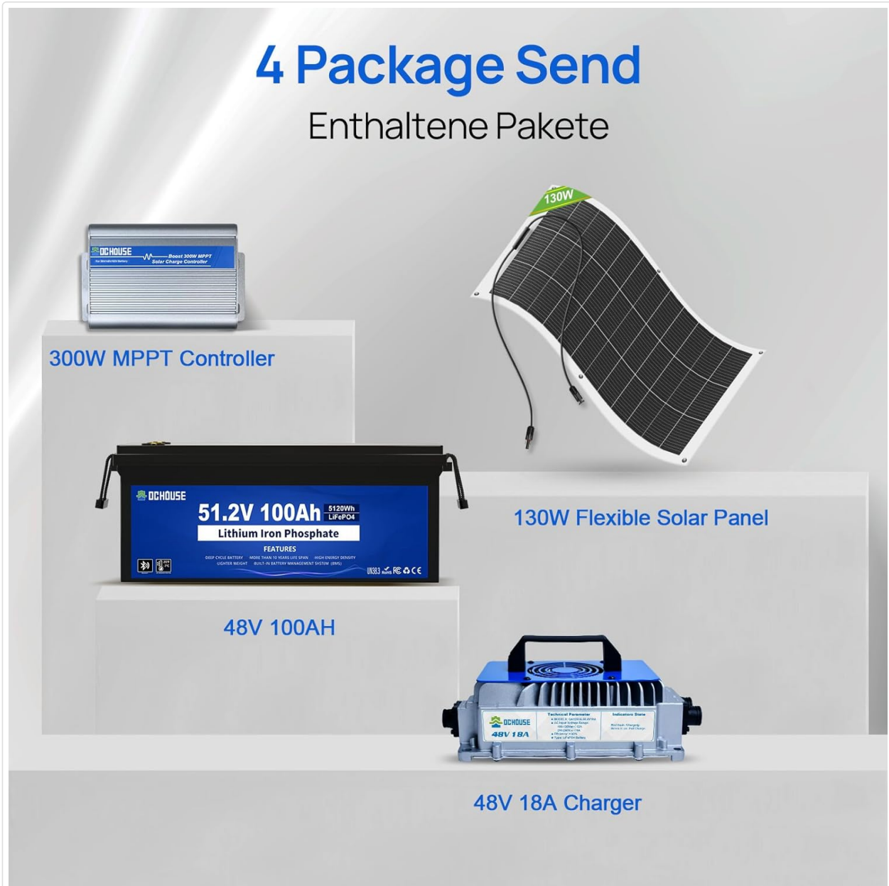
Figure 2.1: Main components of the DC HOUSE 48V Golf Cart Solar System.