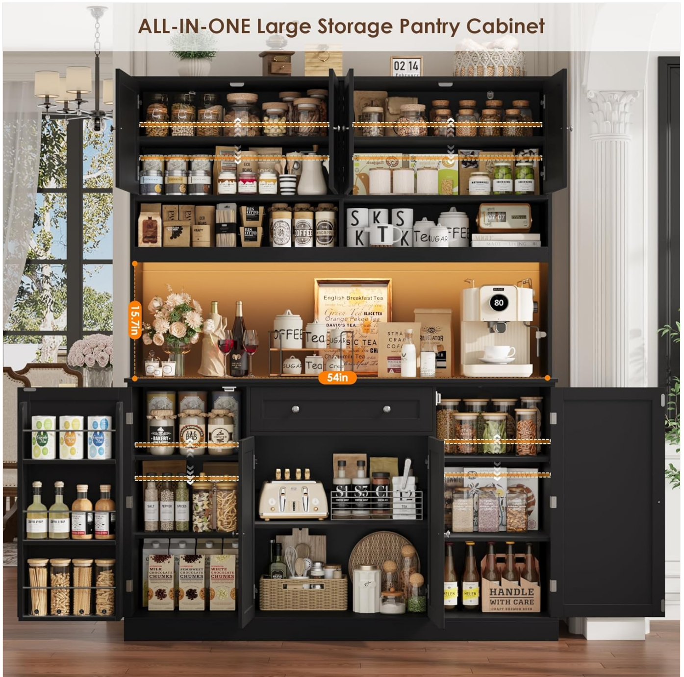
Figure 5: The cabinet's interior provides extensive storage options with adjustable shelves and a deep drawer.