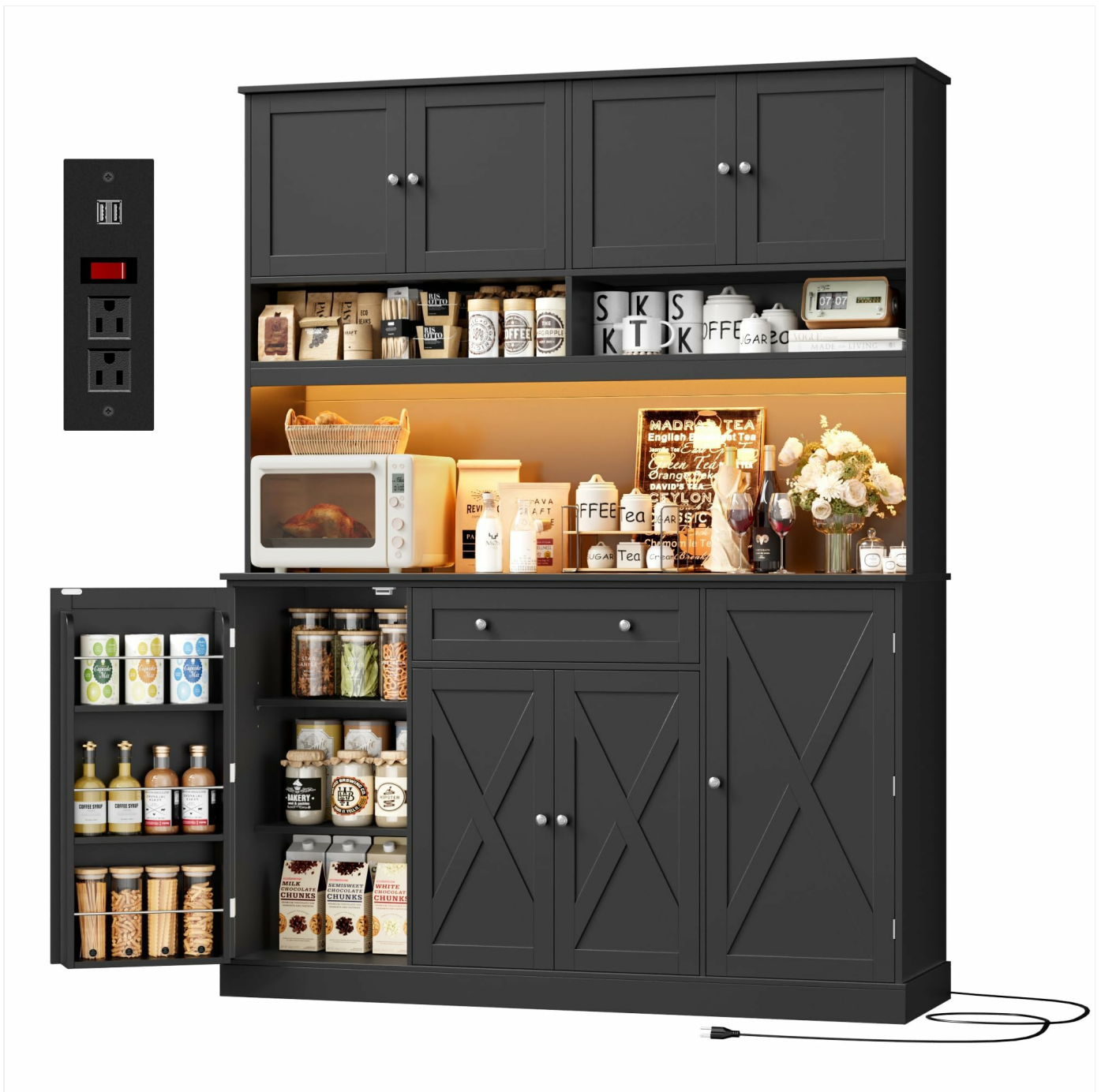
Figure 1: HIFIT Tall Kitchen Pantry Cabinet, showcasing its design and functionality in a home environment.