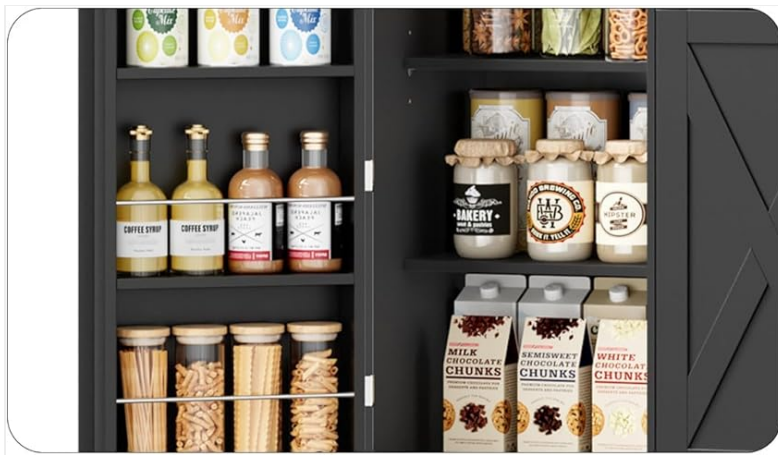
Door Adjustable Shelves