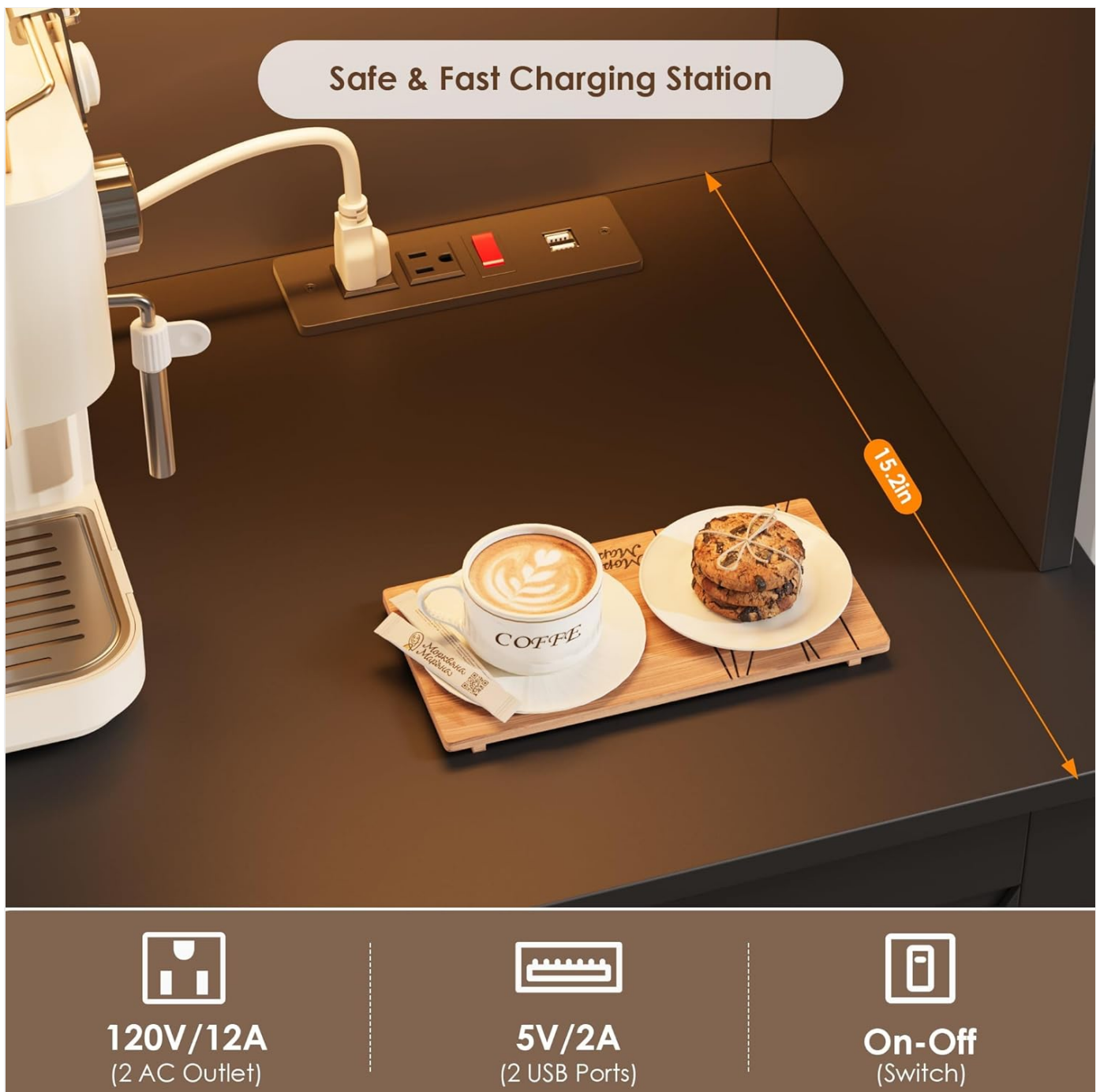
Figure 4: The charging station provides convenient power access for small appliances and devices.