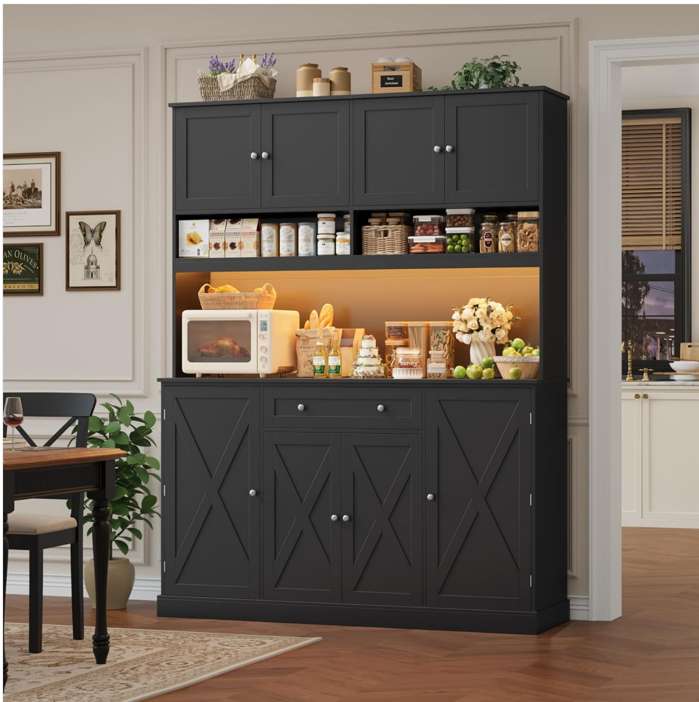
Figure 3: The LED lighting feature illuminates the countertop, providing visibility and ambiance.