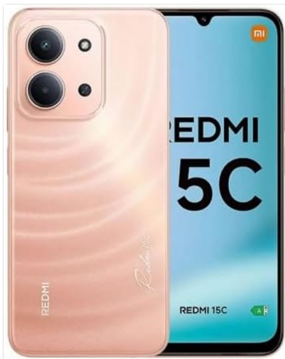
Figure 1: XIAOMI Redmi 15C Smartphone. This image displays the front and back of the Redmi 15C in Twilight Orange, highlighting its design and camera module.

This manual provides essential information and instructions for the safe and efficient use of your XIAOMI Redmi 15C 4G LTE smartphone. Please read this manual thoroughly before using your device to ensure optimal performance and longevity. Keep this manual for future reference.