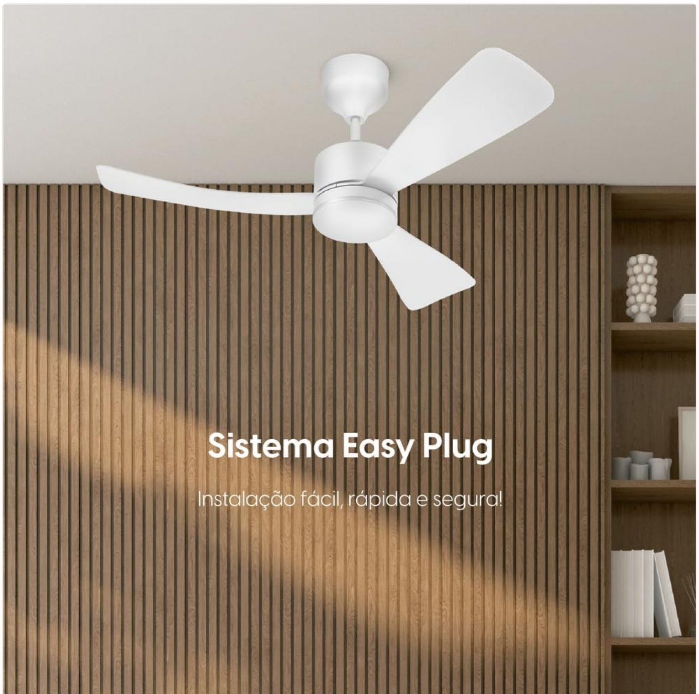
Image: The Easy Plug system, designed for quick, safe, and straightforward electrical connection during installation.