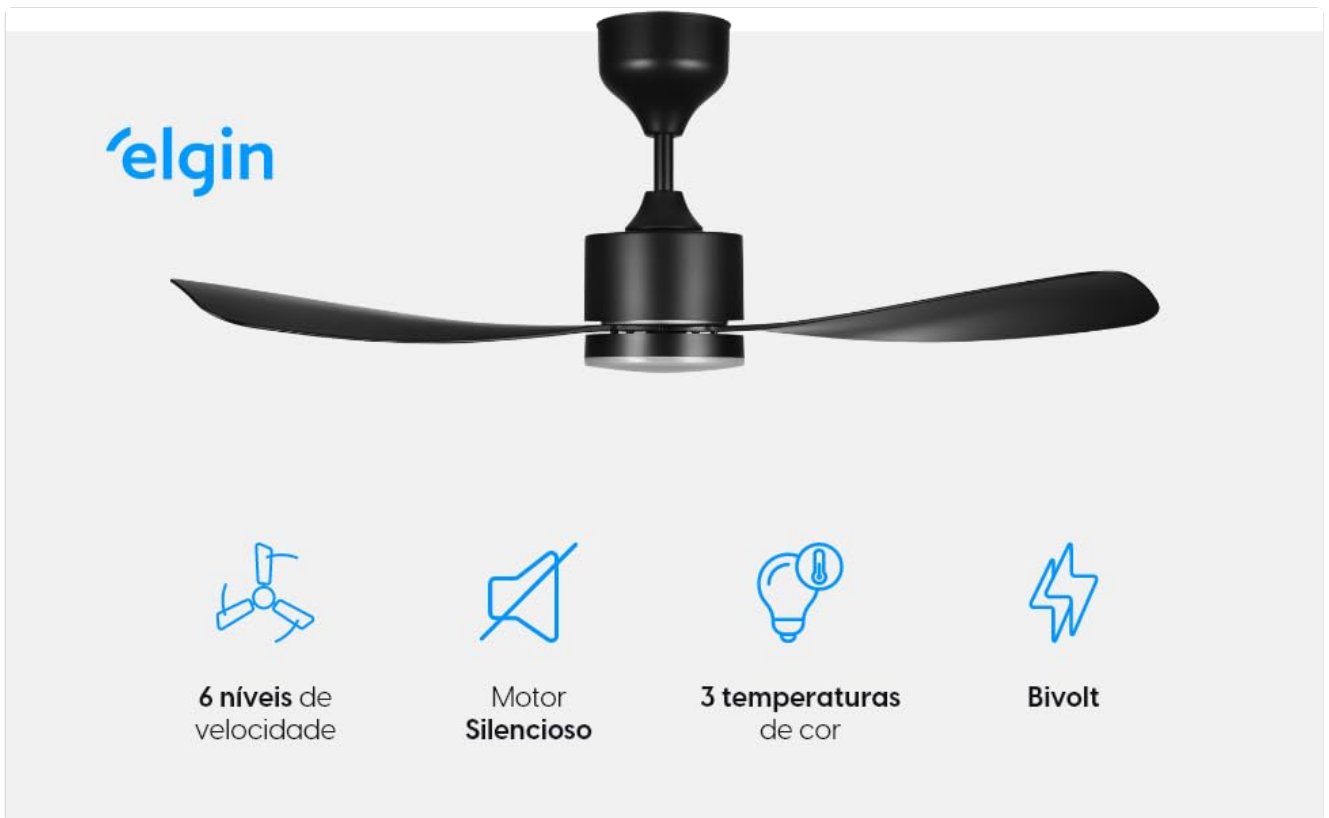
Image: Visual representation of the three adjustable LED light color temperatures: warm (3000K), neutral (4000K), and cool (6500K), demonstrating the versatility for different ambient lighting needs.