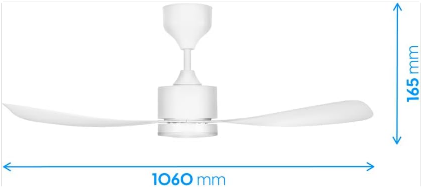
Image: A diagram illustrating the physical dimensions of the ceiling fan, indicating a total width of 1060 mm and a height of 165 mm from the ceiling mount to the bottom of the blades.

Product Dimensions: 106 cm (Depth) x 106 cm (Width) x 54 cm (Height)