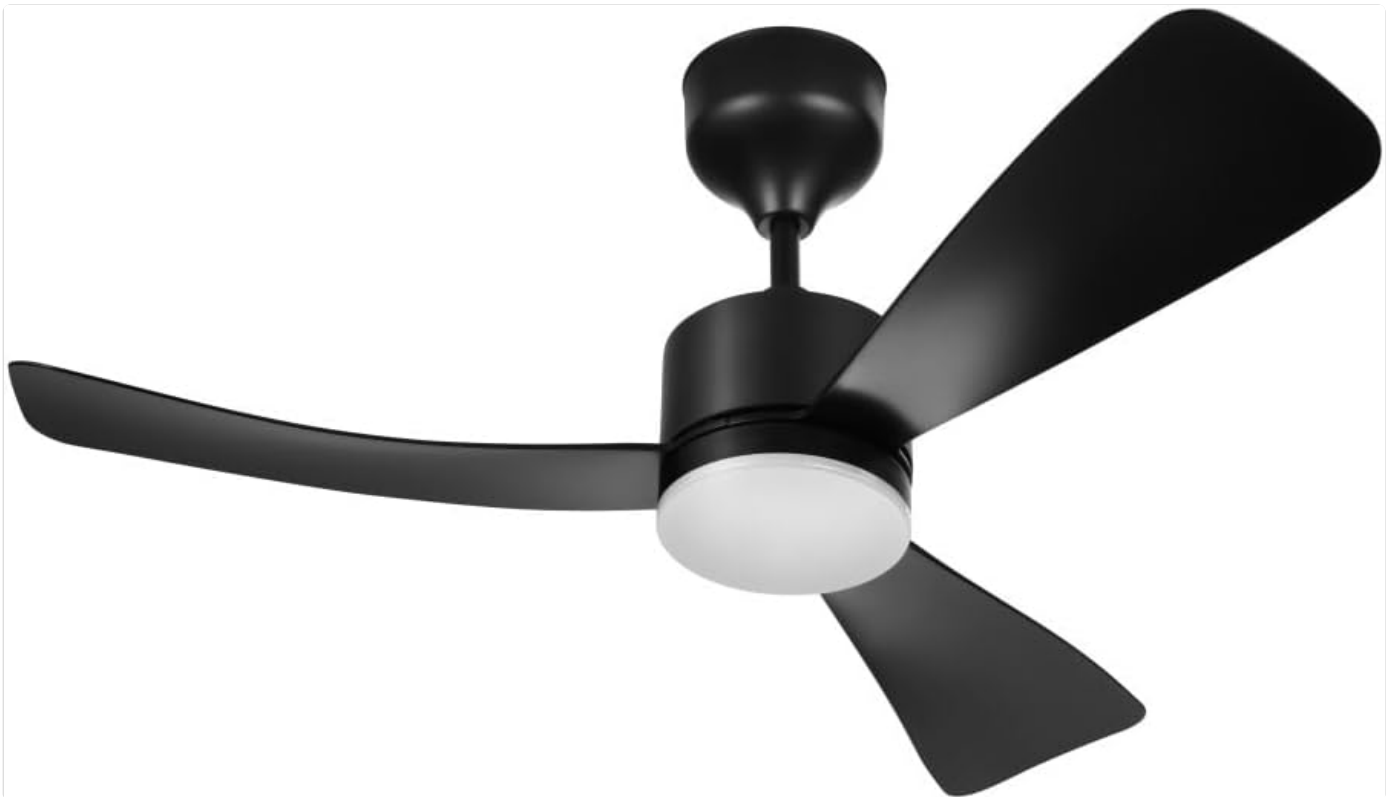
Image: The Elgin Silence Air Pro Ceiling Fan, featuring a sleek black design with three aerodynamic blades and a central integrated LED light fixture.

Thank you for choosing the Elgin Silence Air Pro Ceiling Fan. This manual provides essential information for the safe installation, operation, and maintenance of your new ceiling fan. Please read these instructions thoroughly before installation and keep them for future reference.