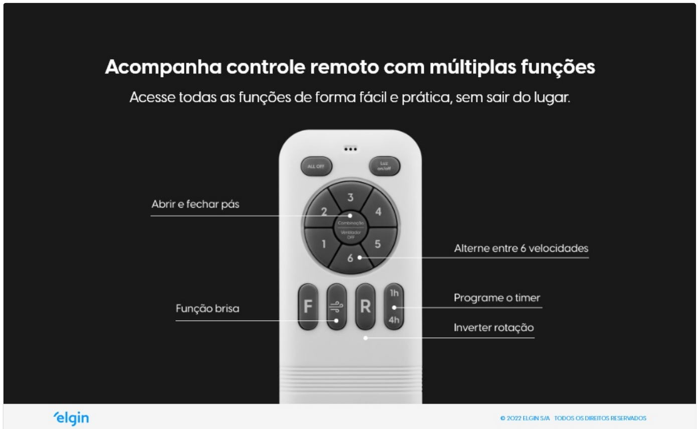
Image: An overview of the fan's key features, including its 6 speed settings, silent motor operation, 3 light color temperatures, and bivolt power compatibility.

Detailed technical specifications for the Elgin Silence Air Pro Ceiling Fan: