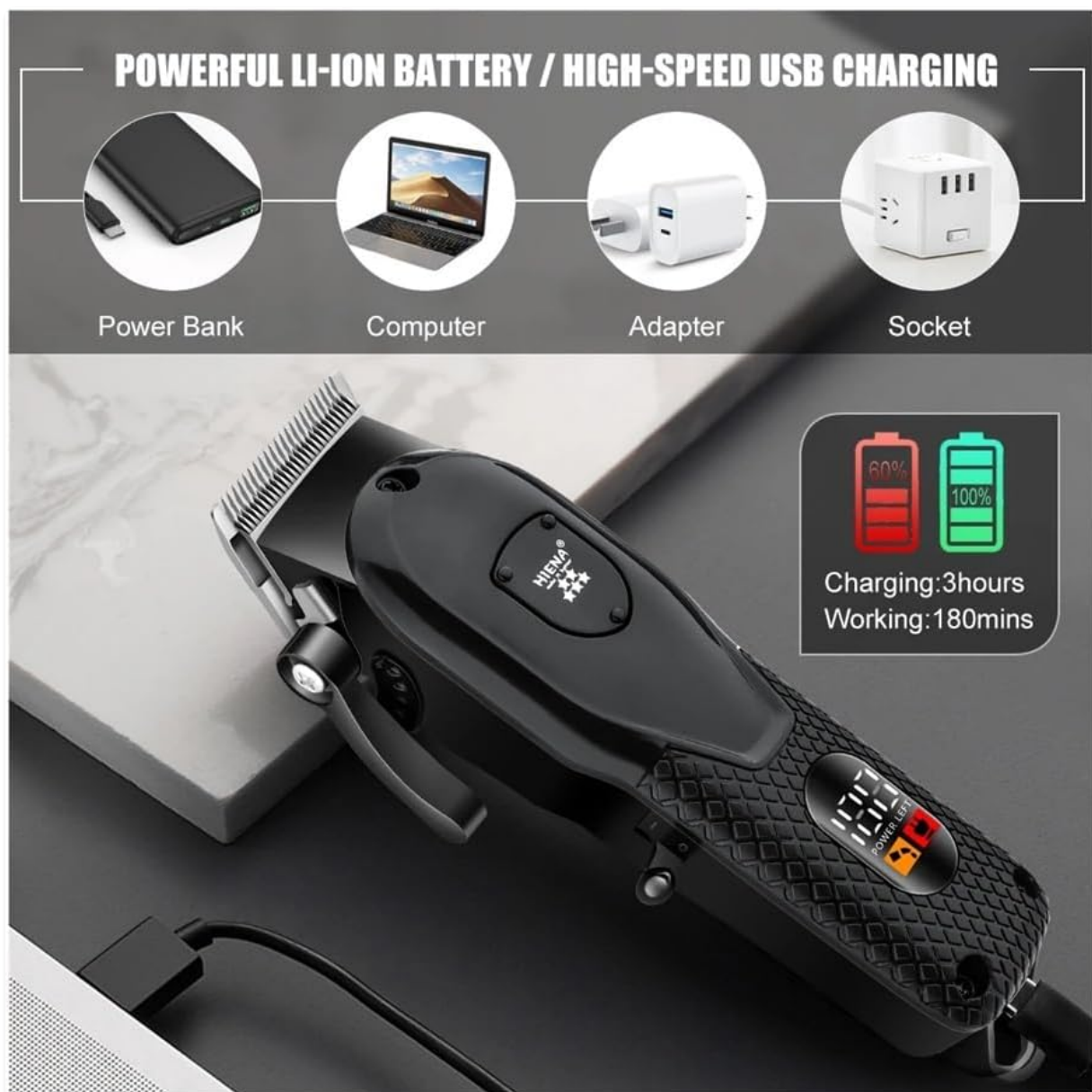
Image 5.1: Charging methods and battery indicators for the HIENA Hyn-228.