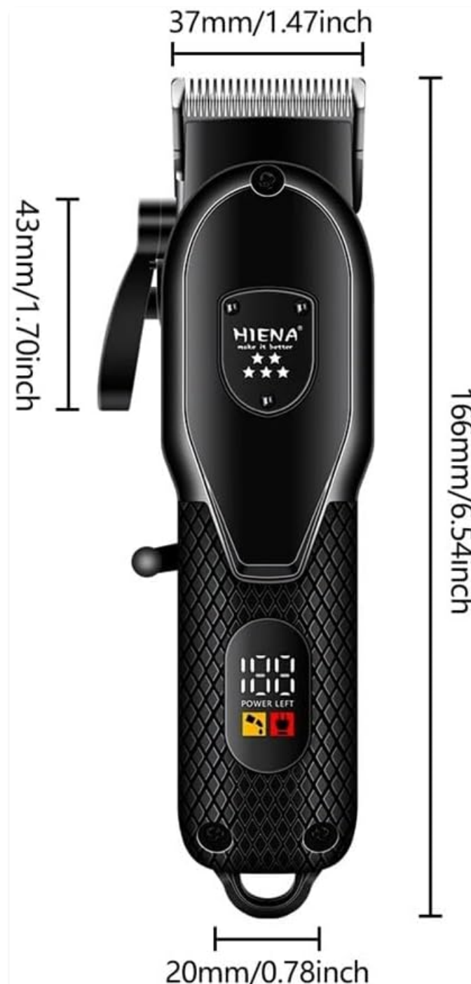
Image 9.1: Approximate dimensions of the HIENA Hyn-228 Hair Clipper.