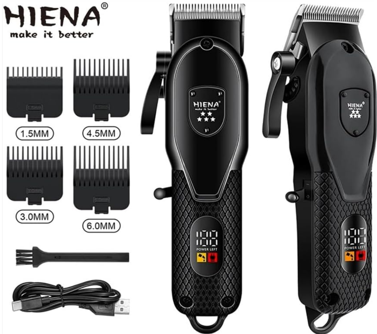
Image 3.1: HIENA Hyn-228 Hair Clipper and its accessories, including guide combs, cleaning brush, and USB cable.