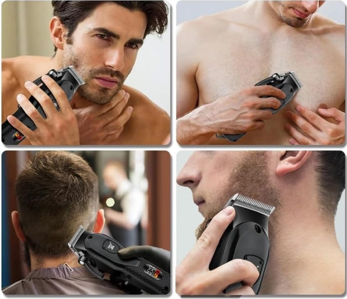
Image 6.2: Multi-purpose application of the HIENA Hyn-228 Hair Clipper.

Multi-purpose , suitable for full body hair cutting