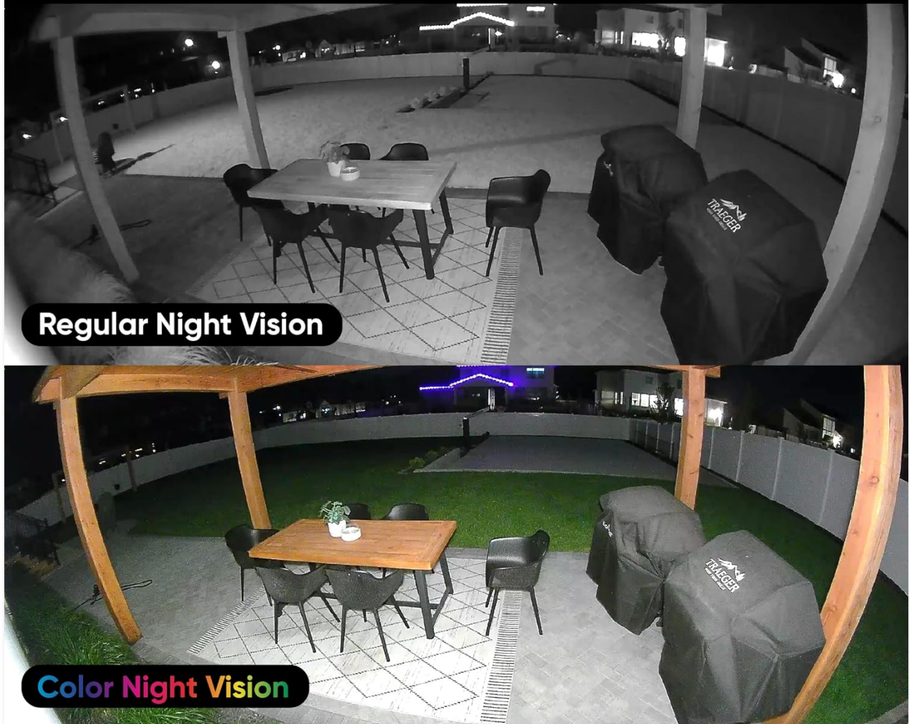
Image 3: Illustrates the superior clarity and detail provided by the 2K HD Color Night Vision feature, contrasting it with standard night vision for enhanced outdoor monitoring.

Protect double the area in greater detail with 2K HD Color Night Vision with 160° field-of-view and Wide Dynamic Range.