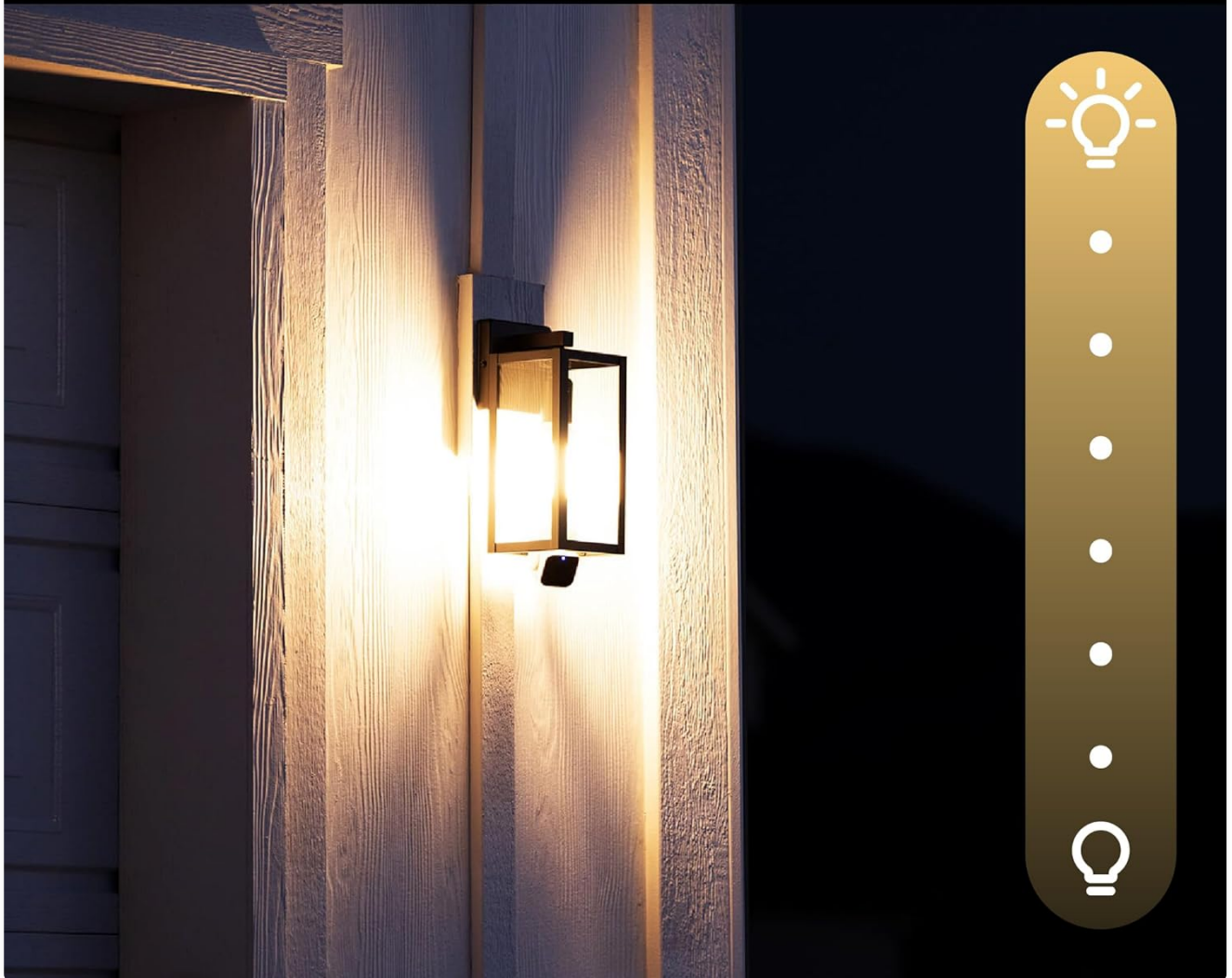
Image 4: Highlights the dimmable 800 Lumen LED feature, emphasizing the convenience of adjusting brightness through the Wyze app without needing a physical dimmer switch.

No need to install a dimmer switch, use the Wyze app to adjust the brightness with just a tap.