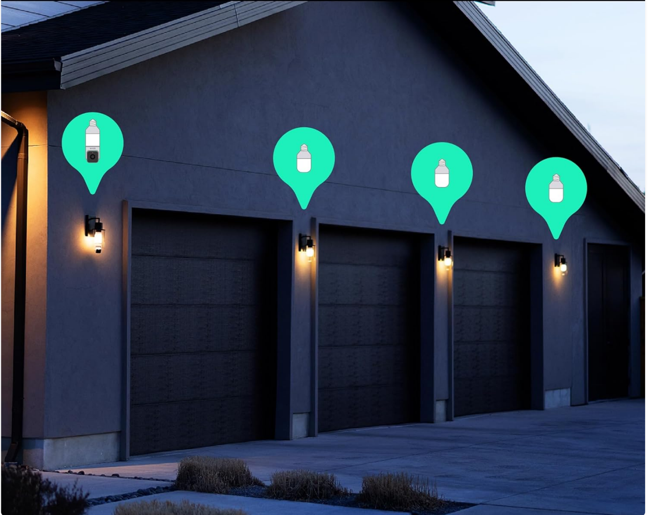
Image 5: Depicts the Group Light Control feature, showing how multiple Wyze Bulb Cameras or Accessory Bulbs can be linked for comprehensive smart lighting coverage.

Auto-connect and link the lighting of up to 5 Wyze Bulb Cameras or Wyze Accessory Bulbs (sold separately) for full coverage smart lighting.