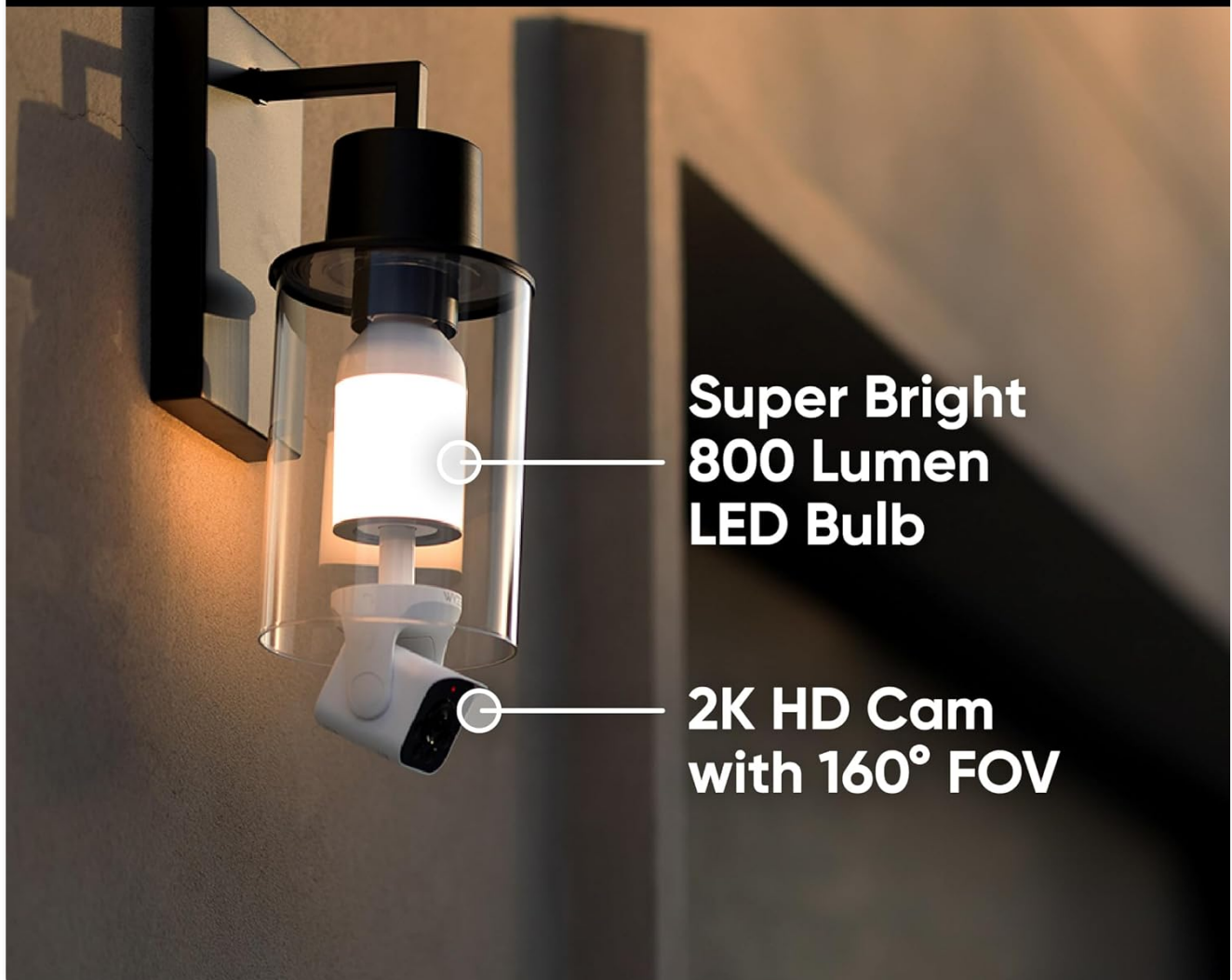
Image 1: WYZE Bulb Cam seamlessly integrated into an outdoor light fixture, showcasing its dual functionality as a bright LED bulb and a security camera.

An all-in-one outdoor security solution, combining smart lighting and a smart security camera, all powered by a single light socket.