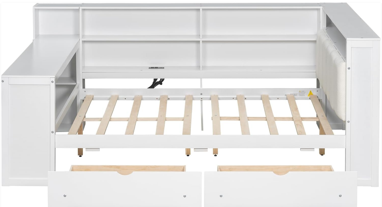
Figure 4.1: Overview of the bed frame structure during assembly, highlighting the desk and storage areas.