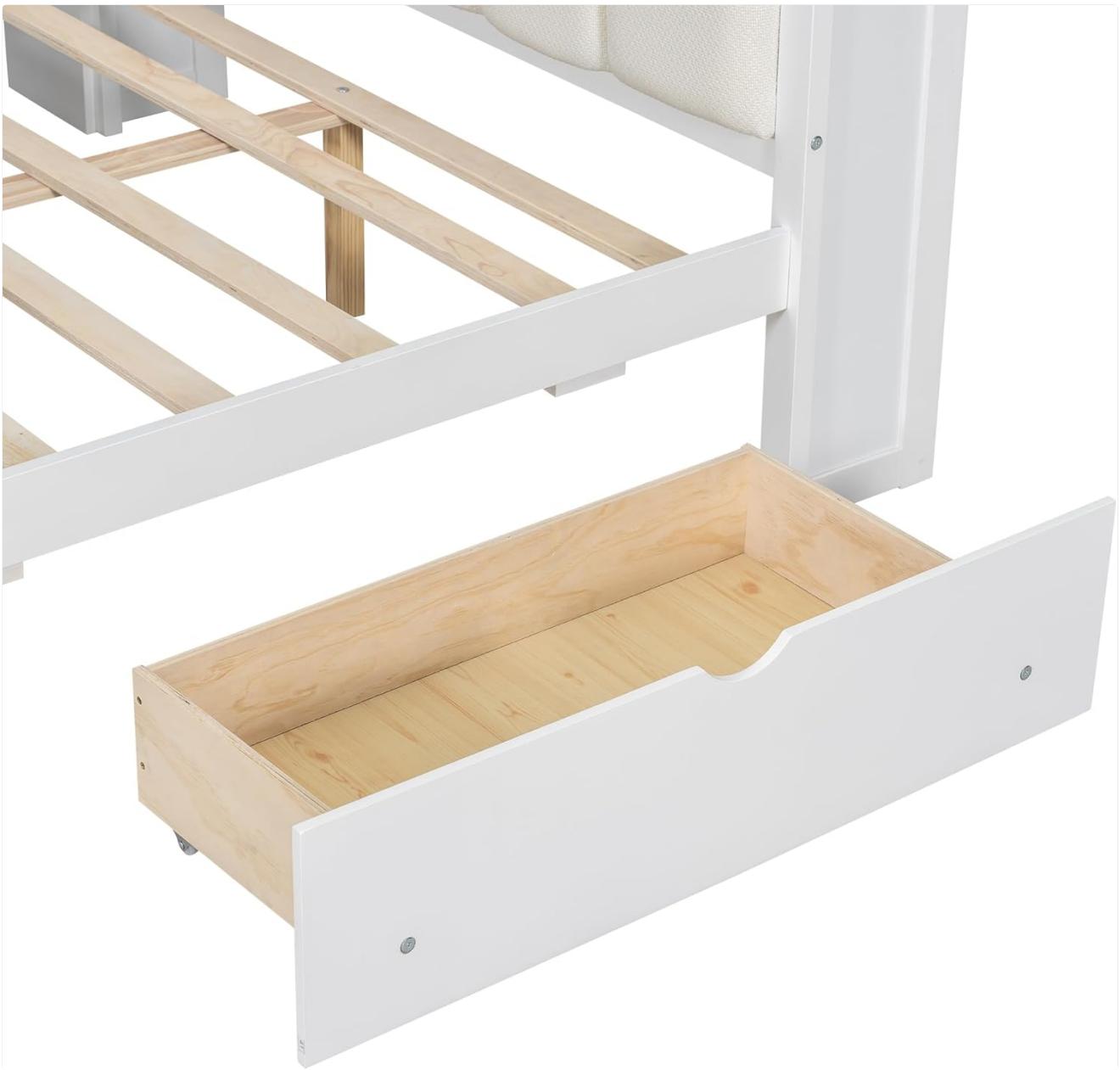
Figure 5.3: Detail of an under-bed storage drawer.