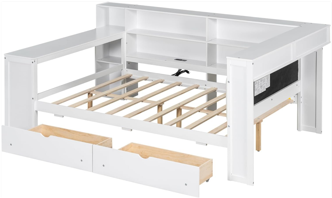
Figure 4.2: Front view illustrating the under-bed drawers and slat system.