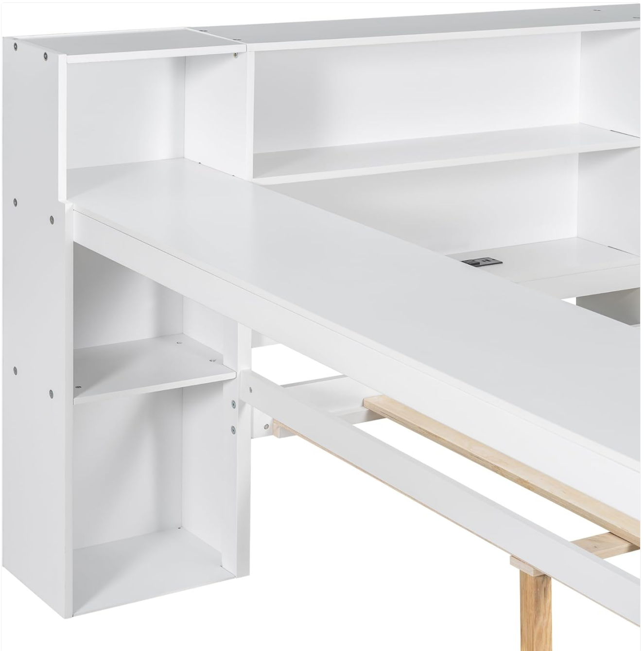
Figure 5.1: Detail of the charging station and desk area.