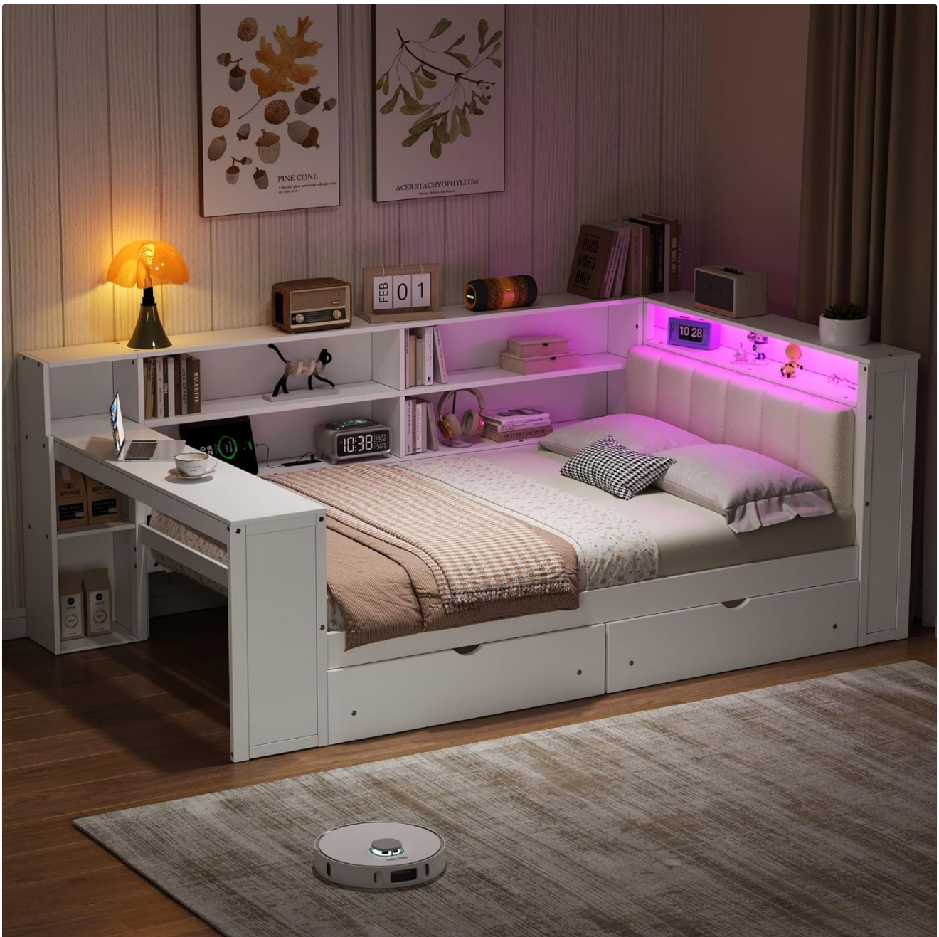
Figure 5.2: LED lighting in operation, displaying one of the adjustable colors.