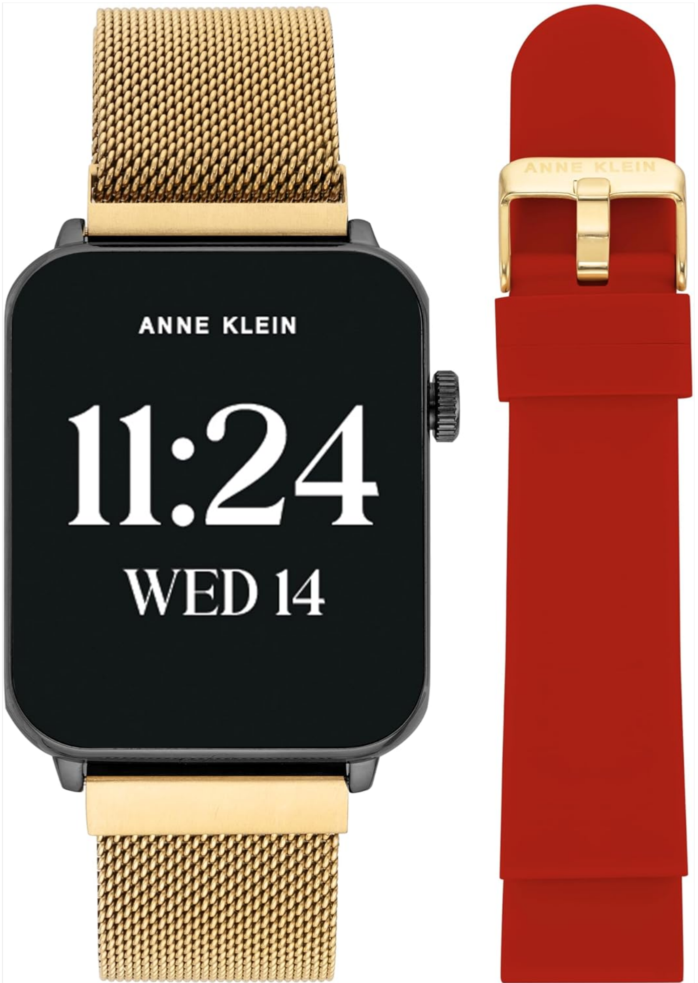
Figure 1: Anne Klein Connect It Stellar Smartwatch with gold mesh band.