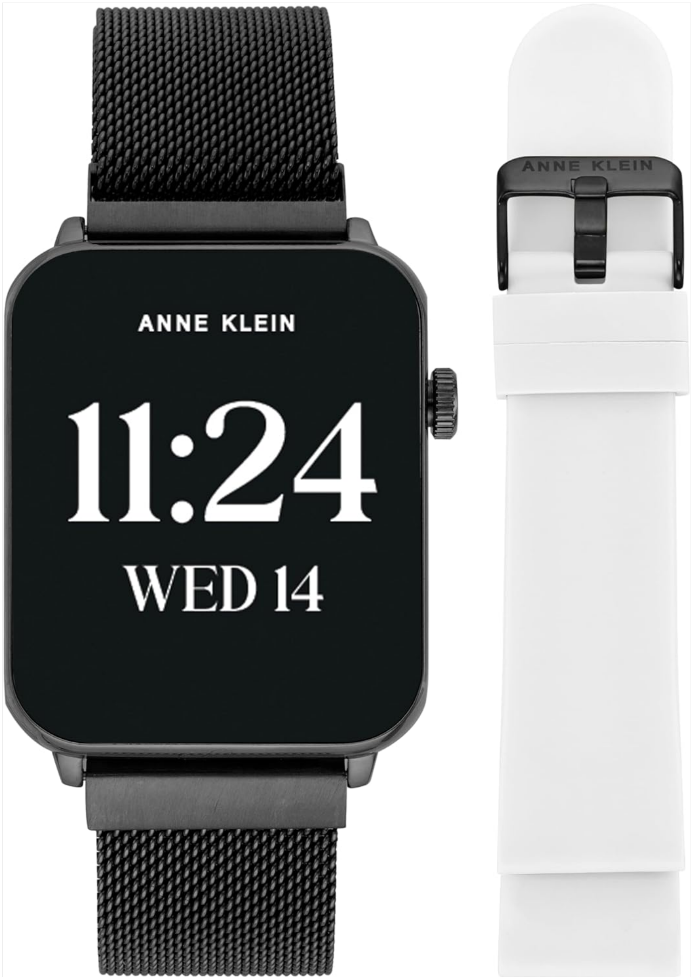
Figure 3: Anne Klein Connect It Stellar Smartwatch shown with a black silicone band, illustrating band interchangeability.