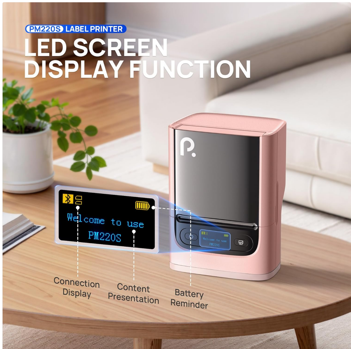
Figure 4: LED screen display functions for real-time status monitoring.