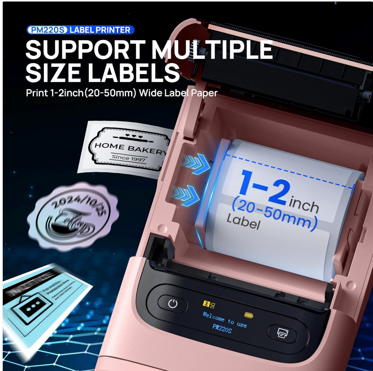
Figure 3: Proper loading of label tape into the PM220S.