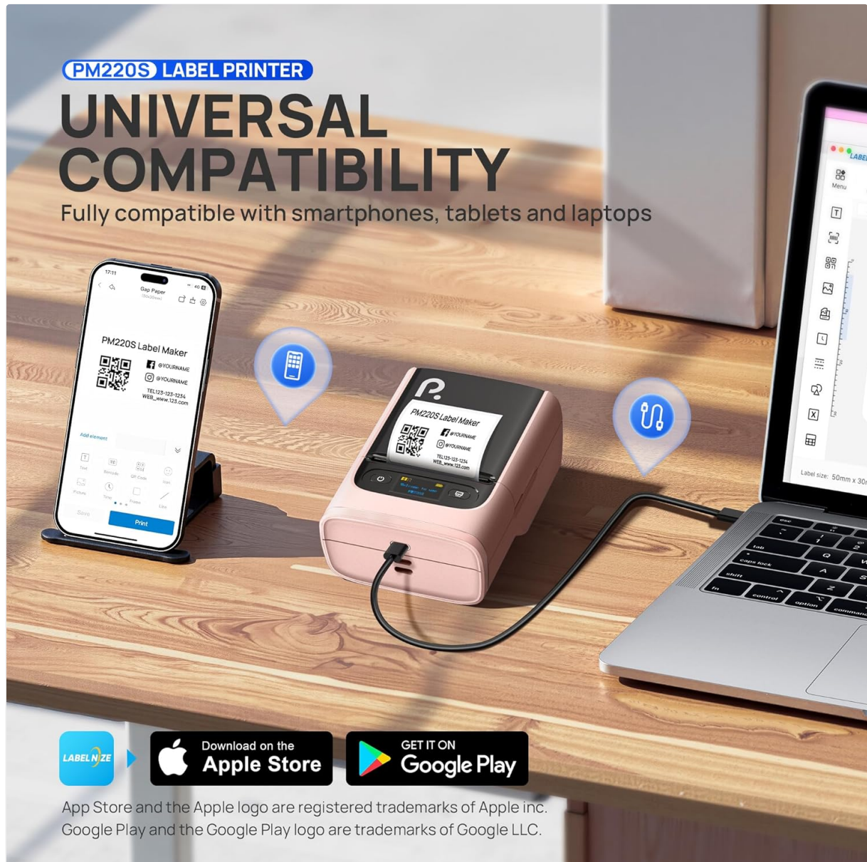
Figure 2: Universal compatibility with smartphones and laptops for app and driver installation.

For mobile devices (iOS/Android), download the "Labelnize" app from your respective app store. For PC users, visit polono.com to download the necessary driver and application.