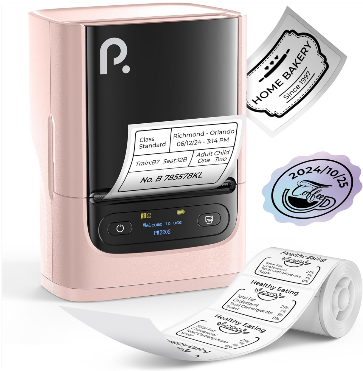
Figure 1: POLONO PM220S Label Maker Machine with sample labels.