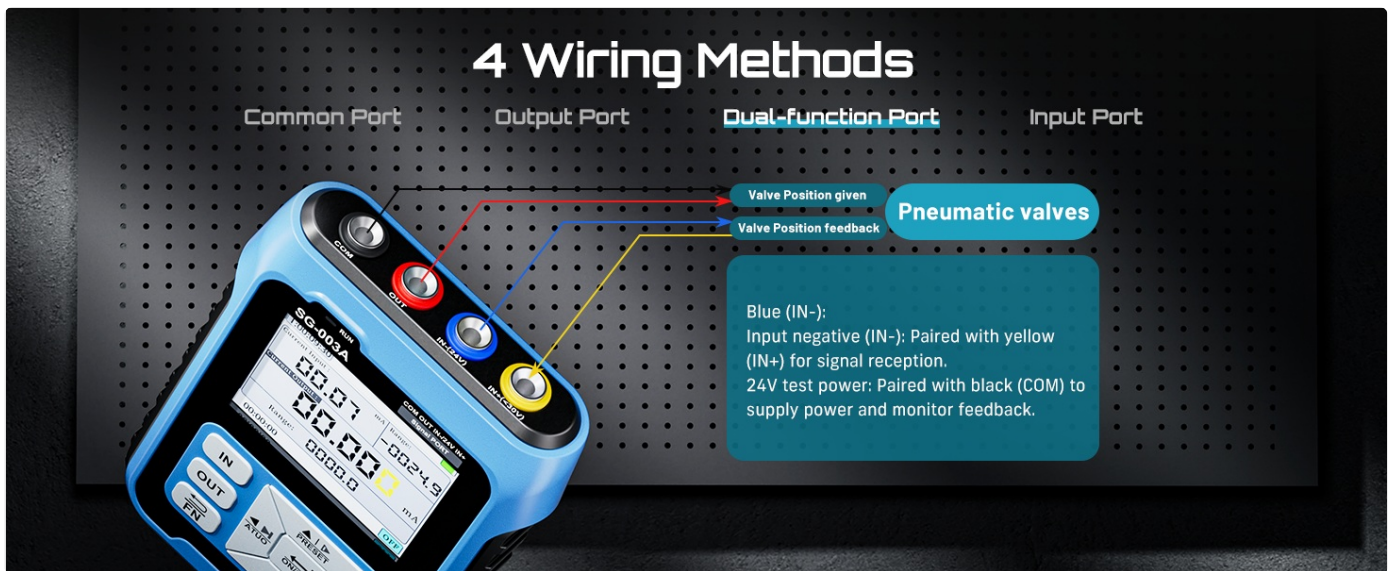
Figure 5.4: Output Port Wiring.

Dual-Function Port Wiring (24V Power): Use the Blue (IN-) and Black (COM) ports to supply 24V power and monitor feedback, for example, with pneumatic valves.