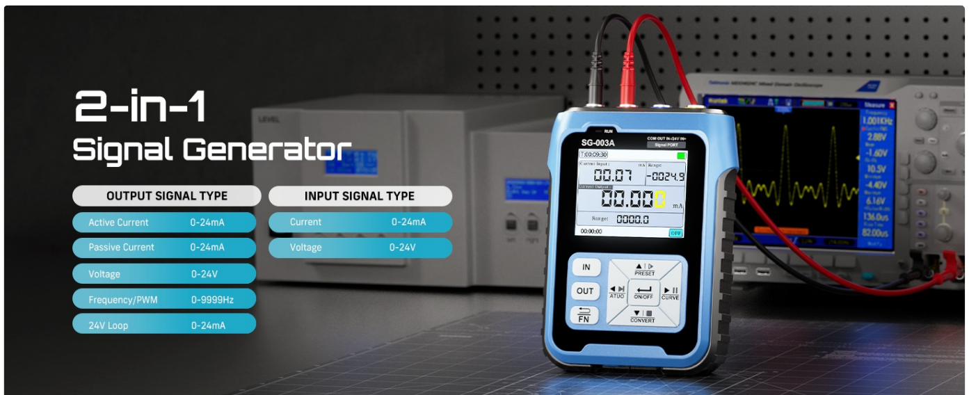
Figure 7.1: Silicone Protection on the SG-003A.

The device is designed with silicone protection on both sides and integrated non-slip silicone stripes for durability and grip. While this offers protection, avoid dropping the device from significant heights.