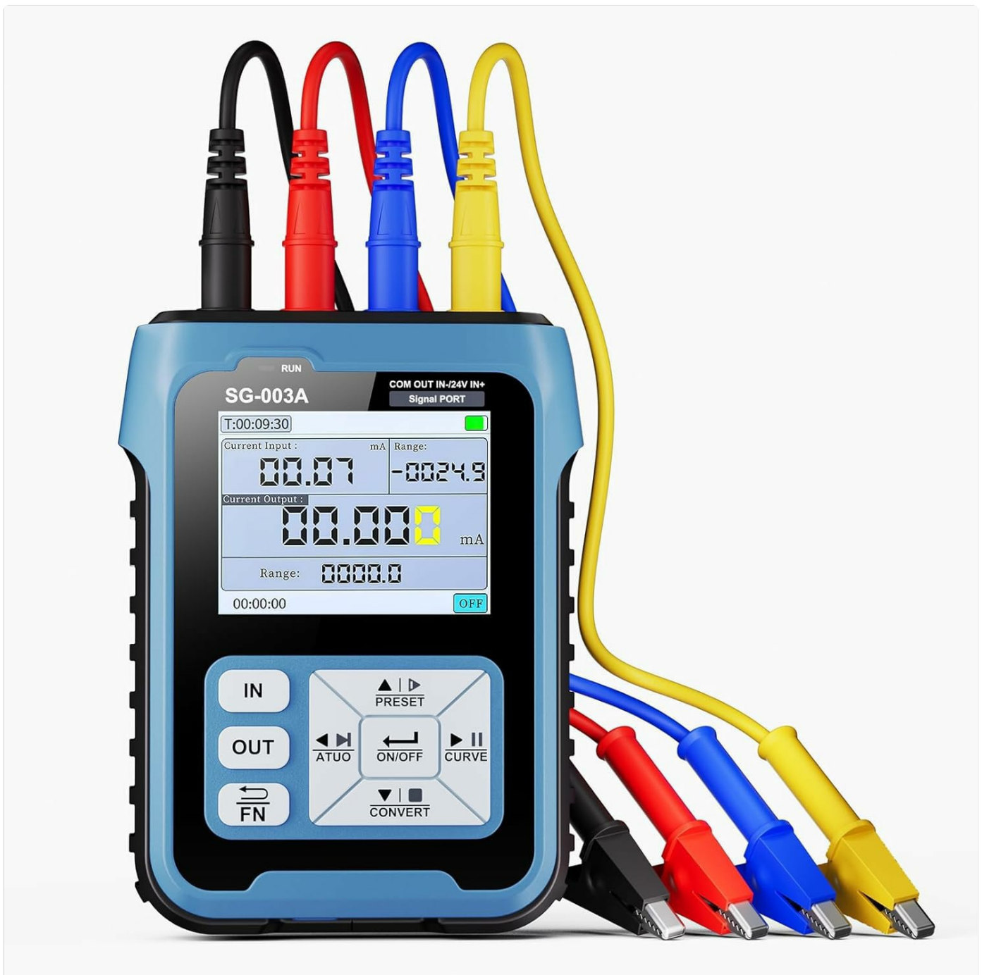
Figure 1.1: Overview of the SEESII SG-003A Multifunctional Signal Generator.