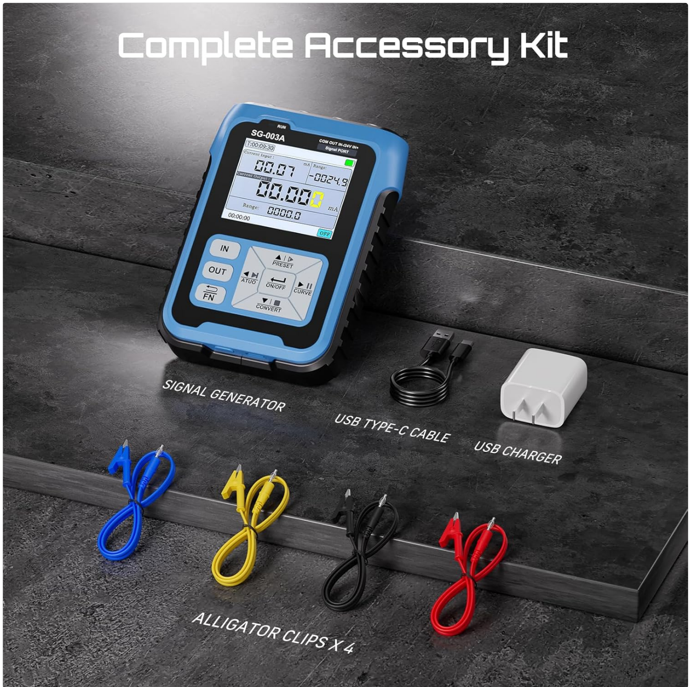
Figure 3.1: Complete Accessory Kit.