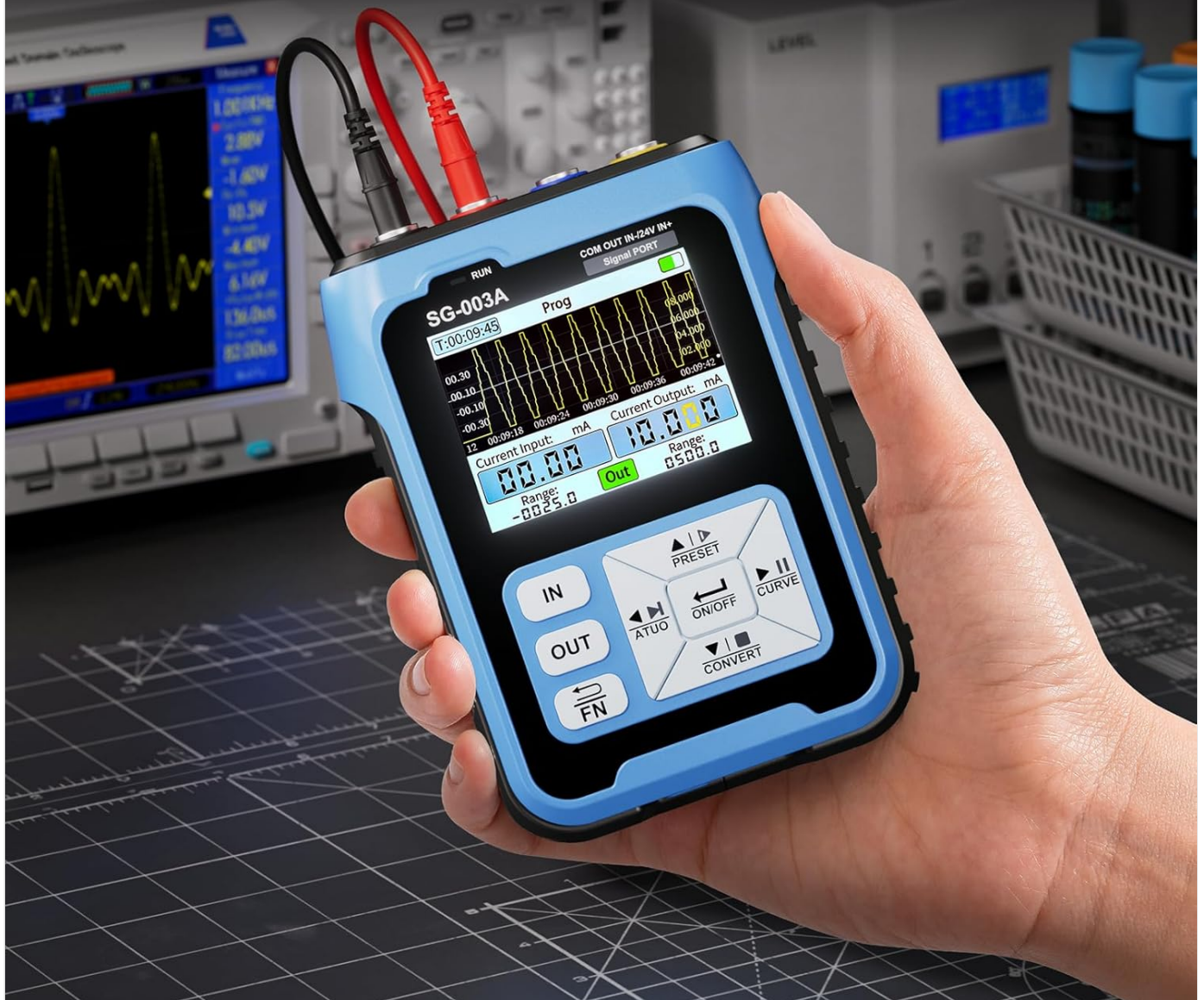
Figure 6.1: Real-Time Curve Monitoring in action.