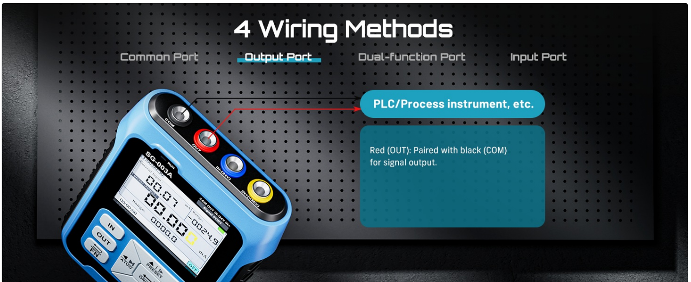
Figure 5.3: Port Layout and General Connection Diagram.