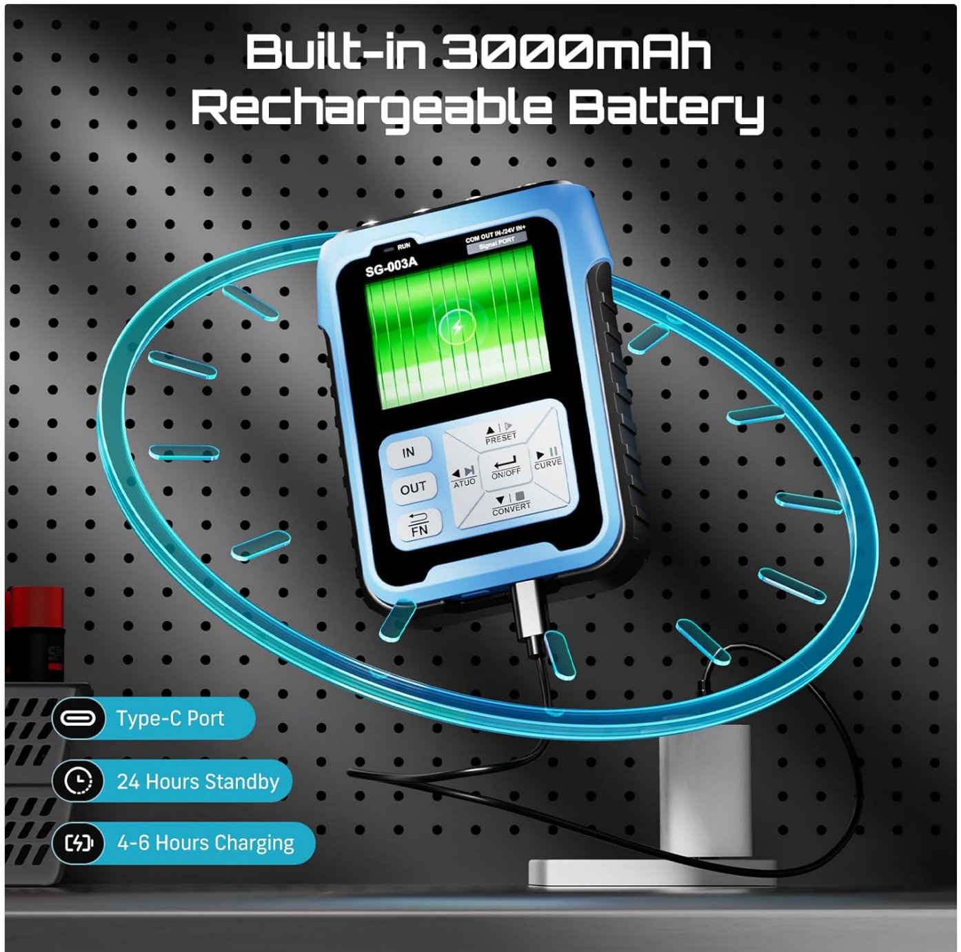
Figure 5.1: Charging the SG-003A via Type-C Port.

The SG-003A comes with a built-in 3000mAh Lithium Ion battery. Before first use, fully charge the device using the provided USB Type-C cable and USB charger. A full charge typically takes 4-6 hours and provides up to 8 hours of continuous use or 24 hours of standby time.