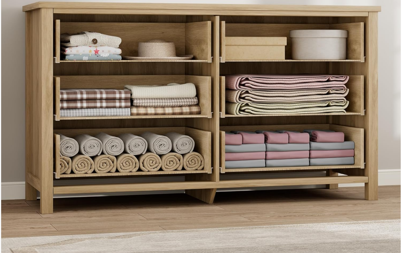
Image: An infographic illustrating the types and quantities of items that can be stored in a 6-drawer dresser, such as hats, scarves, socks, pants, blouses, sleeves, tissue, and diapers.