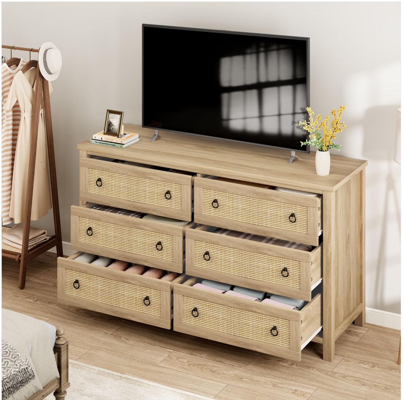
Image: The dresser with several drawers partially open, revealing neatly folded clothing and other items, demonstrating its storage capacity.