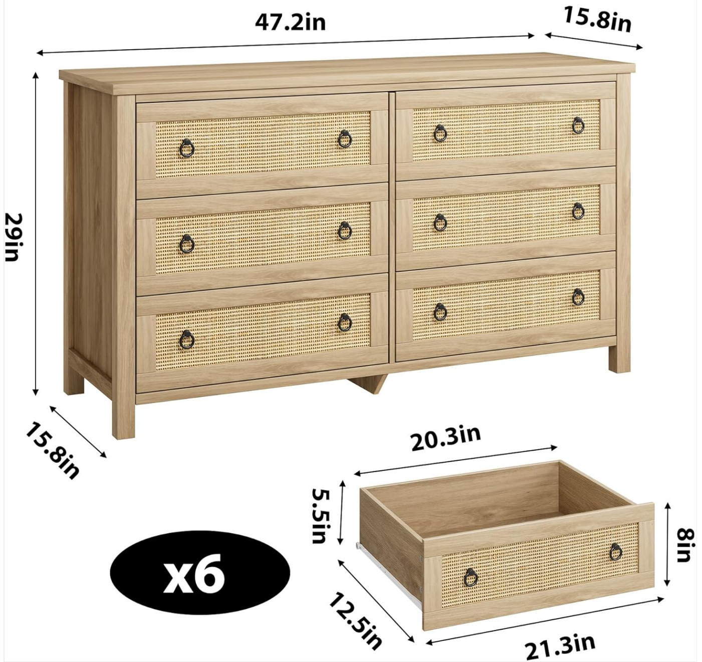
Image: A diagram illustrating the overall dimensions of the dresser (47.2"W x 15.8"D x 29"H) and the internal dimensions of a single drawer (21.3"W x 12.5"D x 8"H).