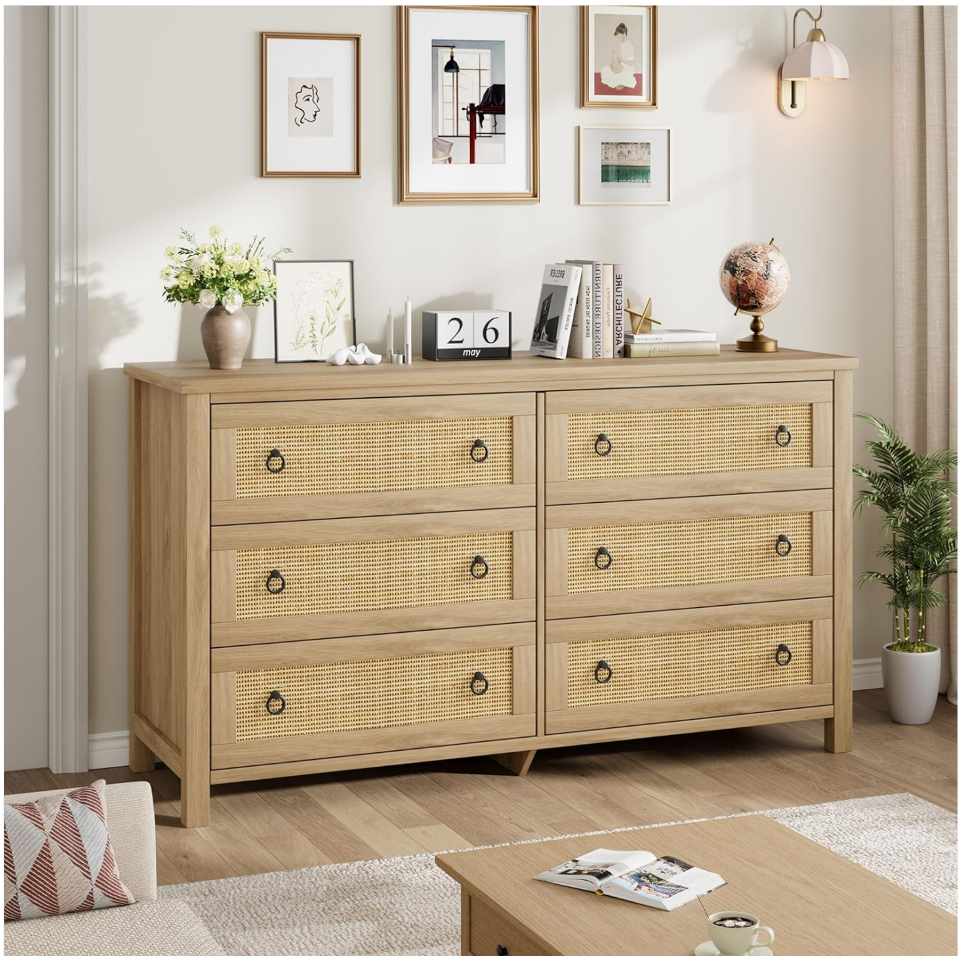
Image: The GarveeHome 6-Drawer Rattan Dresser in a living room setting, showcasing its natural oak finish and rattan drawer fronts.