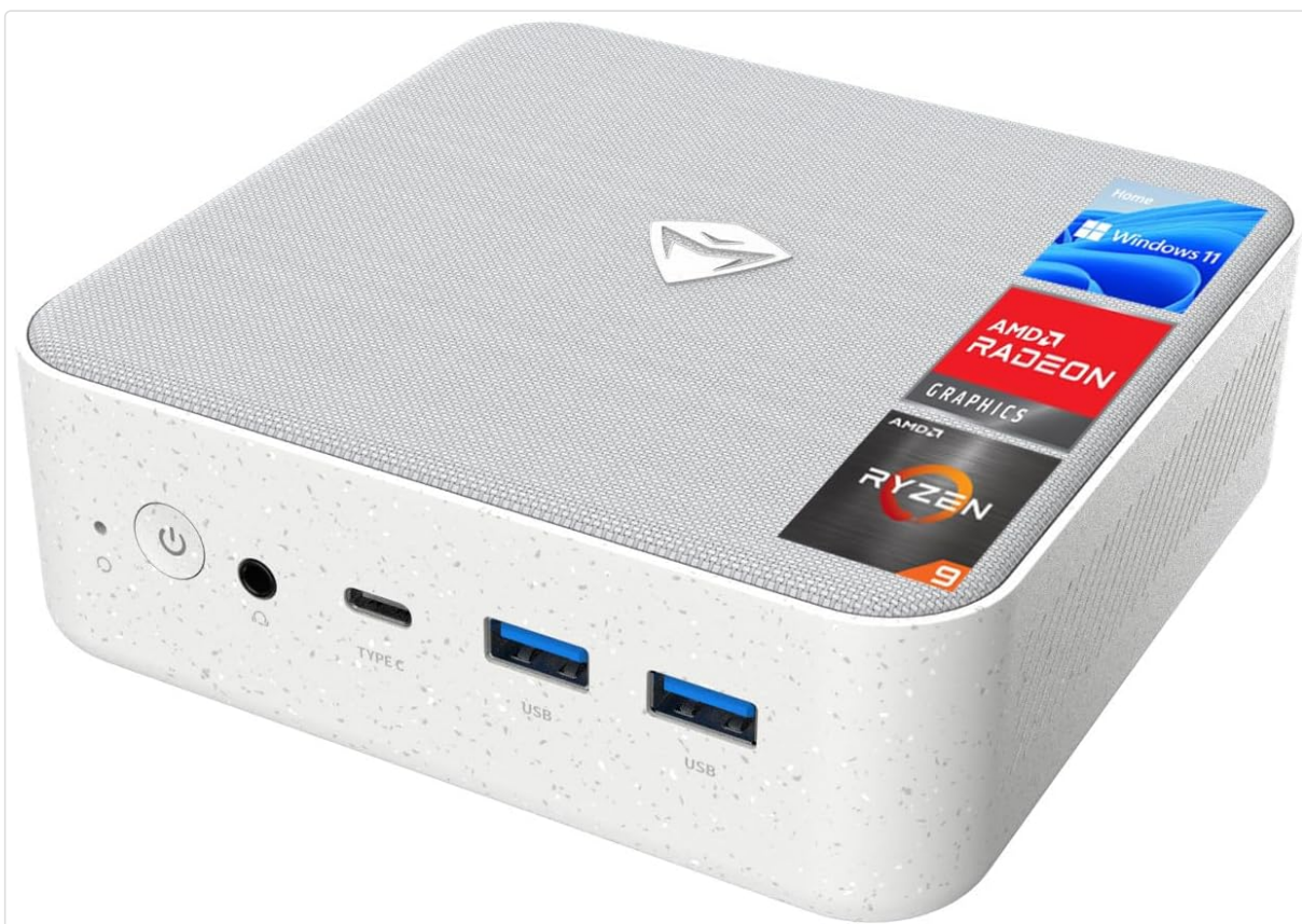
Image 1.1: Front view of the Machenike Machcreator Mini2 7940H Mini Desktop, showcasing its compact design and front

The Machenike Machcreator Mini2 7940H is a compact and powerful mini desktop computer designed for various computing tasks. It features an AMD Ryzen 9 7940H processor, AMD Radeon Graphics, 16GB DDR5 RAM, and a 1TB PCIe M.2 SSD, running on Windows 11 Home.