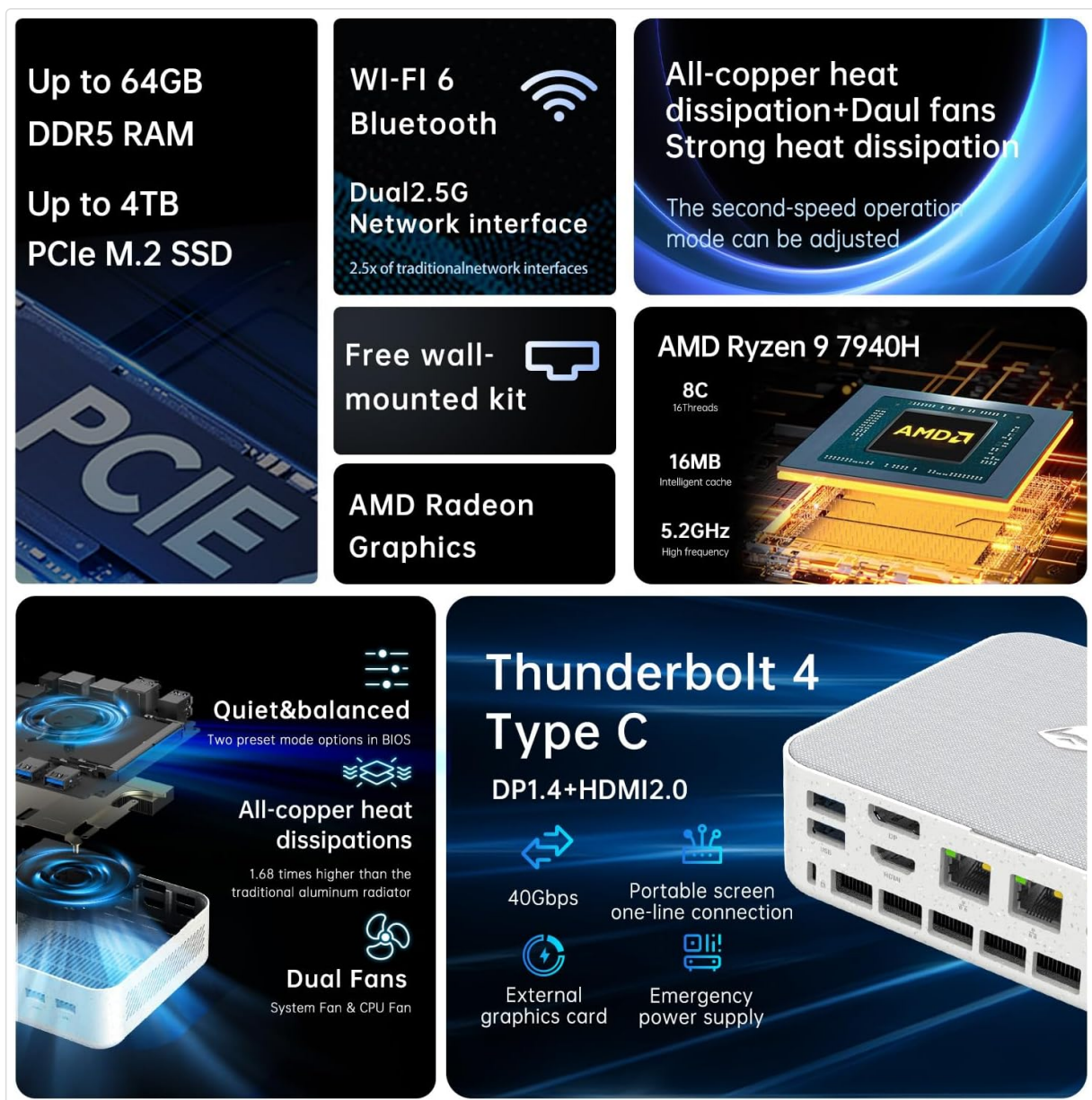
Image 7.1: Overview of key features including RAM, SSD, Wi-Fi, heat dissipation, CPU, and graphics.