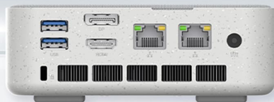
Image 4.1: Diagram illustrating the front and rear port configurations of the Machenike Machcreator Mini2.

Dual USB 3.2 DP 1.4 HDMI 2.0 Dual 2.5G Network interface Kensington Safety lock port