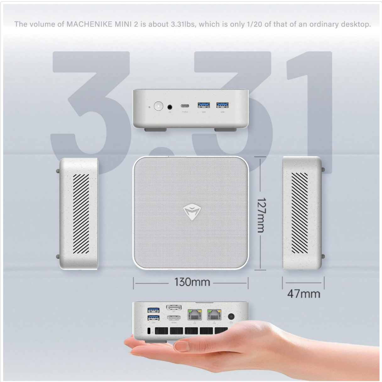
Image 7.2: Diagram illustrating the physical dimensions of the Machenike Machcreator Mini2.