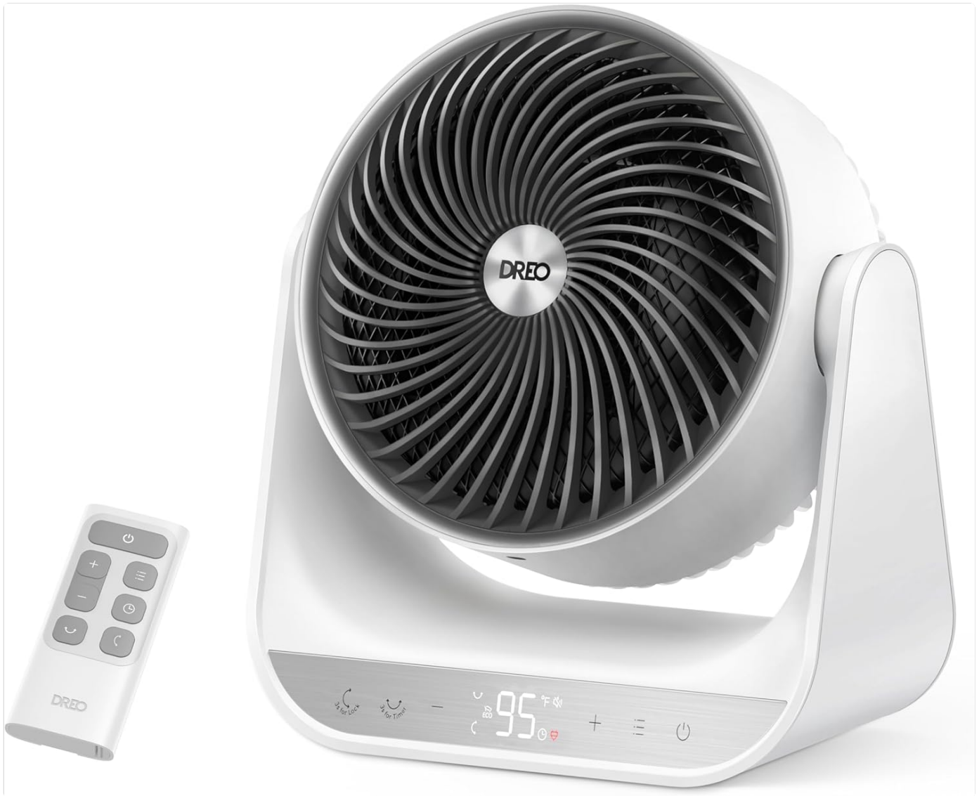
Image: The Dreo Whole Room Heater 714 in white, accompanied by its remote control. The heater features a digital display and touch controls on its base.

heating technology, multiple heat and fan settings, and comprehensive safety mechanisms.