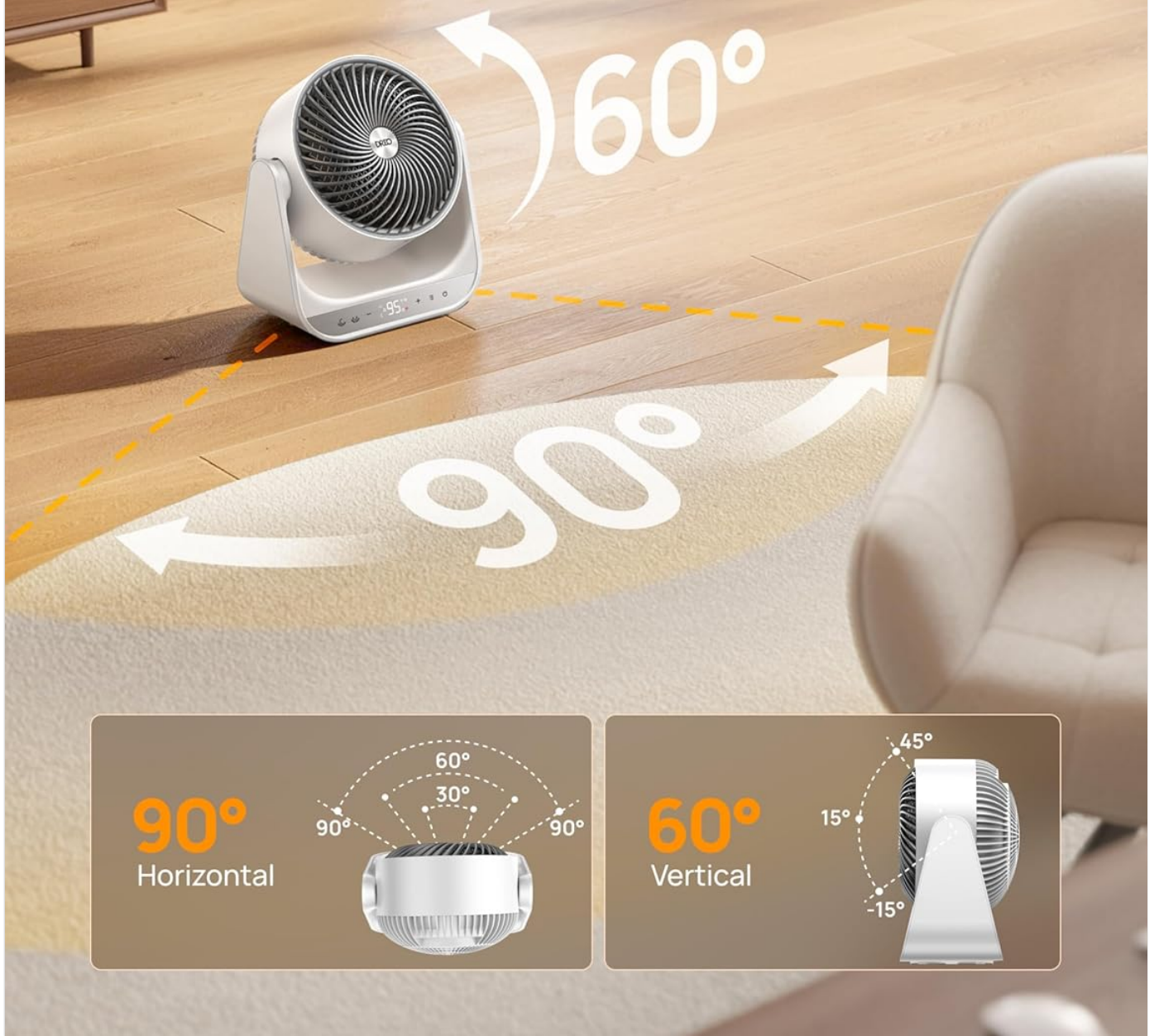
Image: The Dreo Whole Room Heater 714 illustrating its 90-degree horizontal and 60-degree vertical oscillation capabilities, ensuring wide heat distribution and eliminating cold spots.