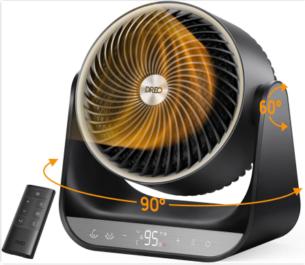
The Dreo Whole Room Heater 714, showcasing its compact design and included remote control.

The Dreo Whole Room Heater 714 (Model DR-HSH034) is a 1500W PTC ceramic heater designed to provide efficient and widespread warmth for indoor spaces. It features advanced oscillation capabilities and multiple heat settings for customized comfort.