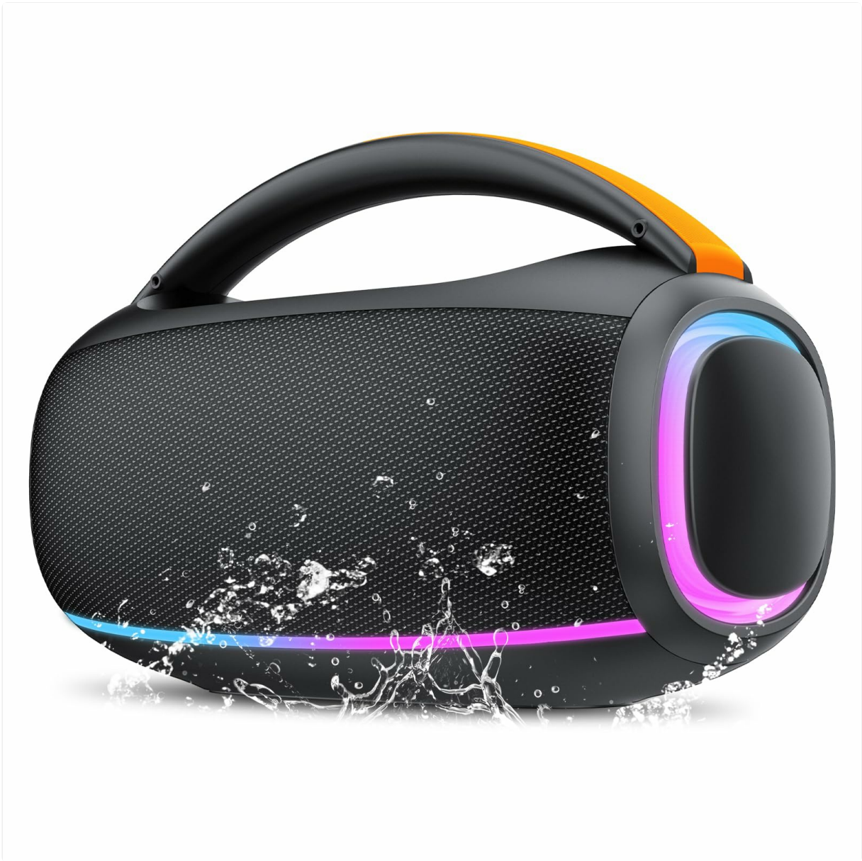
Figure 1: Front view of the Ajblg S2-1 Portable Bluetooth Speaker, showcasing its handle and illuminated side panels.