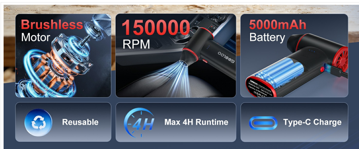
Image: Key features of the GOOLOO F3 Air Duster, including its brushless motor, high RPM, battery capacity, runtime, and Type-C charging.