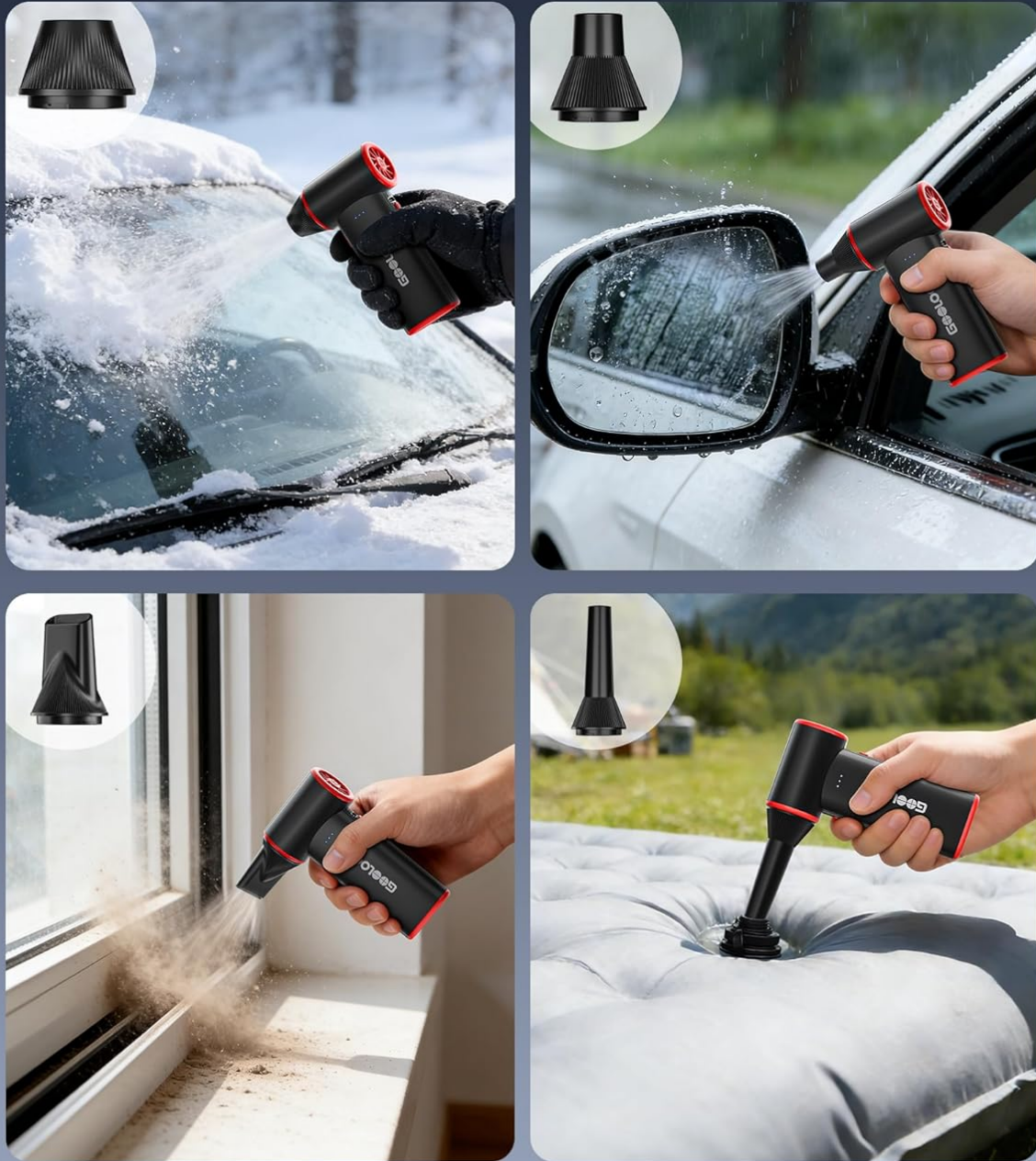
Image: Cleaning a car interior with the GOOLOO F3 Air Duster.

Video: Official demonstration of the GOOLOO F3 Electric Air Duster in various cleaning scenarios.