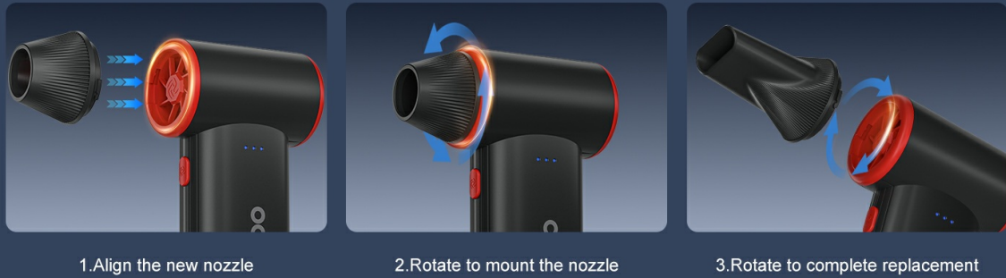
Image: Step-by-step guide for easy nozzle installation on the air duster.