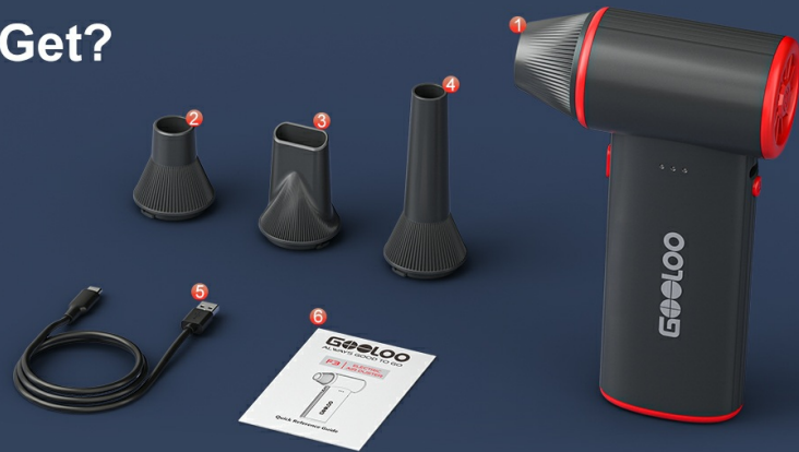
Image: The GOOLOO F3 Electric Air Duster with its included accessories: short, flat, and long nozzles, a Type-C charging cable, and the user manual.