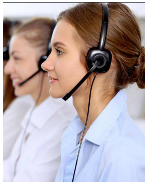
Image: Overview of GOOLOO's customer service and warranty policies.

your product or visit the official GOOLOO website.