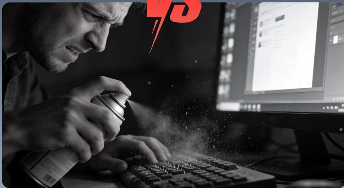
Image: Cleaning a keyboard with the GOOLOO F3 Air Duster.