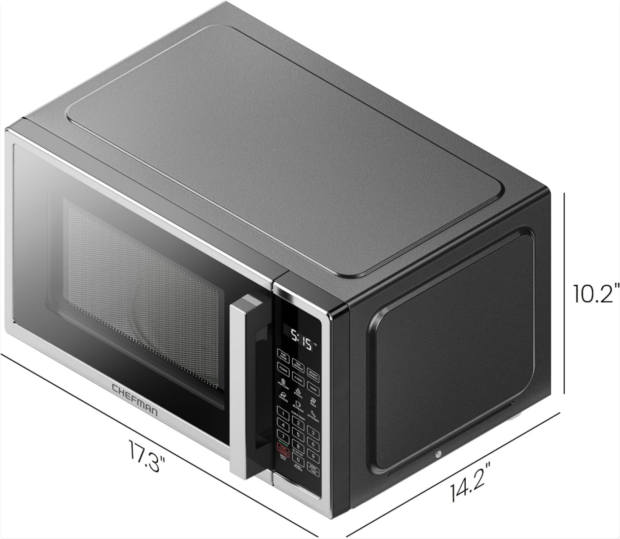
Dimensions of the Chefman Countertop Microwave Oven.