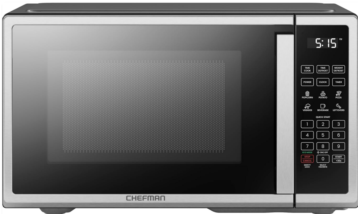
Front view of the Chefman 0.7 Cu. Ft. Digital Stainless Steel Microwave Oven.

Thank you for choosing the Chefman Countertop Microwave Oven. This 0.7 cubic foot, 700-watt digital microwave is designed for convenience and efficiency in any kitchen. It features 6 auto menus, 10 power levels, Eco Mode, a memory function, mute function, and a child safety lock. This manual provides essential information for safe and effective use of your appliance.