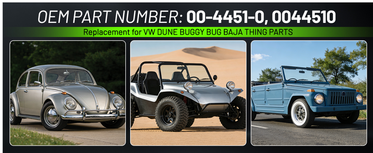
Image: Examples of compatible vehicles including a VW Bug, Dune Buggy, and VW Baja.