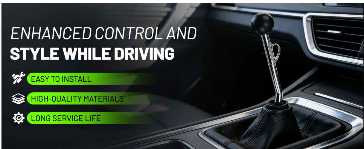
Image: The Avutrel Trigger Shifter installed in a vehicle, showing its design and the OEM part number 00-4451-0.

Replacement for VW DUNE BUGGY BUG BAJA THING PARTS