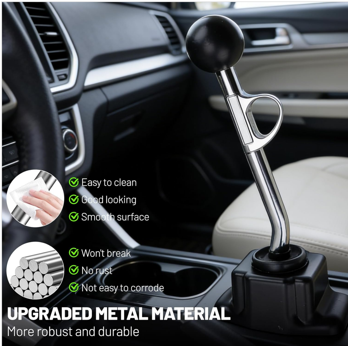
Image: Visual representation of the shifter's material benefits, including ease of cleaning and resistance to rust.

The high-quality alloy steel construction ensures the shifter is resistant to rust and corrosion, contributing to a long service life.