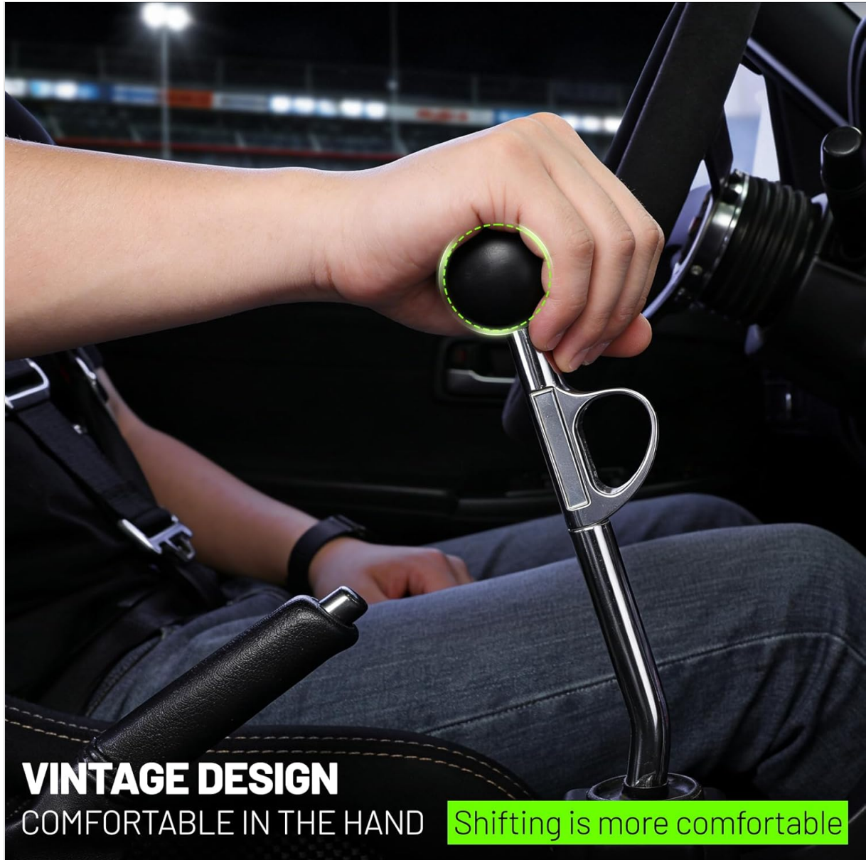
Image: A hand operating the trigger shifter, illustrating the comfortable grip and ease of use.