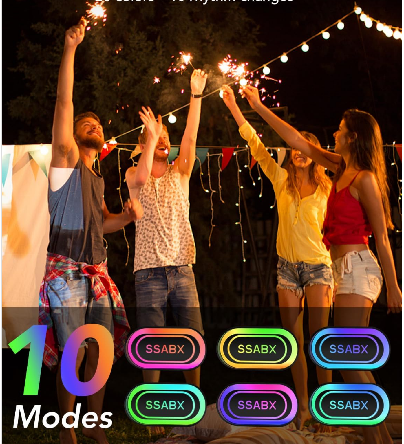
Figure 4: The S7 speaker showcasing its dynamic RGB lighting effects.