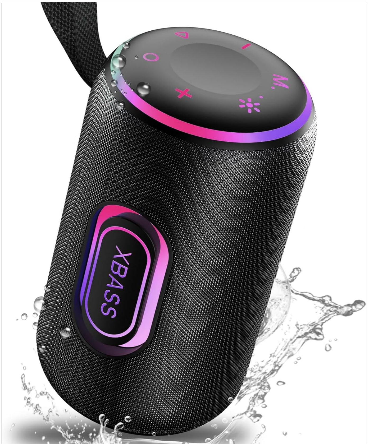
Figure 1: Front view of the taopodo Portable Bluetooth Speaker S7, showcasing its cylindrical design, fabric mesh, and illuminated XBass button.