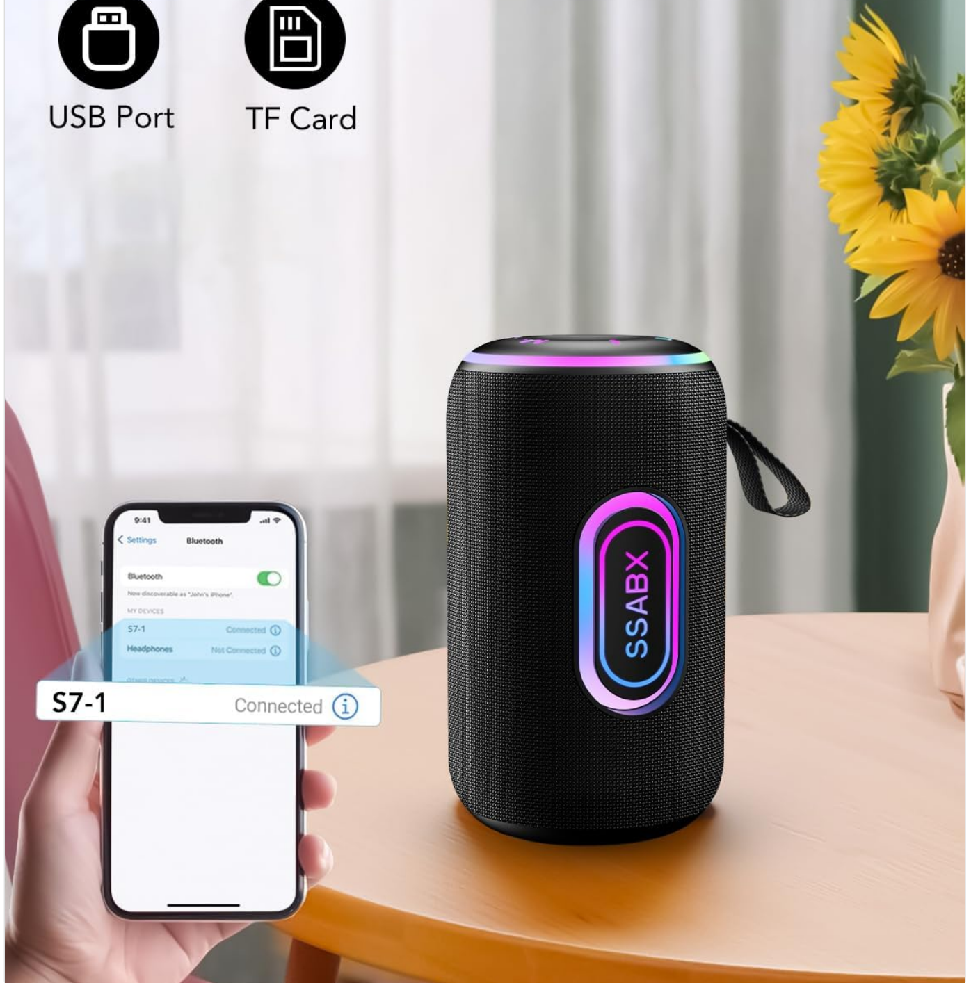
Figure 2: Close-up of the speaker's connectivity ports, including USB, TF card, and Type-C charging.