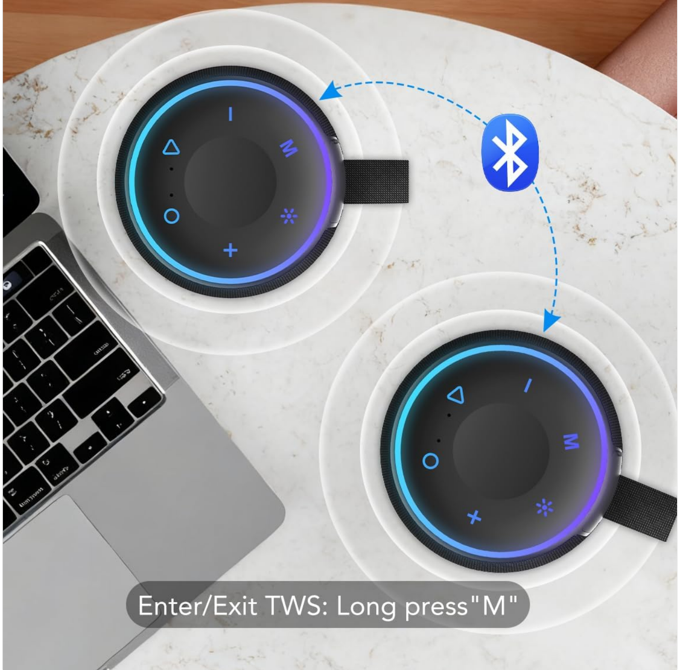
Figure 3: Illustration of two S7 speakers connected via TWS for an immersive stereo experience.

Connect two Bluetooth speaker enjoy 360° surround sound