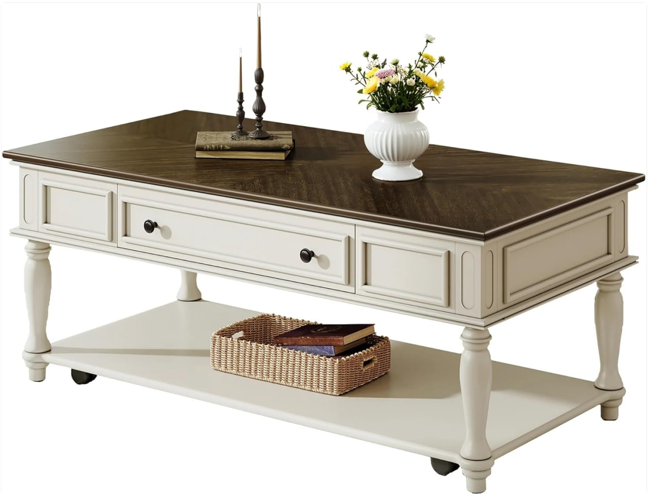
Image: The LKTART Mid Century Modern Coffee Table, showcasing its grey and white finish, dark wood top, and elegant design.