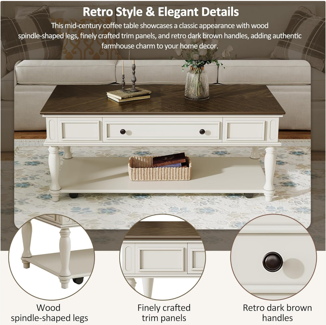
Wood spindle-shaped legs

This mid-century coffee table showcases a classic appearance with wood spindle-shaped legs, finely crafted trim panels, and retro dark brown handles, adding authentic farmhouse charm to your home decor.