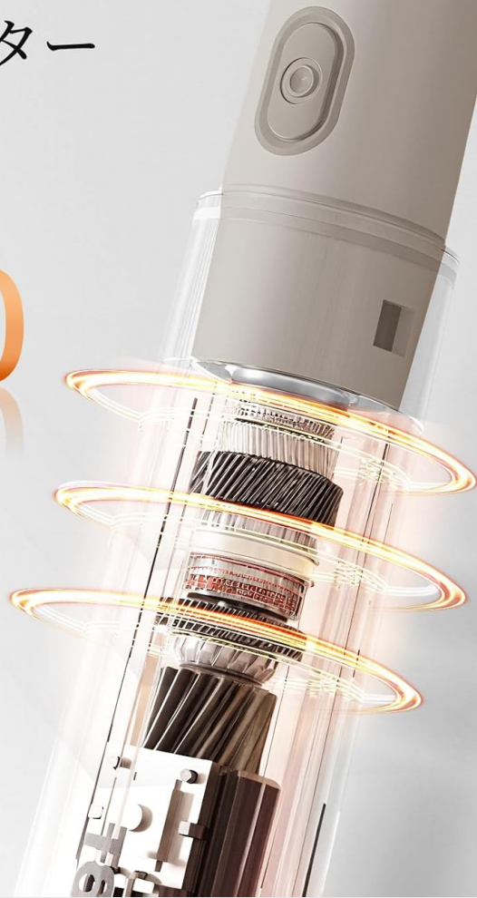
Image: An internal view of the trimmer highlighting its powerful motor, capable of 10,500 rotations per minute, ensuring efficient and clean hair removal.

*半分の時間で倍の清潔感。10500回転モーターの剃浄力が、最後の毛髪も瞬時にいたします