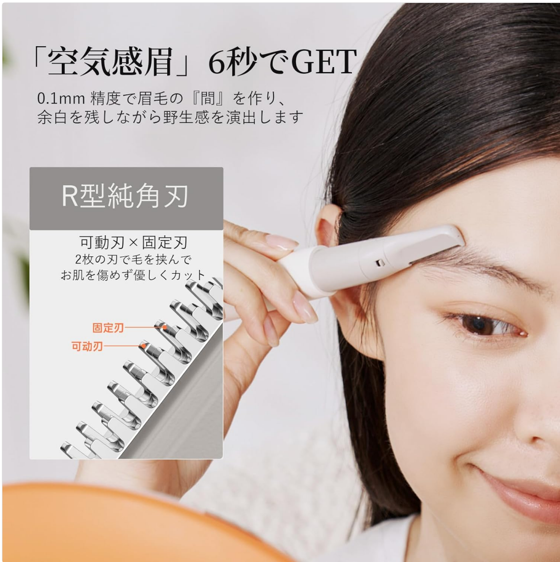
Image: A close-up demonstration of the eyebrow trimmer in action, showing how to gently glide the device to achieve a clean and defined eyebrow shape.