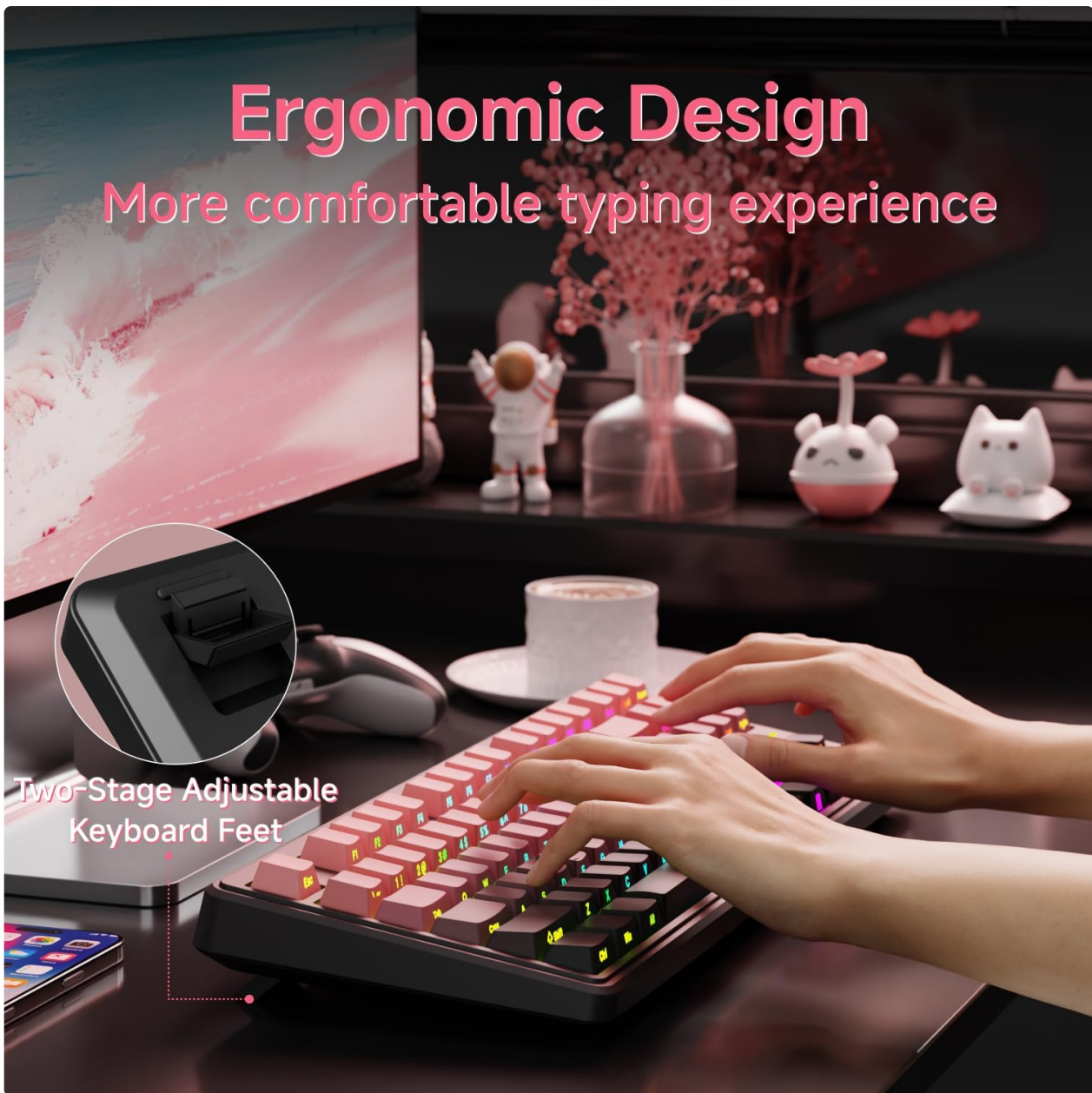
Image: The underside of the EWEADN V80 keyboard with its two-stage adjustable kickstands extended for ergonomic typing.