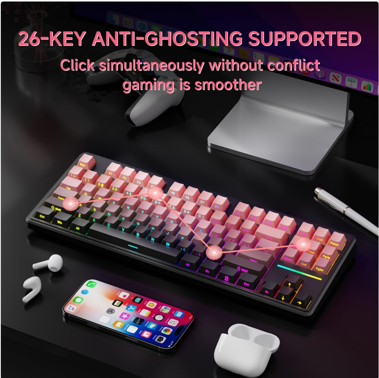
Image: The EWEADN V80 keyboard illustrating its 26-key anti-ghosting capability, showing multiple simultaneous key presses being registered.

Click simultaneously without conflict gaming is smoother