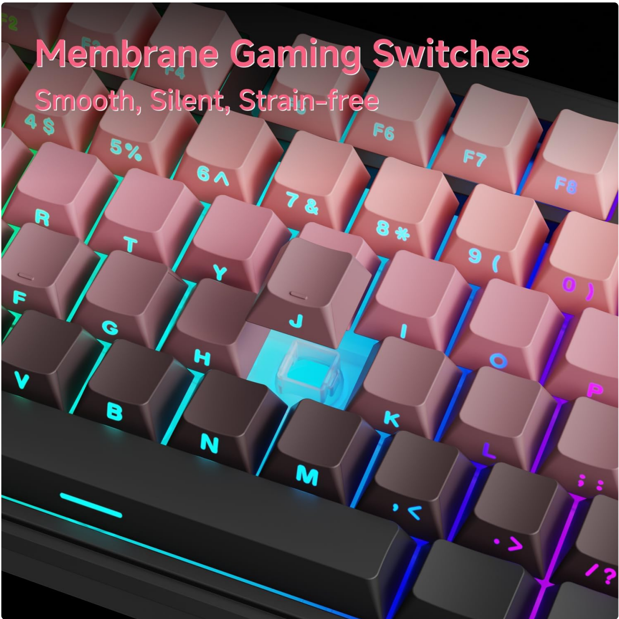
Image: A close-up of the EWEADN V80's membrane gaming switches, illustrating their smooth, silent, and strain-free operation.

Your browser does not support the video tag.