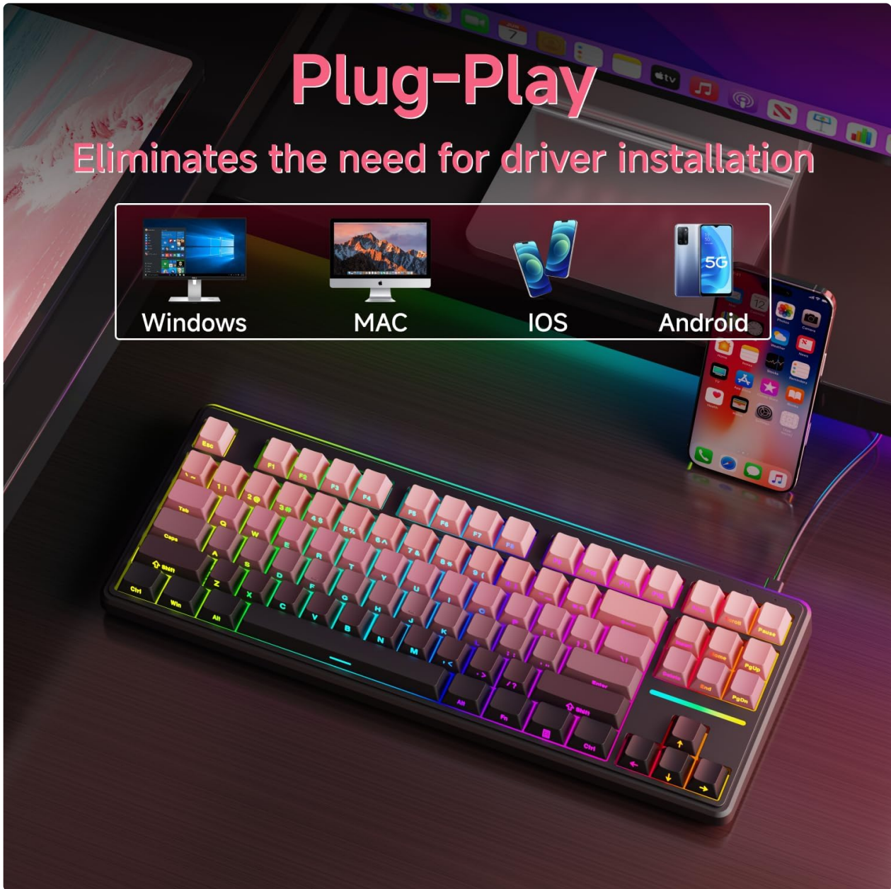
Image: The EWEADN V80 keyboard demonstrating its plug-and-play compatibility with various operating systems including Windows, Mac, iOS, and Android.

simultaneous inputs, crucial for competitive gaming.