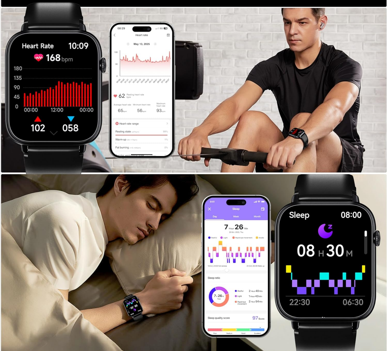
Figure 6: Heart rate monitoring on the smartwatch and sleep analysis data displayed in the companion app.