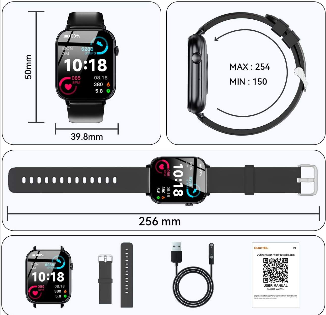
Figure 2: Illustration of the OUKITEL Smartwatch V3 package contents and device dimensions.