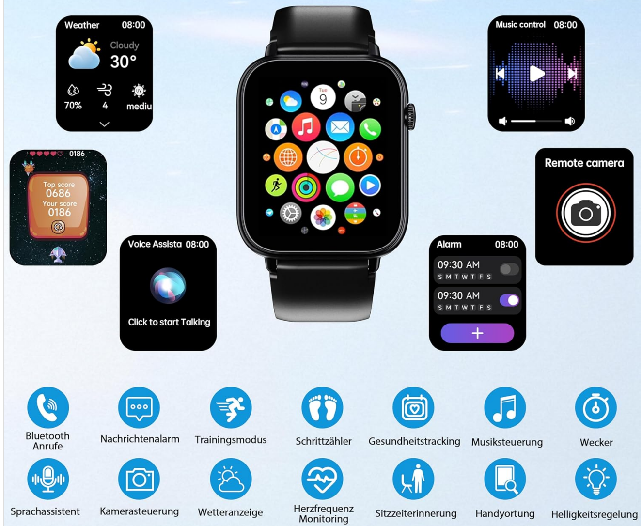
Figure 8: Overview of the smartwatch's multi-functional capabilities.