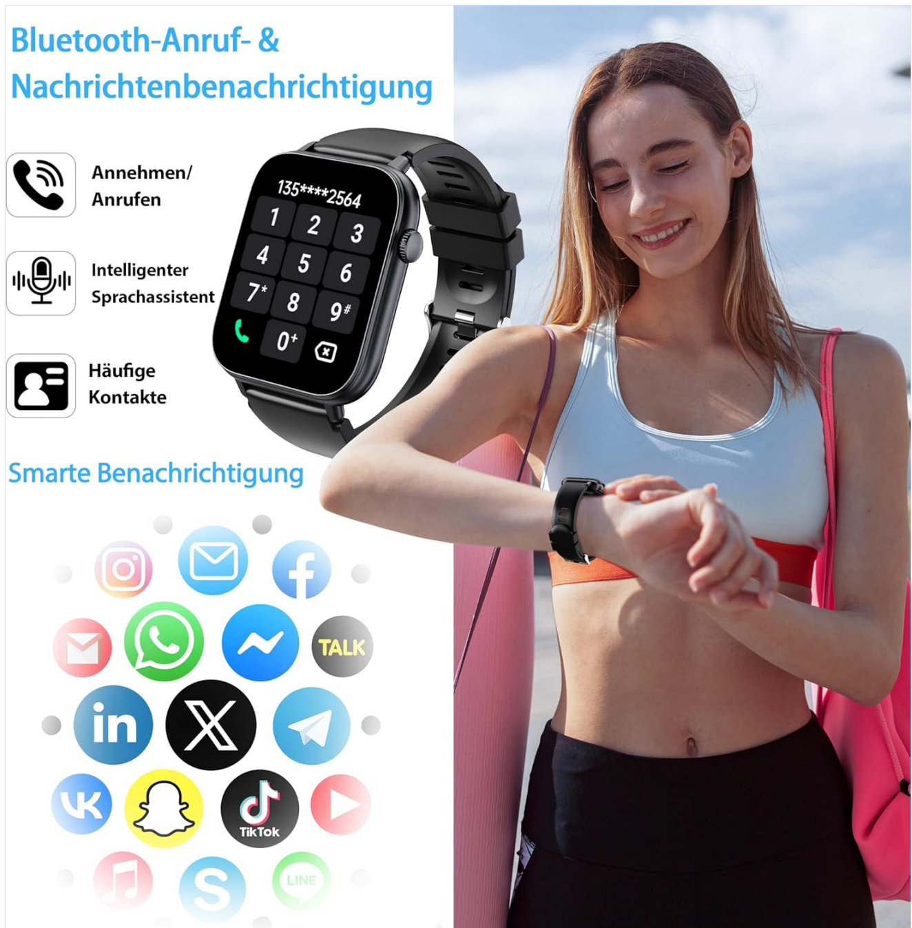
Figure 4: The smartwatch displaying smart notifications from various applications.