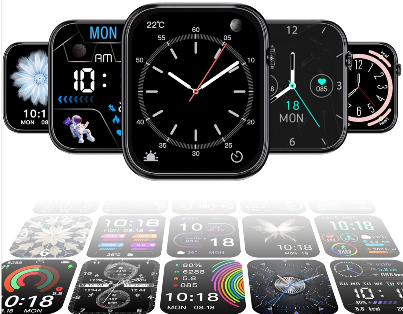
Figure 7: A selection of customizable watch faces available for the OUKITEL Smartwatch V3.

Gestalten Sie Ihr Handgelenk, um Ihren Tag zu verschönern!