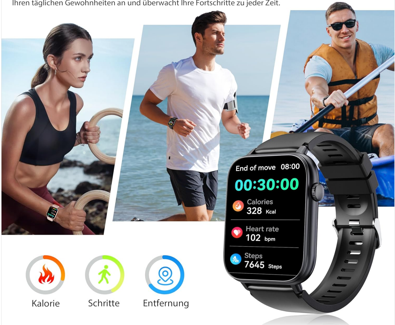
Figure 5: The smartwatch tracking data during a sports activity, showing calories, steps, and heart rate.

Von Indoor-Aktivitäten bis hin zu Abenteuern im Freien passt sich diese Smartwatch Ihren täglichen Gewohnheiten an und überwacht Ihre Fortschritte zu jeder Zeit.