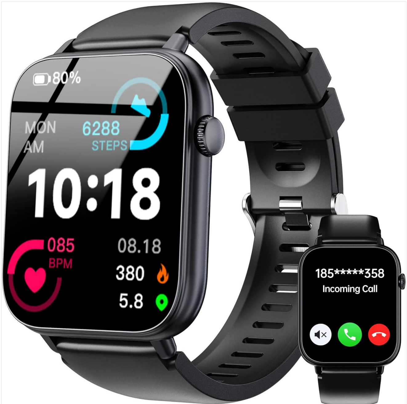
Figure 1: OUKITEL Smartwatch V3 main display showing time, activity data, and a Bluetooth call notification.