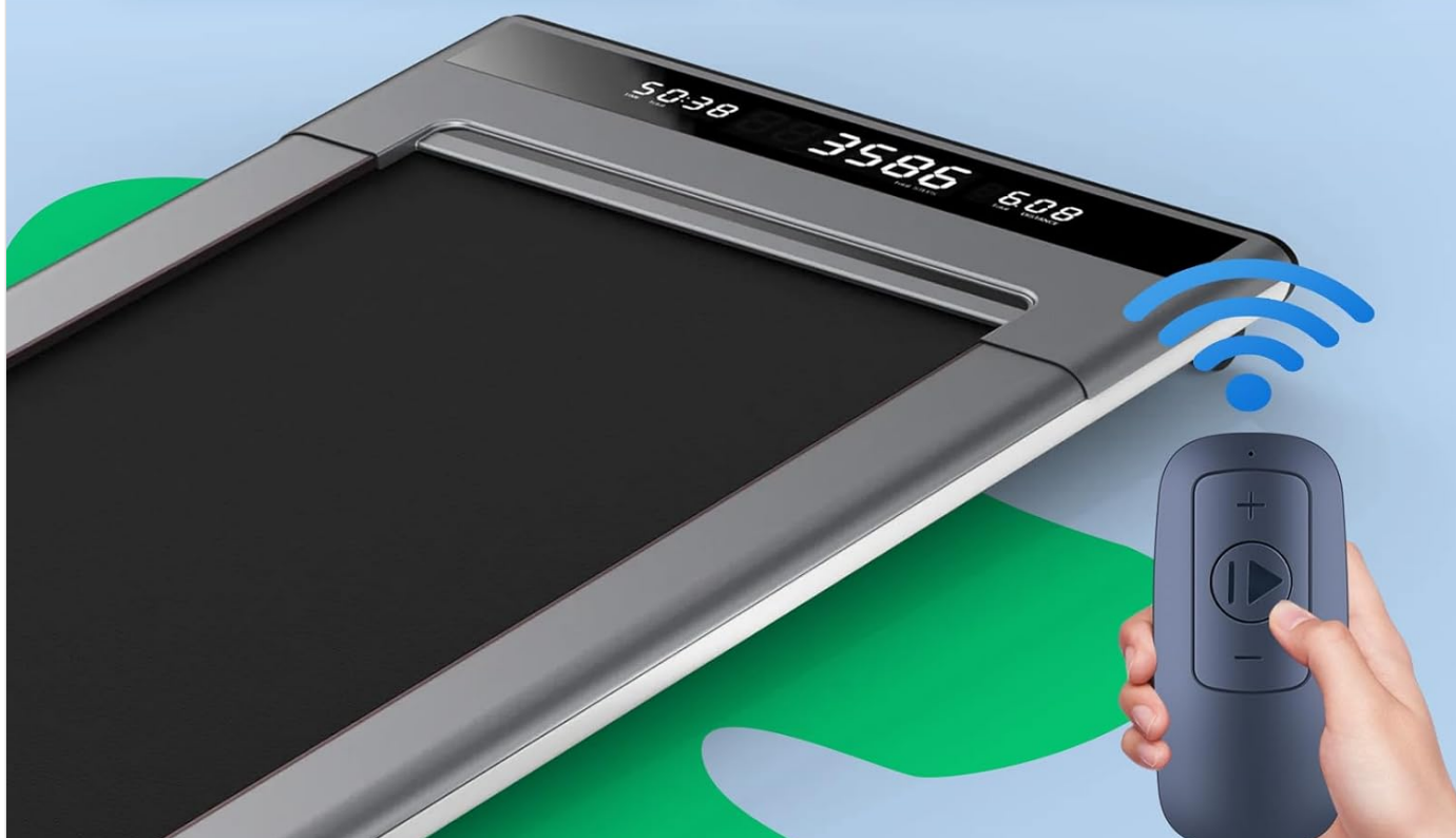
Image: The ZWP remote control highlighting its multi-angle induction capability and an effective transmission range of up to 33 feet.