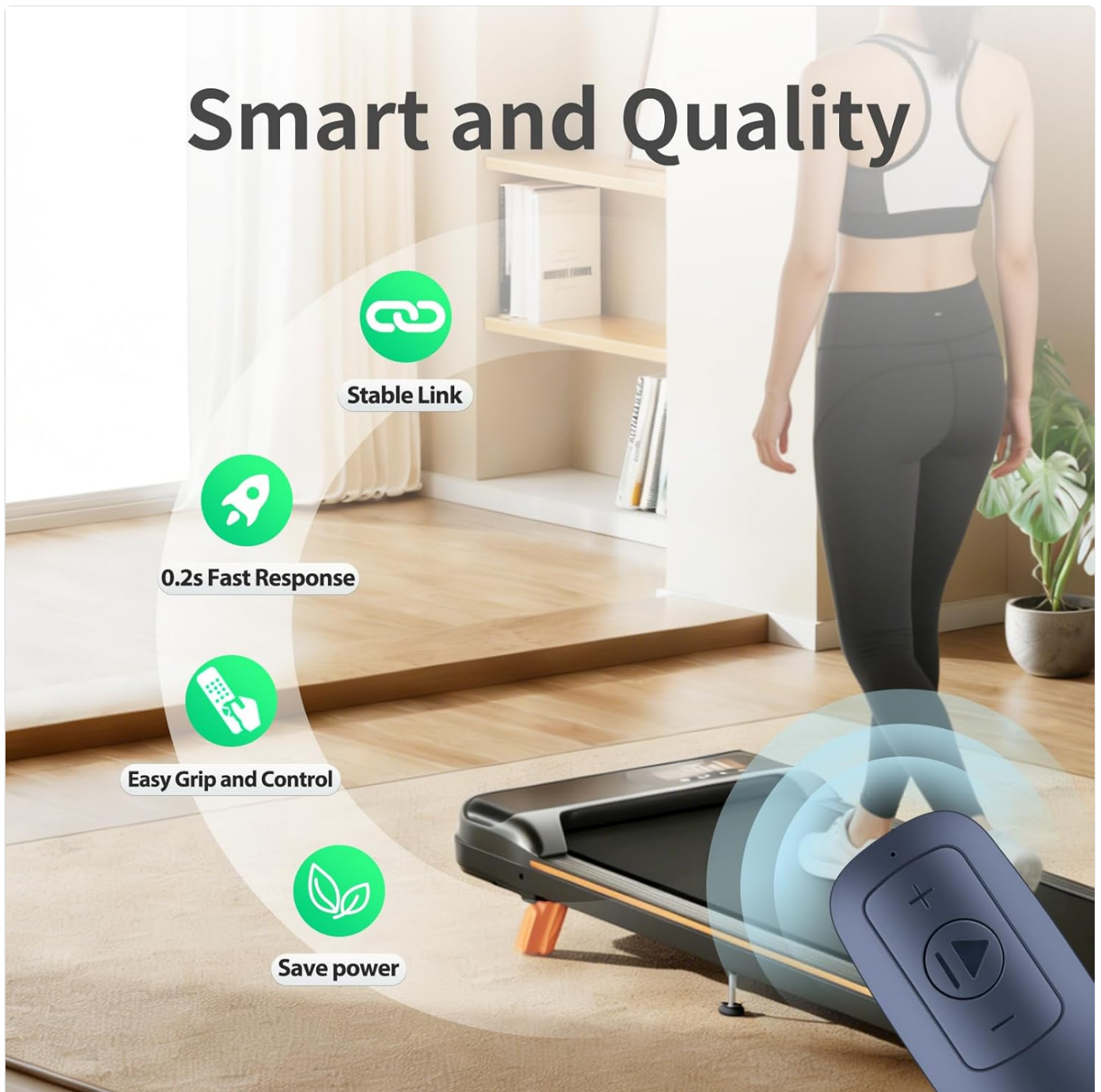
Image: The ZWP Replacement Remote Control in use with a treadmill, illustrating its key features such as stable connectivity, quick response time, ergonomic design for easy grip, and power efficiency.