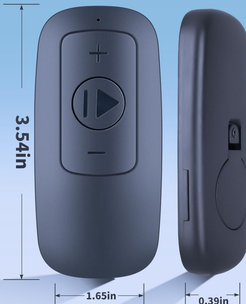
Image: A visual representation of the ZWP remote control's dimensions, emphasizing its compact and ergonomic design for comfortable handling.