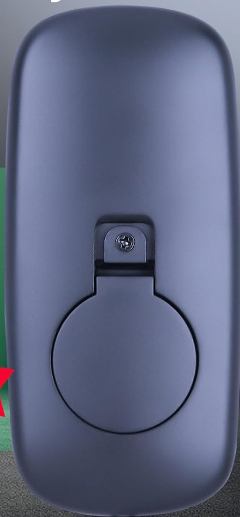
Image: The rear view of the ZWP remote control, displaying the battery compartment and a visual reminder that a CR2032 button battery is required and not included by default.