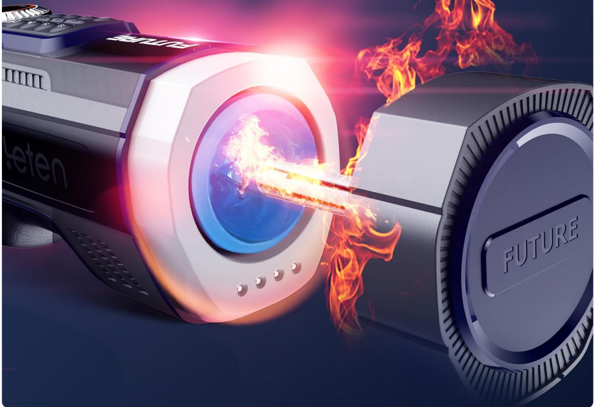
Image: The device's opening with a visual representation of the hot air heating system, showing warmth being generated to pre-warm the sleeve to 40°C.