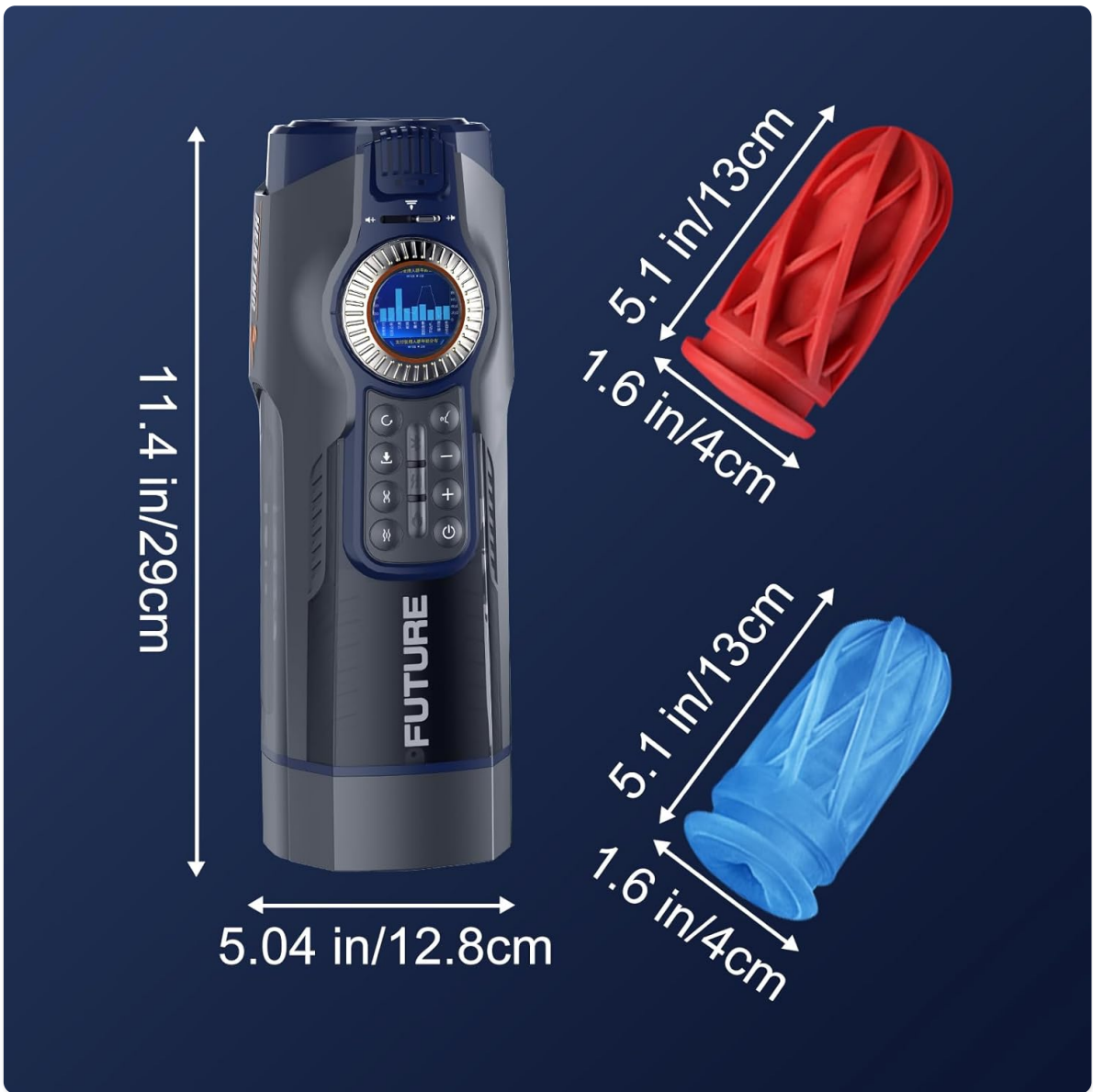
Image: Diagram illustrating the dimensions of the Leten 708 Future Pro Gen 3 main unit (11.4 inches / 29 cm long, 5.04 inches / 12.8 cm wide) and its silicone sleeves (5.1 inches / 13 cm long, 1.6 inches / 4 cm wide).