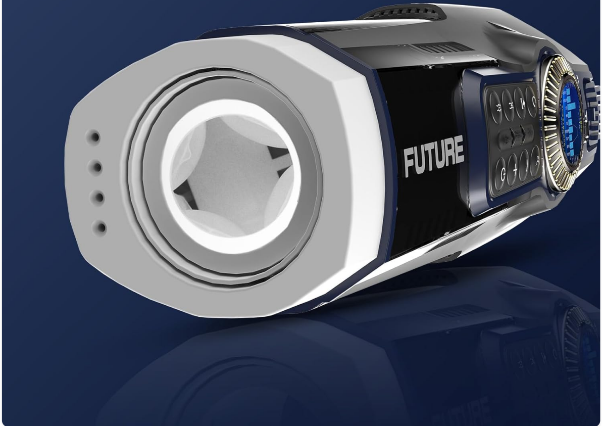
Image: A view into the device's opening, highlighting the built-in 4-airbag squeezer for 10 modes of airbag massage.