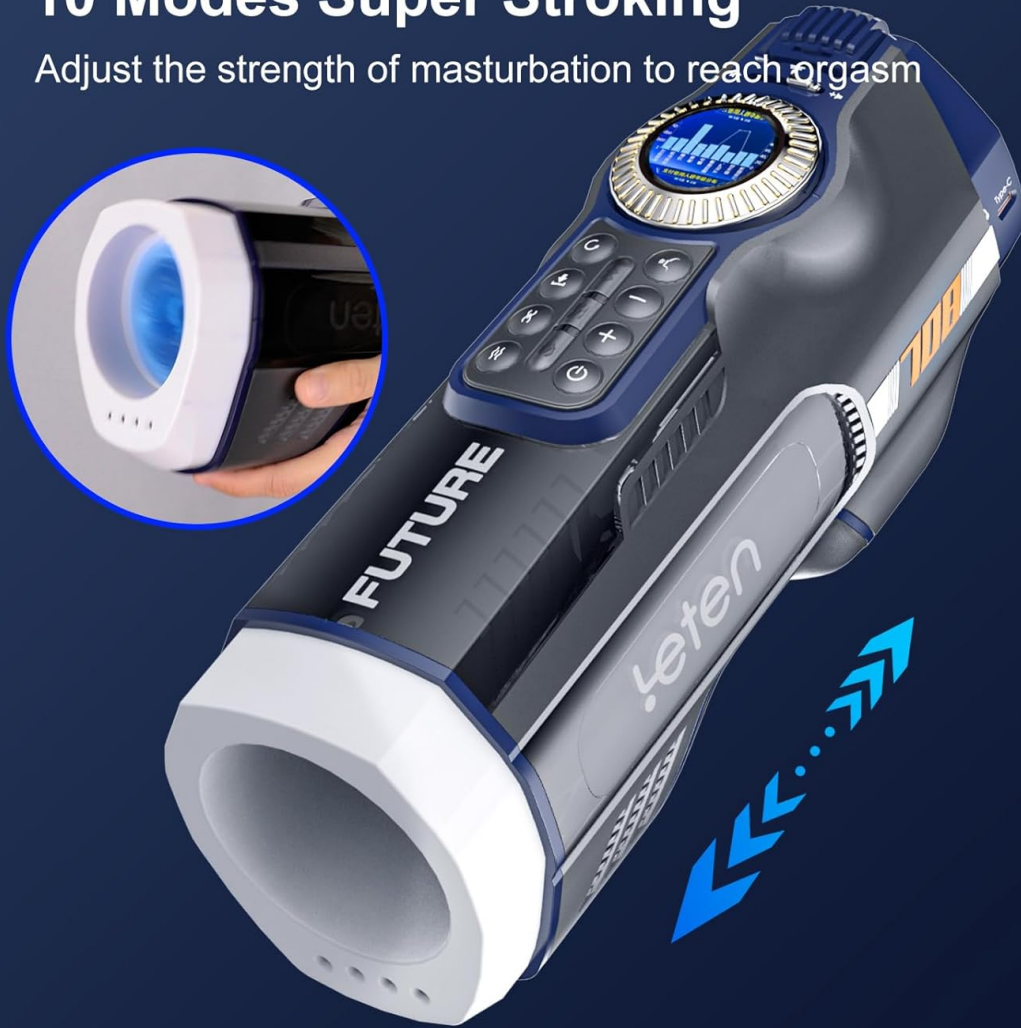
Image: The device illustrating its internal mechanism for 10 super stroking modes, with arrows indicating the thrusting motion.

Adjust the strength of masturbation to reach orgasm