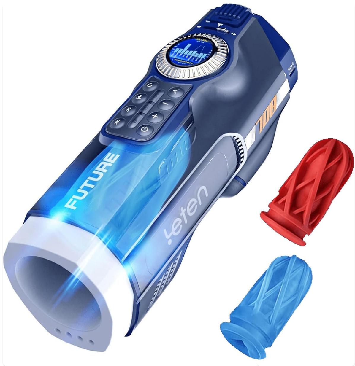
Image: The main unit of the Leten 708 Future Pro Gen 3, showcasing its design and the two included interchangeable silicone sleeves (one red, one blue).