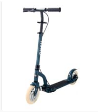
Figure 3.2: Detail of the rear foot brake mechanism.