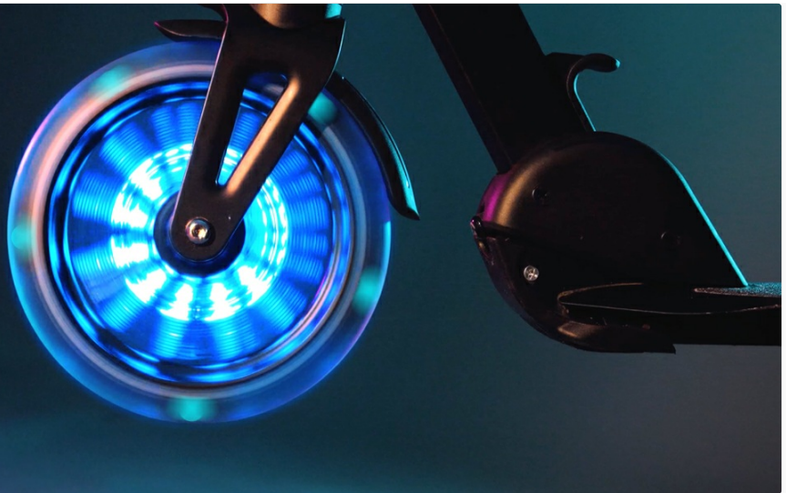
Figure 3.4: The scooter folds quickly and includes a strap for easy carrying.

Lights in the tire and core turn every ride into a rolling light show—cooler than ever!