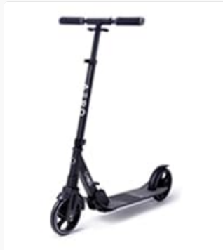
Figure 3.5: The integrated kickstand provides stable parking for the scooter.