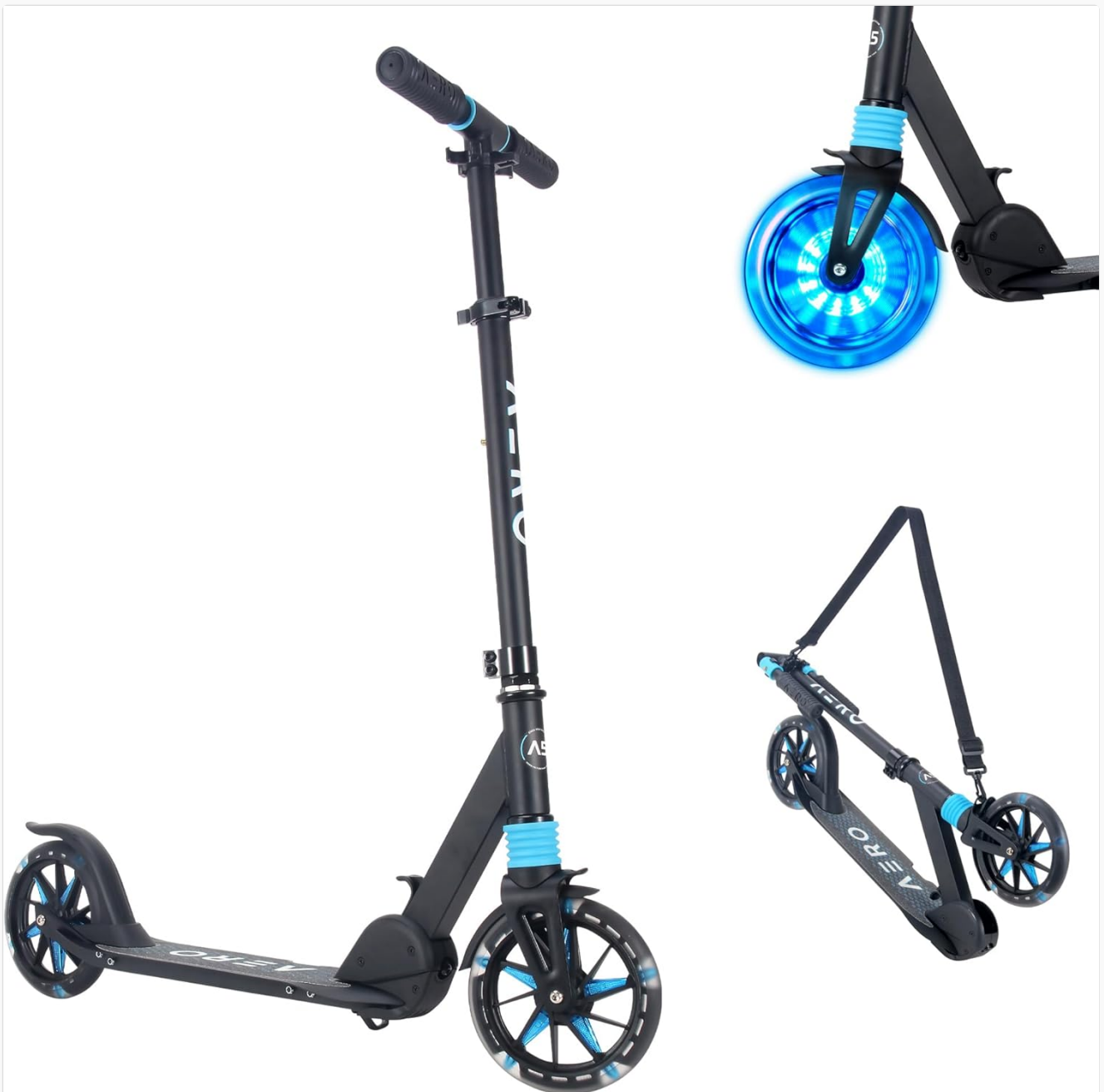
Figure 2.1: The AERO MOBILITY A5 Kick Scooter, showing its unfolded and folded configurations for transport.