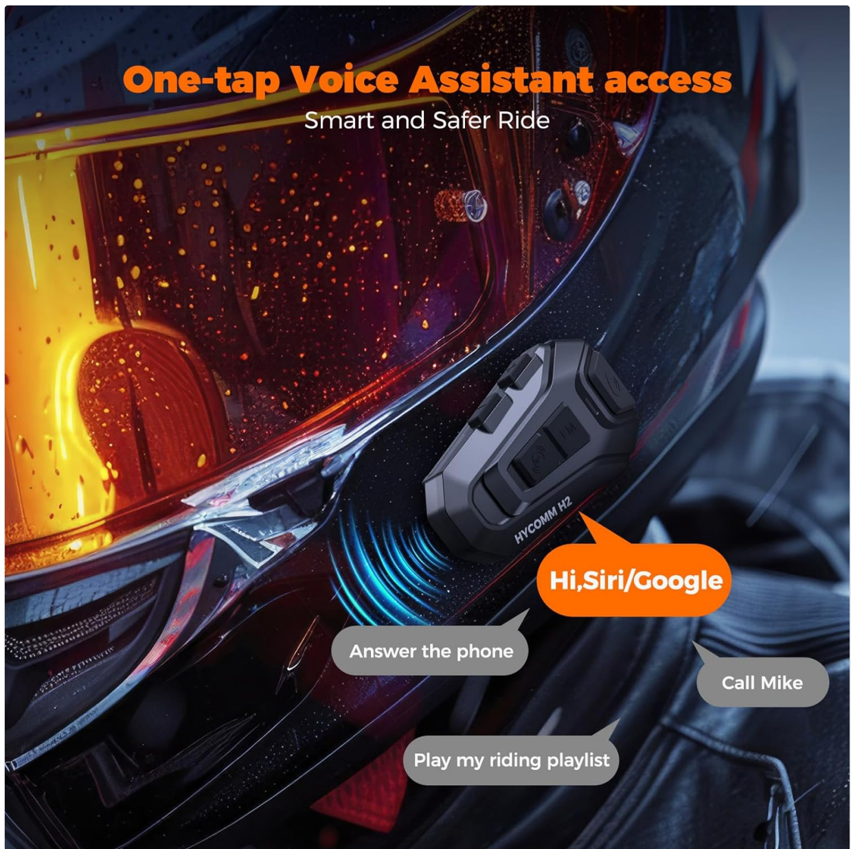
Figure 5: The HYCOMM H2 headset supports one-tap access to voice assistants like Siri and Google, allowing riders to answer calls, play music, or get directions hands-free.