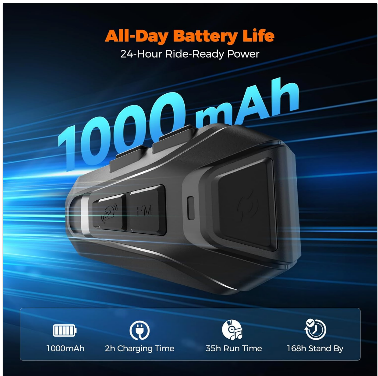
Figure 6: The HYCOMM H2 features a 1000mAh battery, providing up to 35 hours of run time with only 2 hours of charging.