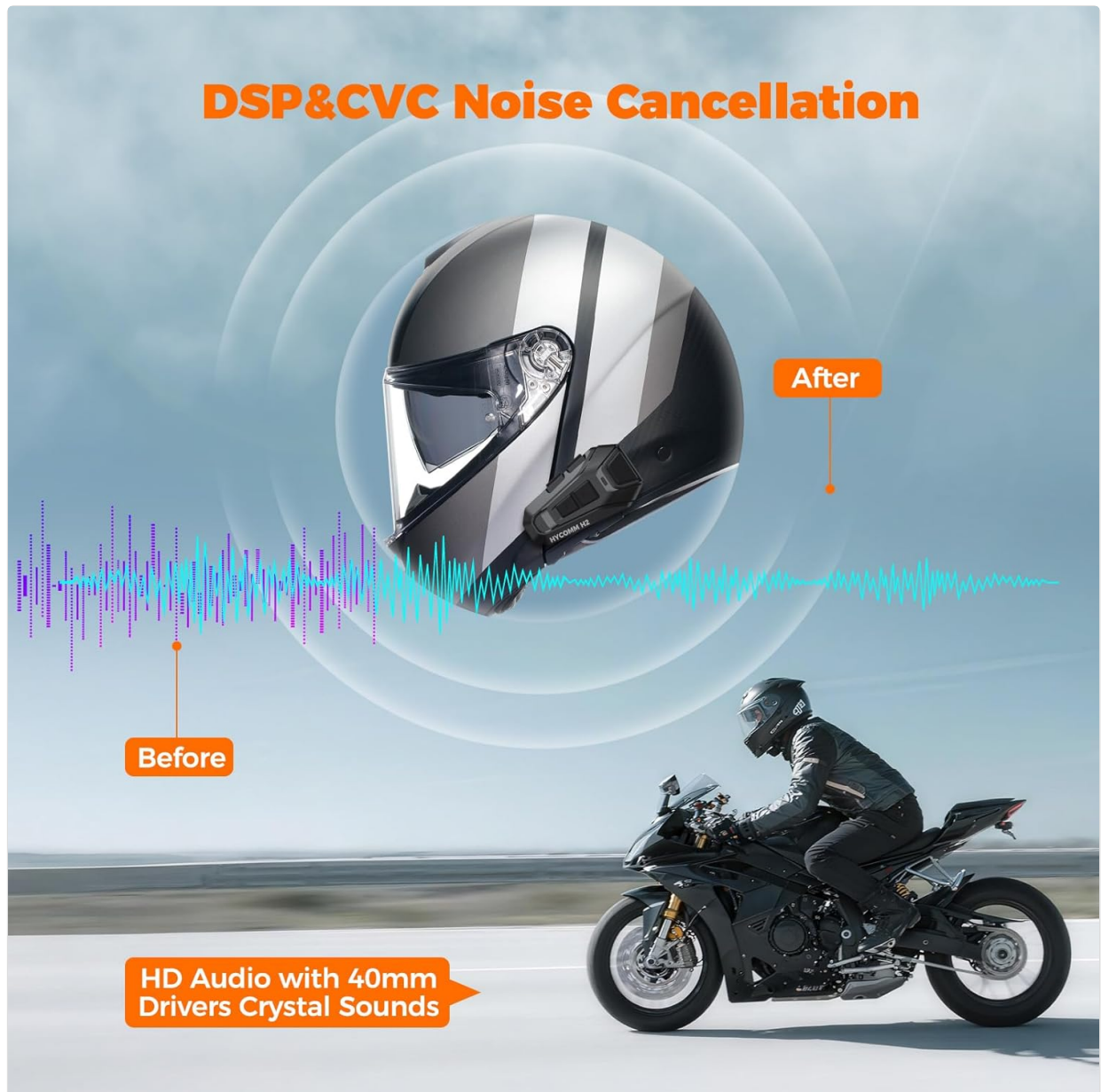
Figure 4: Illustration of DSP and CVC noise cancellation technology in action, showing how wind and engine noise are reduced for clearer audio.

Experience crystal clear HD audio with 40mm drivers. Advanced DSP and CVC noise cancellation actively filter out wind and engine noise, ensuring optimal sound quality even at highway speeds. Utilize smart voice commands (Siri and Google Assistant) for hands-free control over calls, GPS directions, and music playback.