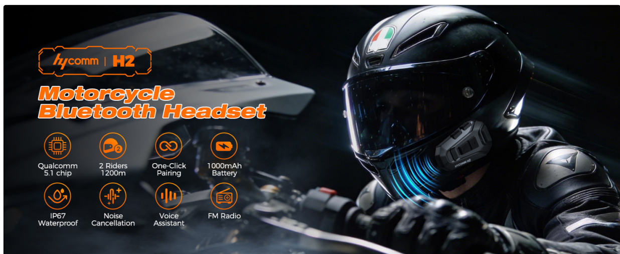
Figure 3: Two riders communicating wirelessly using the HYCOMM H2 headsets, demonstrating the effective 1200-meter range for intercom functionality.

The 2-way intercom system allows communication between two riders up to 1,200 meters (0.75 miles) in open areas. It supports cross-brand pairing, enabling connection with other major helmet communication systems.