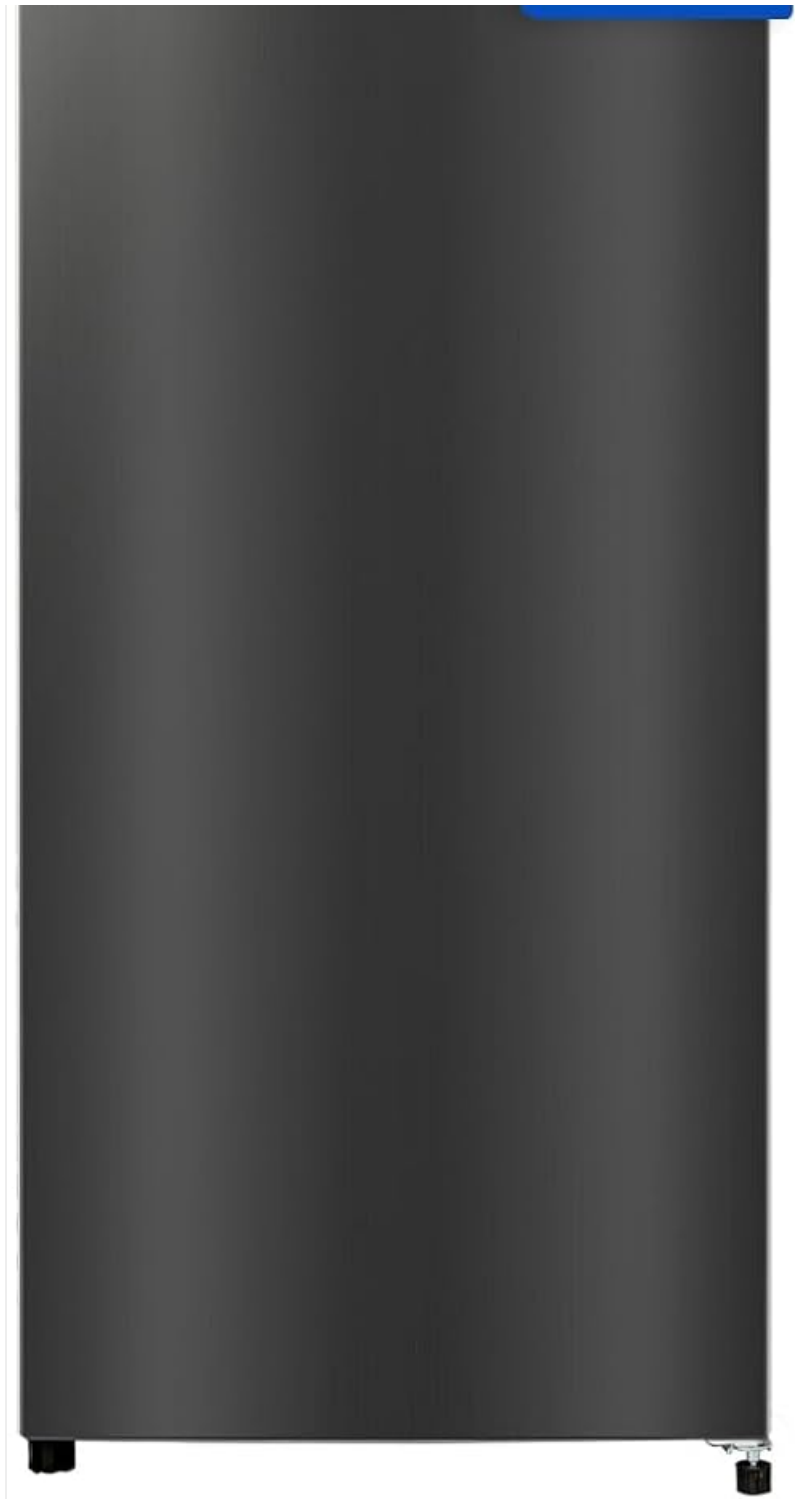
Front view of the CHIQ CSD206NEID 206L Vertical Freezer.