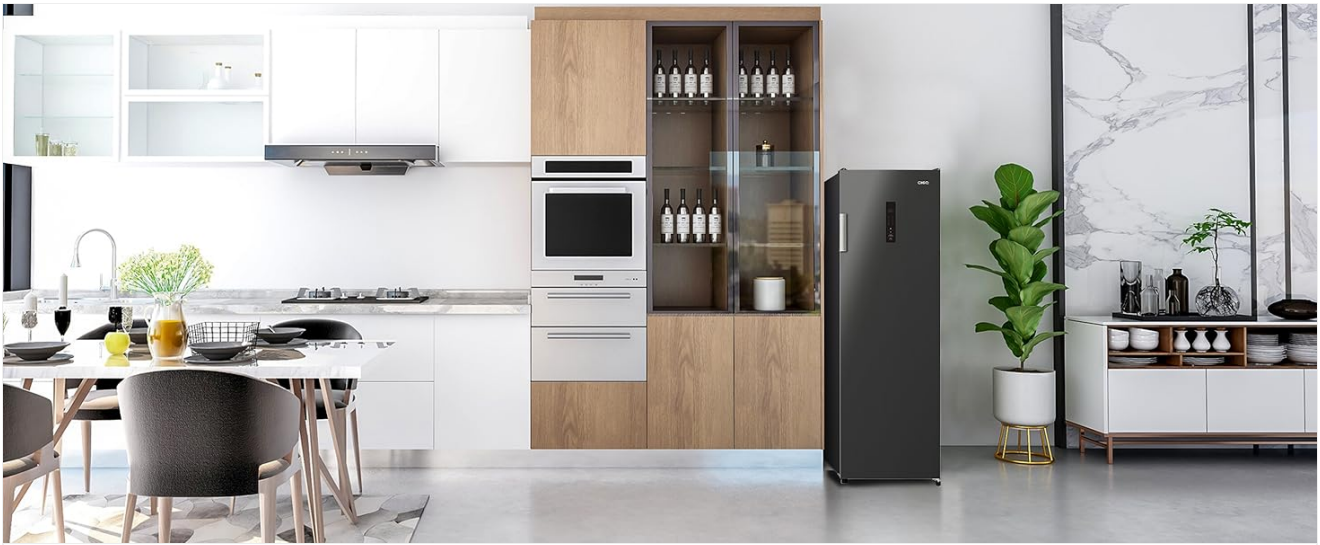
The CHIQ CSD206NEID 206L Vertical Freezer integrated into a modern kitchen environment.