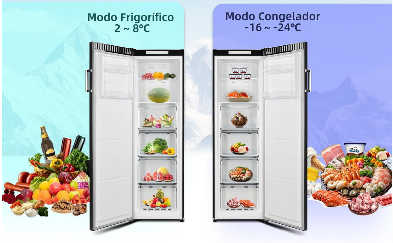
Illustration of the convertible function: Refrigerator Mode (2-8°C) and Freezer Mode (-16 to -24°C).