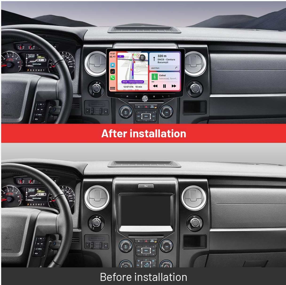
Image 4.1: Comparison showing a car dashboard before installation with a standard radio, and after installation with the Leadsign 10.1-inch car stereo seamlessly integrated.