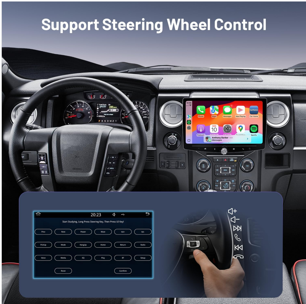
Image 5.3: The car stereo display showing the Apple CarPlay interface, with an inset image demonstrating how steering wheel controls can be used to operate the unit.

The unit supports steering wheel controls for convenient operation. Refer to the system settings to program the buttons according to your vehicle's specifications.