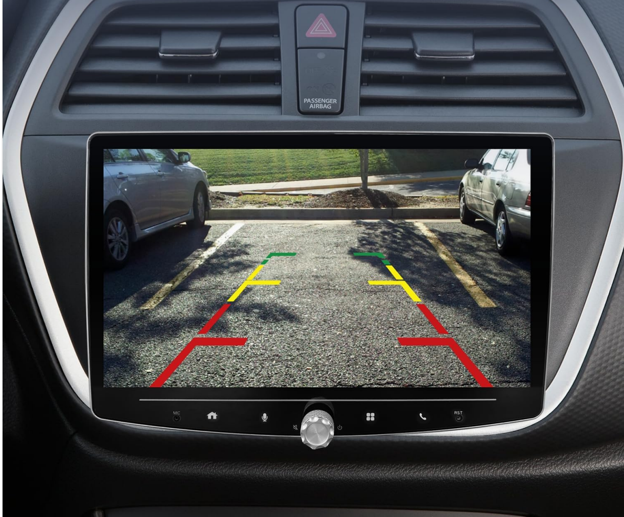
Image 5.4: The car stereo display showing a reverse camera feed with parking guidelines, indicating support for both OEM and aftermarket camera systems.