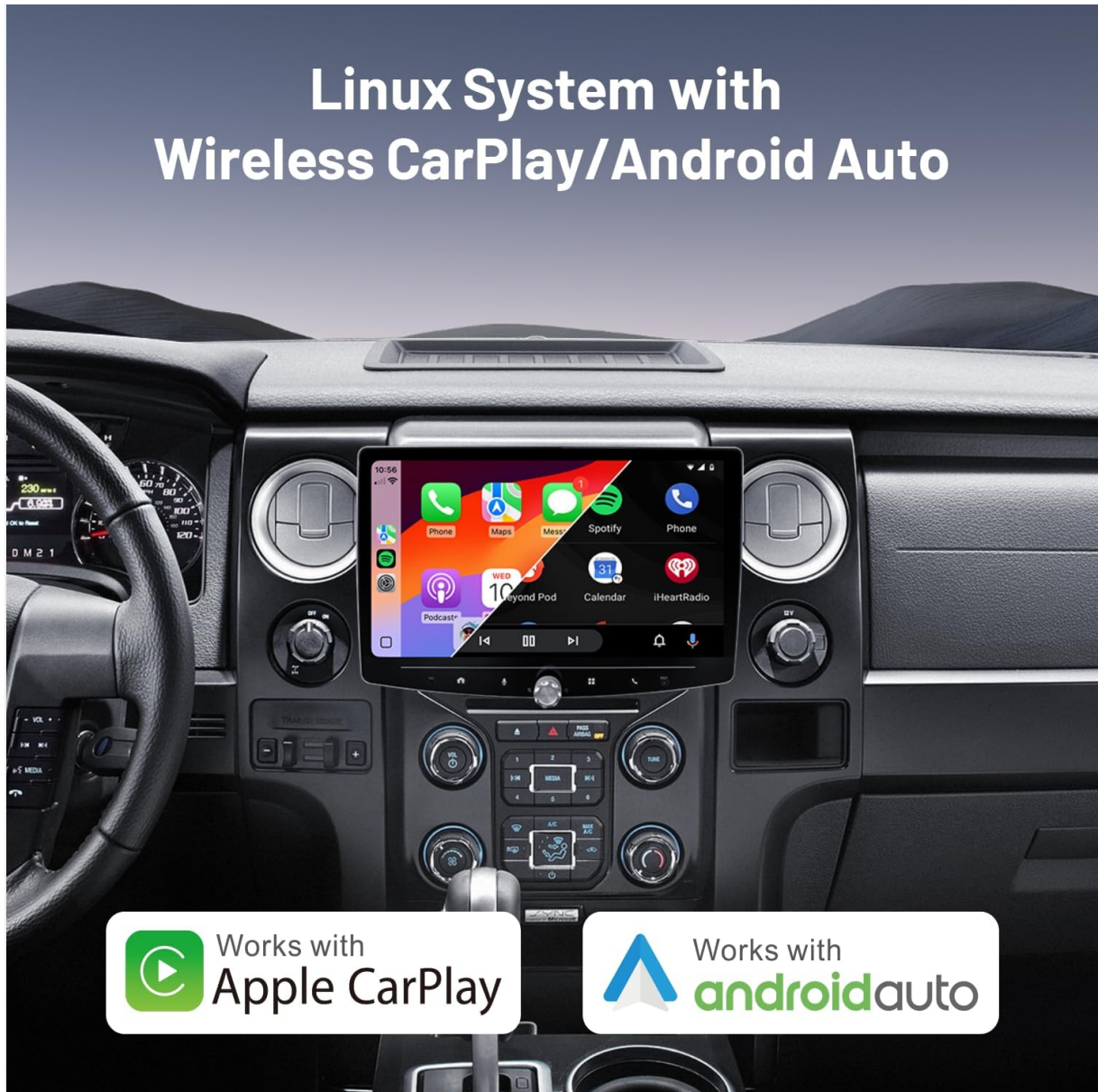
Image 5.1: The car stereo display showing the Apple CarPlay interface, integrated into a car dashboard.