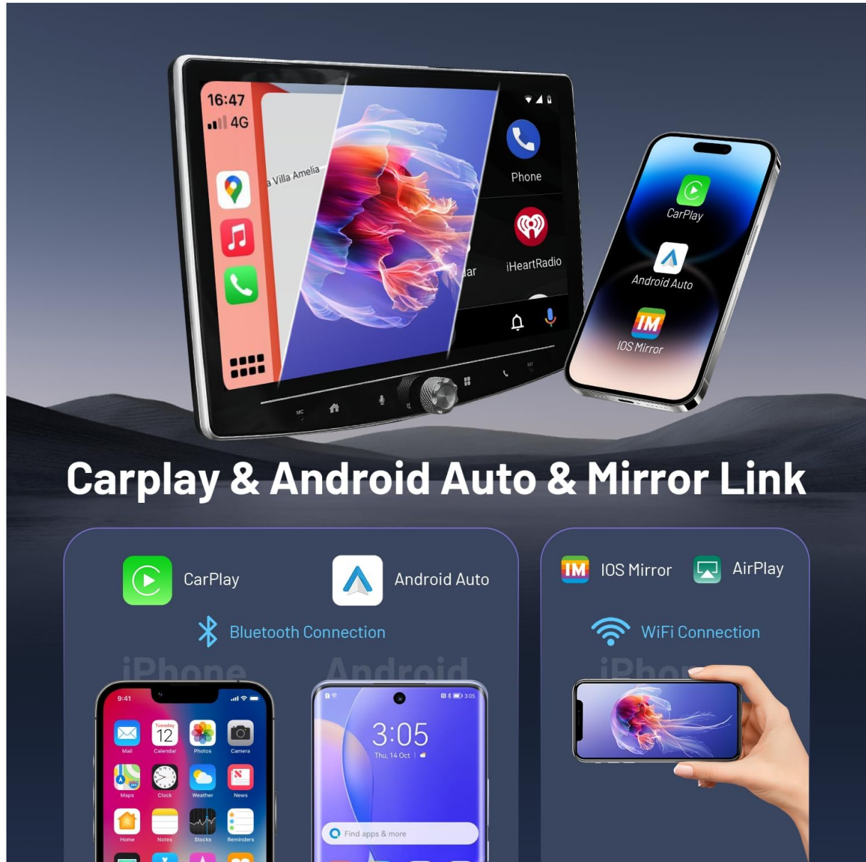
Image 5.2: A visual representation of the car stereo's compatibility with Apple CarPlay, Android Auto, and MirrorLink, showing smartphones connected to the display.