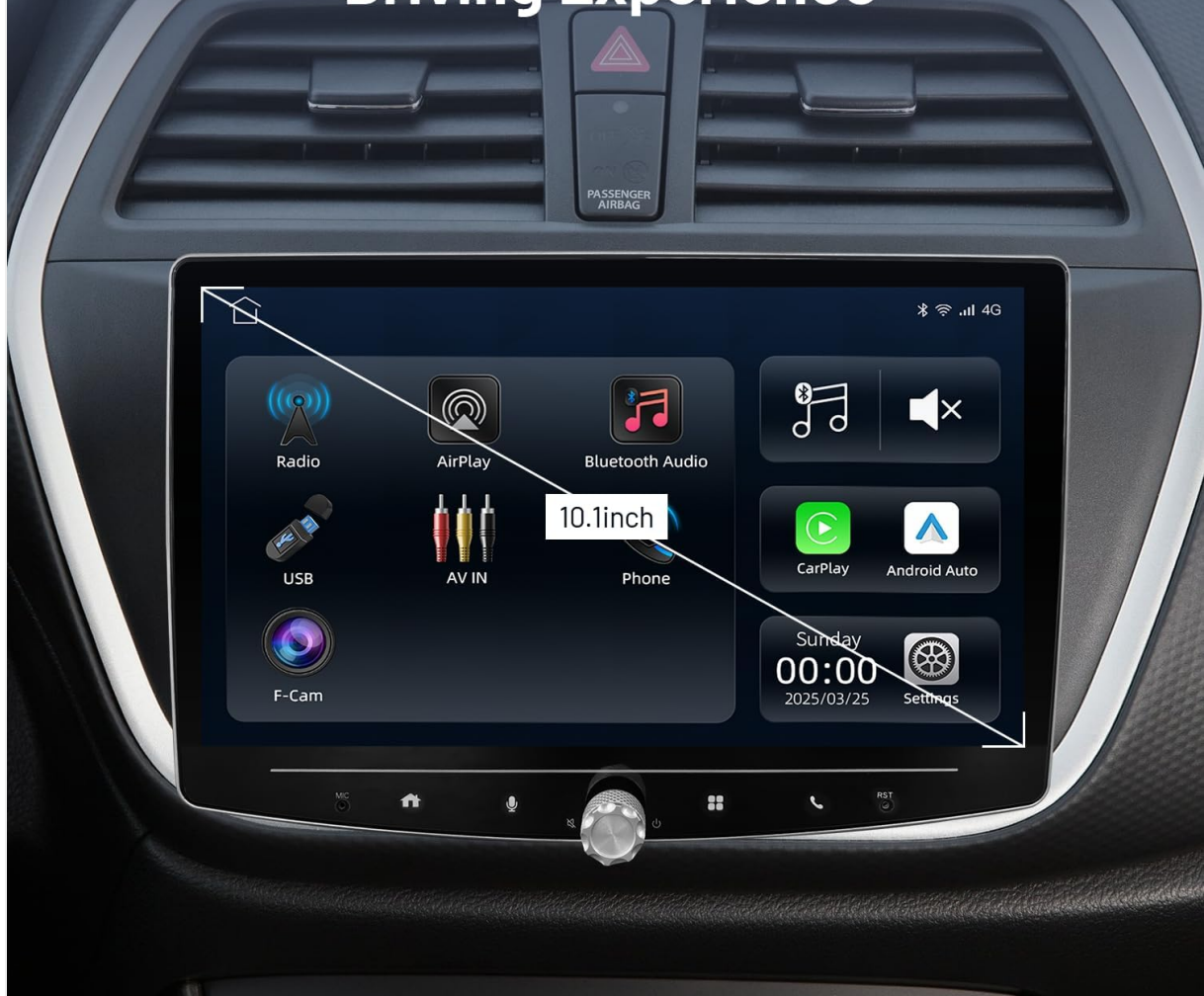
Image 7.1: Diagram illustrating the physical dimensions of the Leadsign 10.1-inch car stereo unit, including screen size and chassis depth.