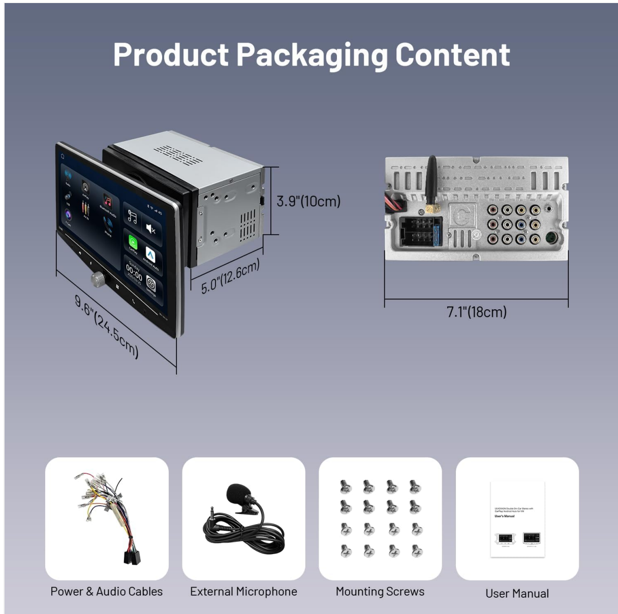
Image 3.1: Illustration of the Leadsign car stereo unit and its included accessories: power and audio cables, external microphone, mounting screws, and the user manual.