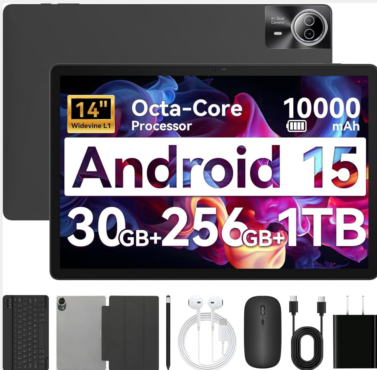
Image: The URAO 14-inch Android 15 Tablet displayed with its full suite of accessories, including a keyboard, mouse, stylus,