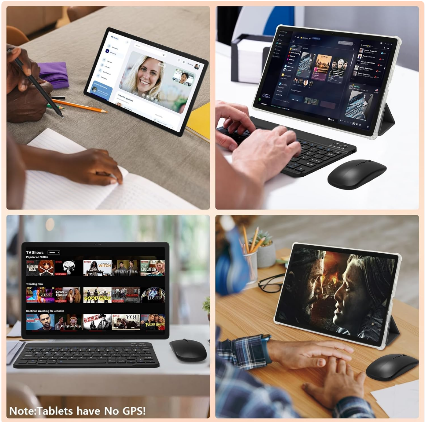
Image: A multi-panel image showing the URAO tablet in different usage scenarios, including note-taking with a stylus, typing with the keyboard and mouse, and watching videos, demonstrating its versatility.