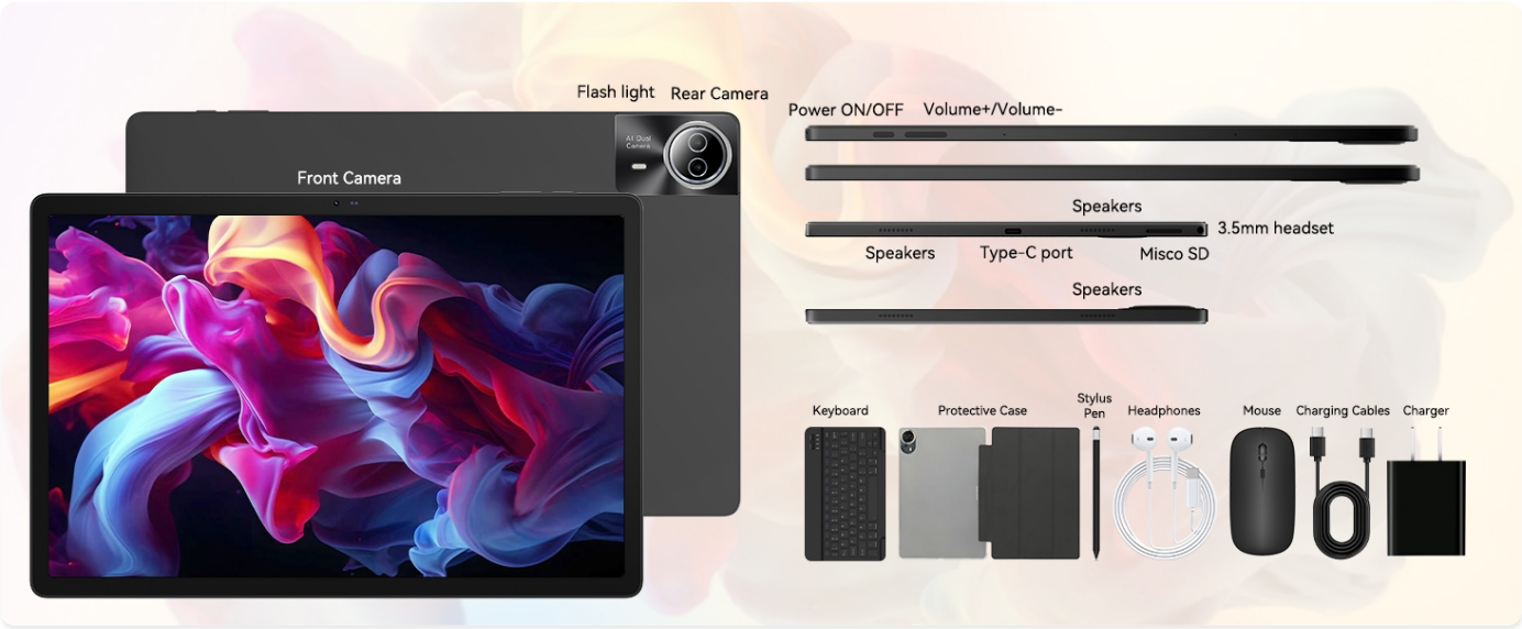
Image: The URAO tablet displaying a high-resolution image, emphasizing its 14.1-inch IPS display and 1920x1200 pixel resolution for bright and clear visuals.