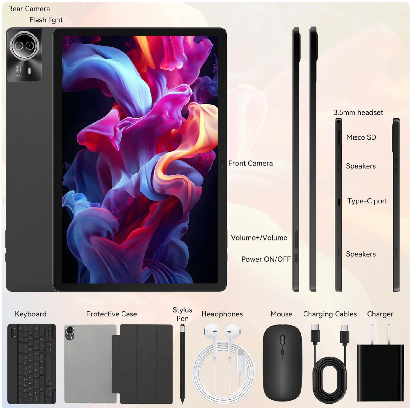
Image: A visual representation of the URAO G140L tablet, highlighting its ports and buttons, alongside all standard accessories provided in the retail package.