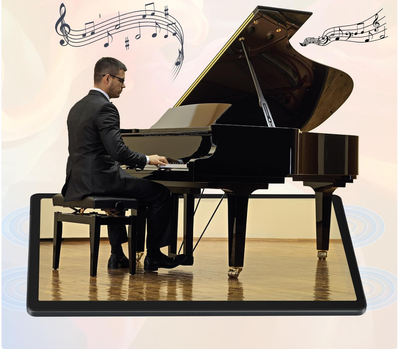
Image: The URAO tablet positioned in front of a piano player, with a graphic overlay indicating the presence of Stereo 4 Speakers for enhanced sound.