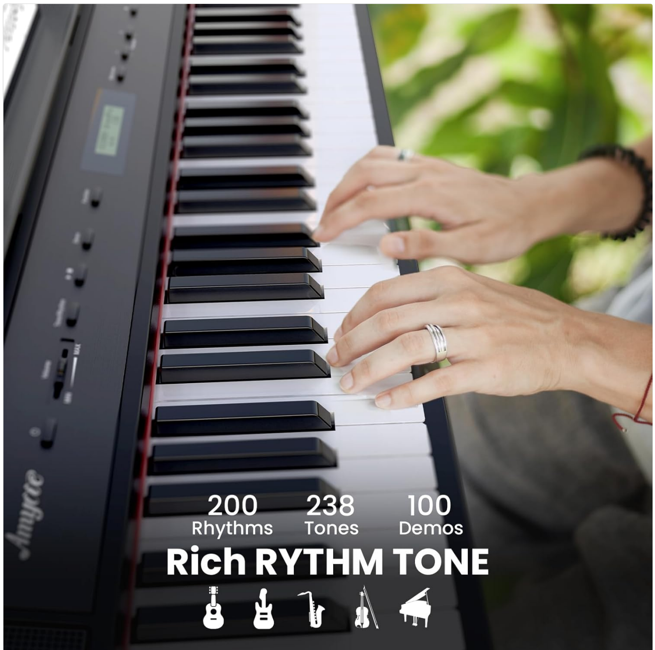
Image 2: Hands playing the digital piano, highlighting the variety of tones and rhythms available, including piano, guitar, saxophone, violin, and grand piano.