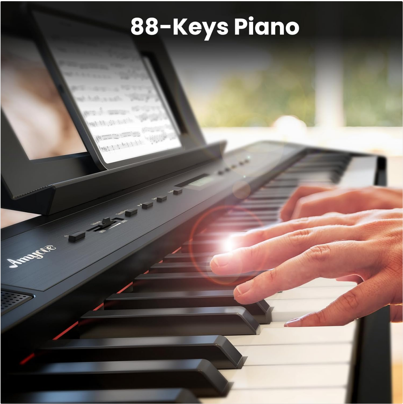
Image 4: Detailed view of hands on the 88-keys of the digital piano, showcasing the key design.