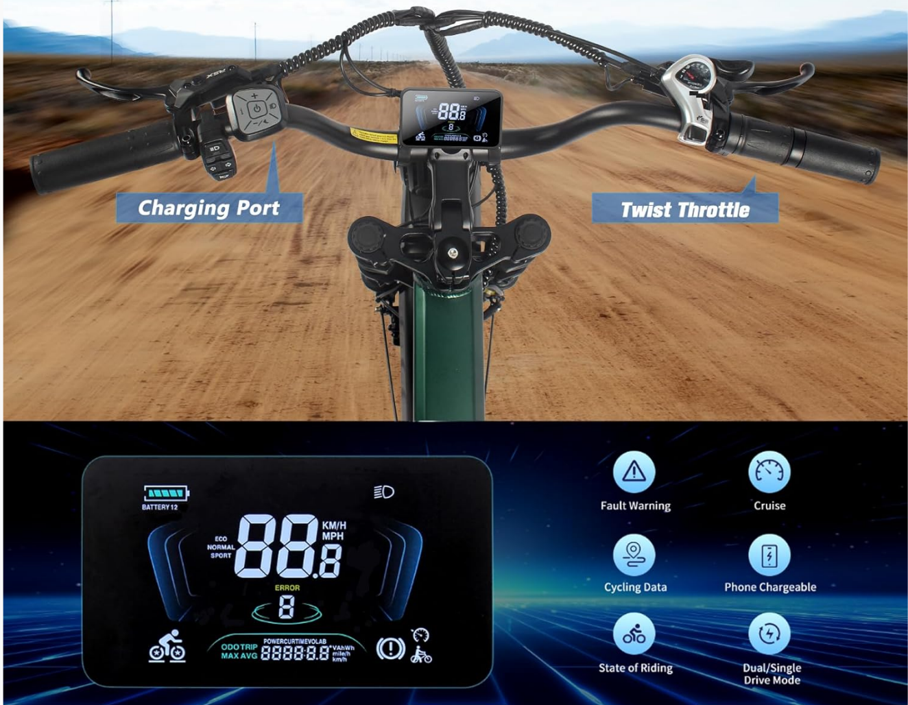
Image: The colorful LCD display and handlebar controls of the Wildway ORCA, showing features like charging port, twist throttle, and various riding data.