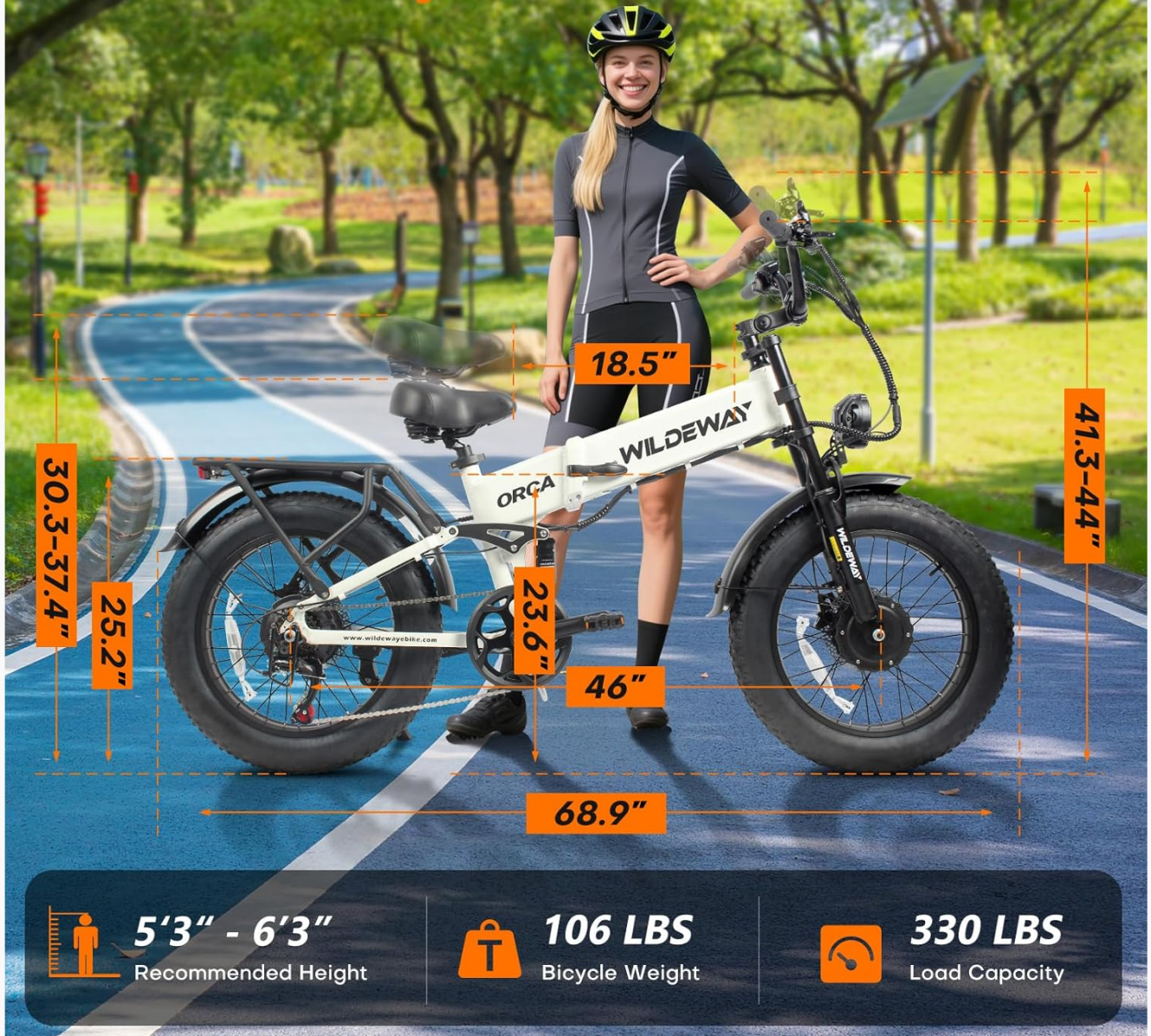
Image: A visual guide to the Wildeway ORCA's dimensions, including total length, handlebar height, seat height, wheelbase, and recommended rider height.