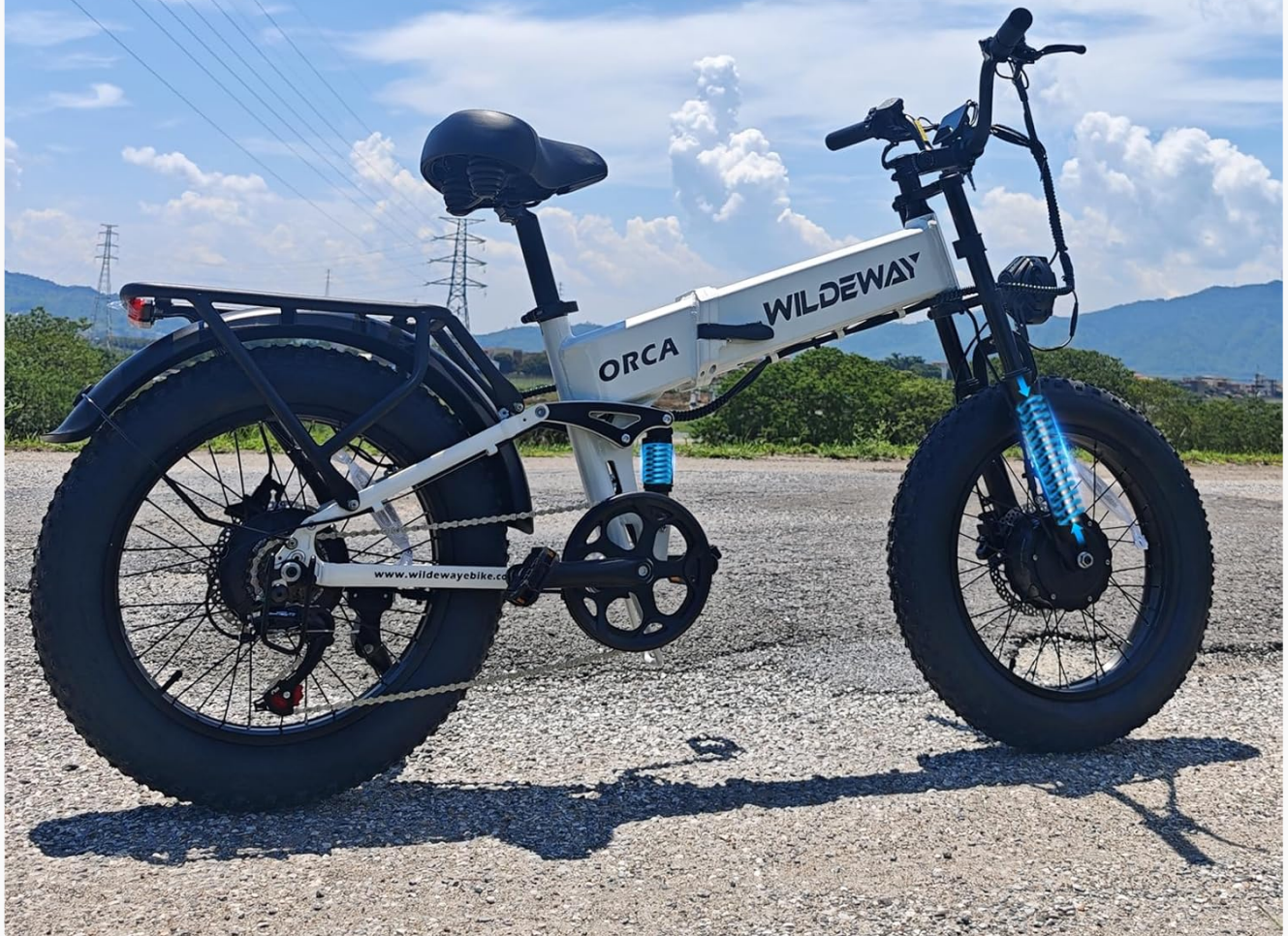
Image: The Wildeway ORCA electric bike, demonstrating its full suspension system designed to absorb shocks for a smoother ride.

The full suspension system absorbs shocks and reduces fatigue. Even on long rides, you'll feel relaxed and comfortable.