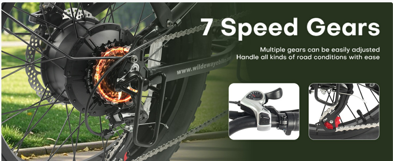
Image: Detailed view of the 7-speed gear system and the twist grip shifter, illustrating how multiple gears can be adjusted for various road conditions.

The bike features a 7-speed gear system. Use the twist grip shifter on the handlebars to change gears, adapting to different terrains and riding conditions.