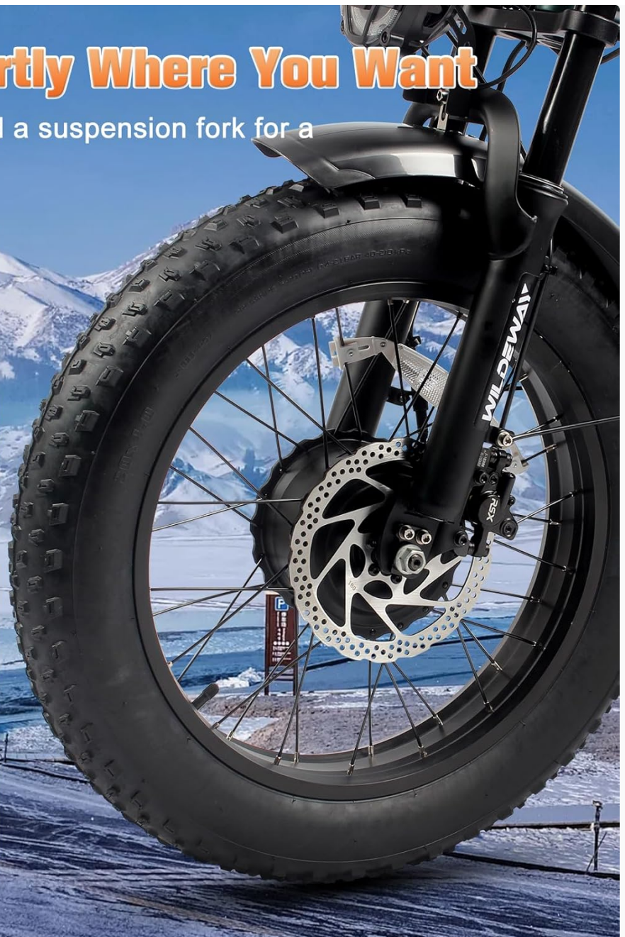
Image: The 20x4 inch fat tires of the Wildway ORCA, designed for optimal performance across diverse terrains such as snow, mountains, sand, and grasslands.