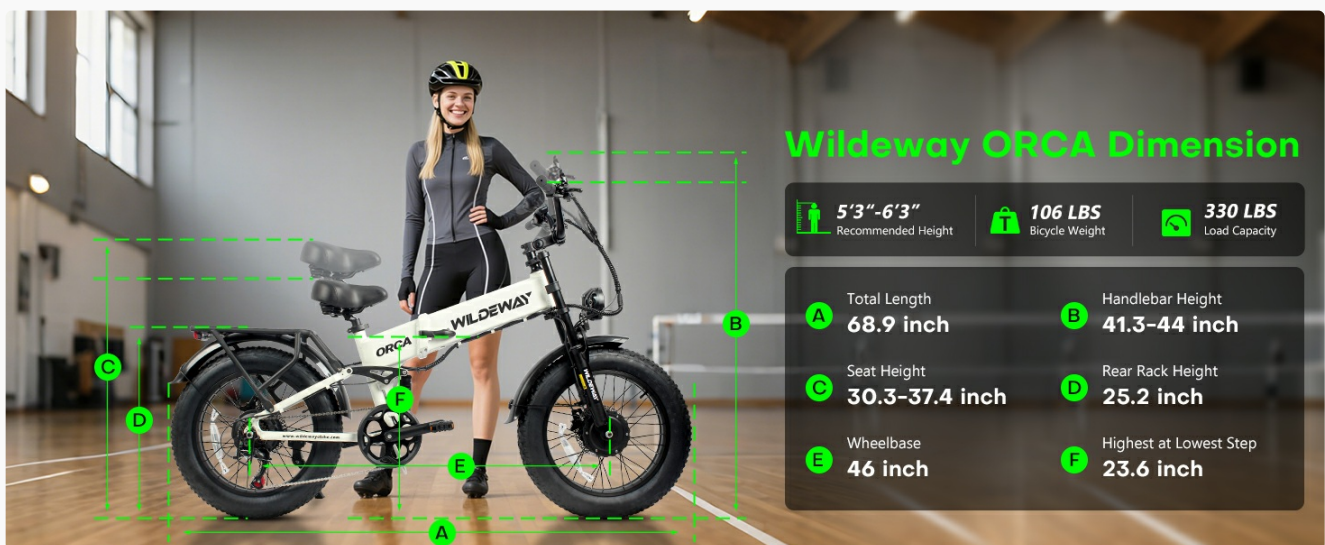
Image: The Wildeway ORCA electric bike shown in its compact, folded state, highlighting its portability for storage or transport.