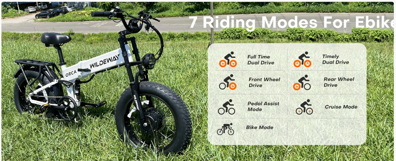
Image: Visual representation of the seven riding modes, including dual drive, single motor drive options, pedal assist, cruise, and traditional bike mode.