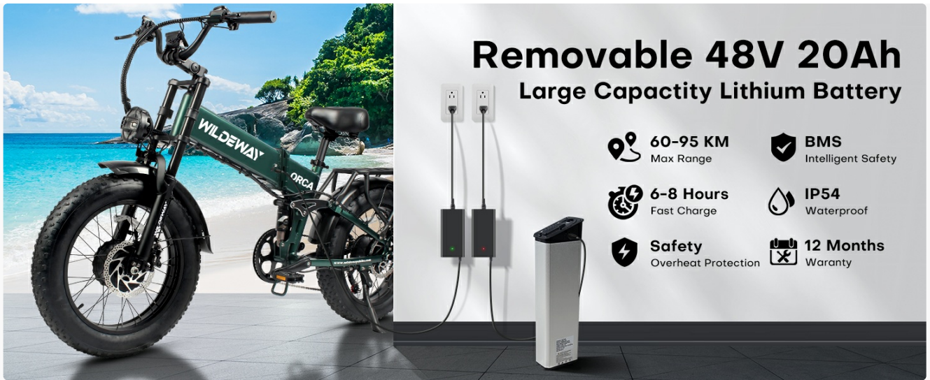
Image: The Wildeway ORCA electric bike, illustrating its powerful 2300W dual brushless motor system for enhanced performance.