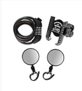
Image: A selection of included accessories such as a bike lock, phone mount, and rearview mirrors, designed to enhance the riding experience.