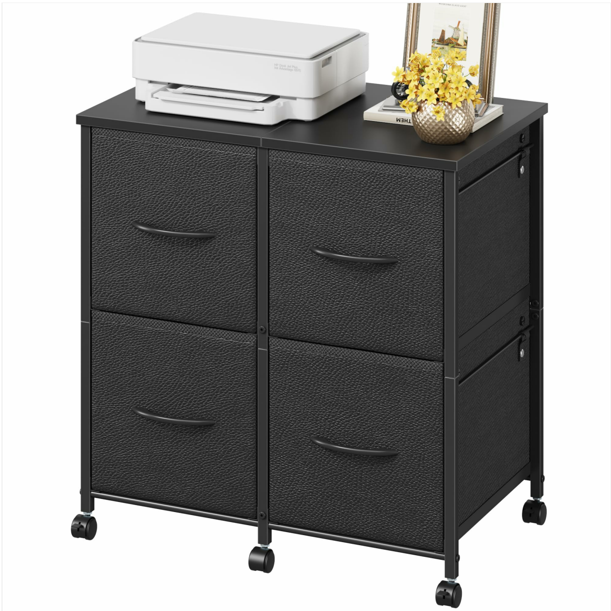
Image: The HIGDBFE 4-Drawer Lateral File Cabinet, black, with a printer on top, in a home office environment.