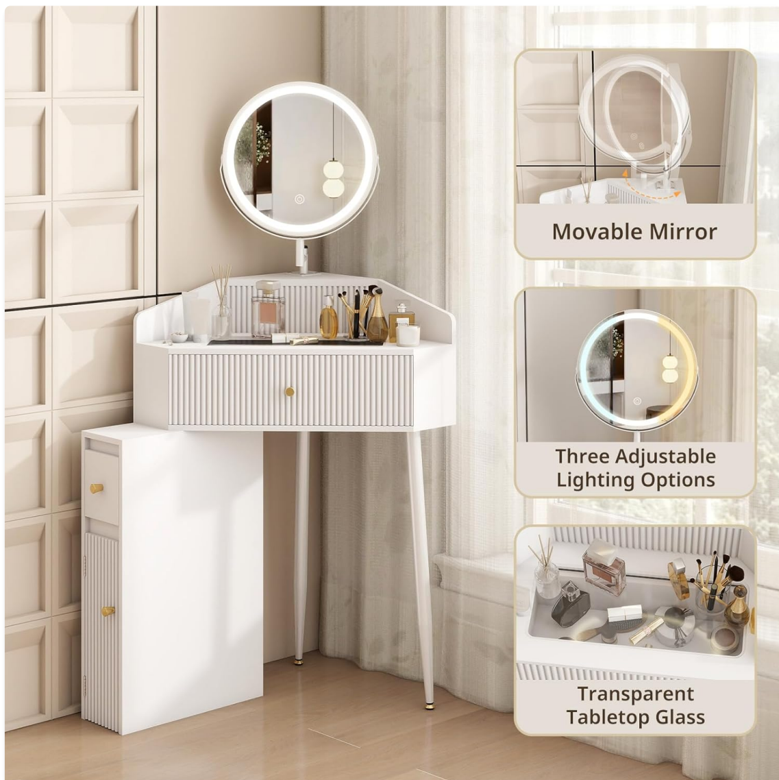
Figure 6.1: Illustration of the LED mirror's three lighting modes and the transparent glass tabletop. This image