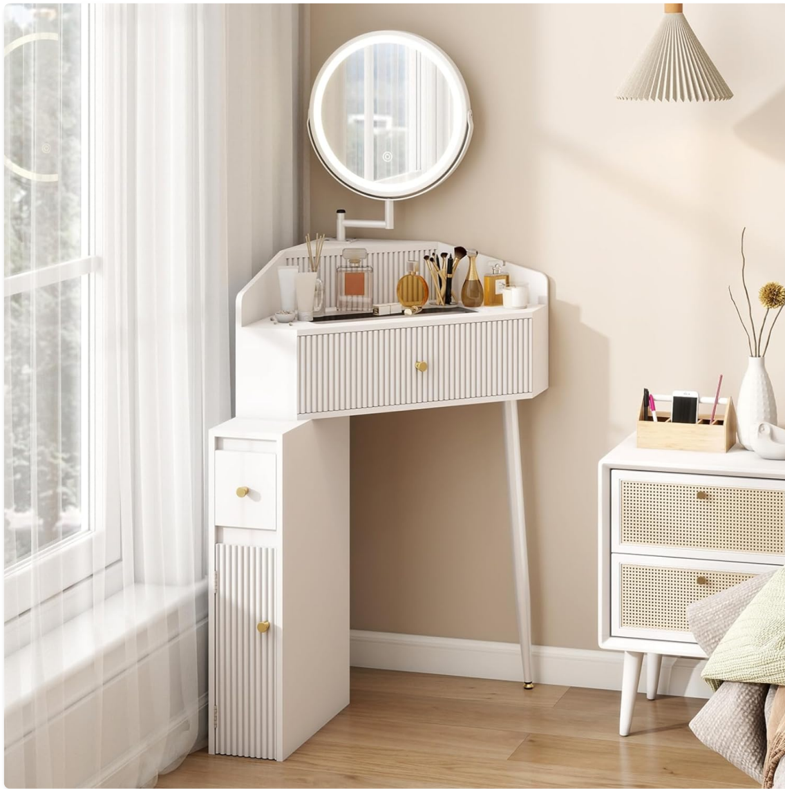
Figure 2.1: Overview of the ARTETHYS Corner Vanity Desk. This image displays the complete vanity desk with its corner design, LED mirror, and integrated storage.