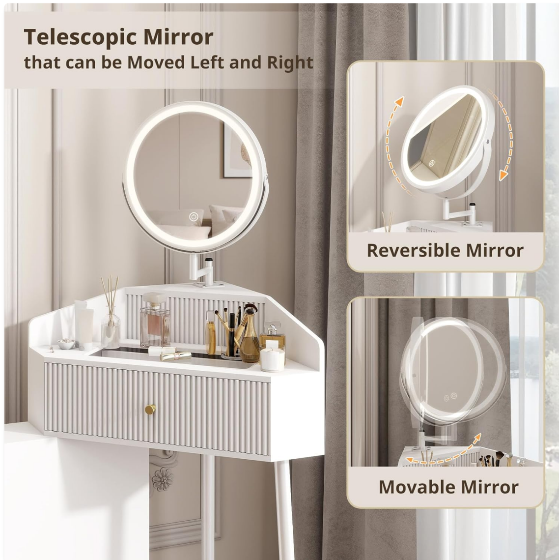
Figure 6.2: Detailed view of the telescopic, reversible, and movable mirror functions. This image demonstrates how the mirror can be adjusted for various angles and positions.

highlights the adjustable light settings and the clear view into the main drawer.