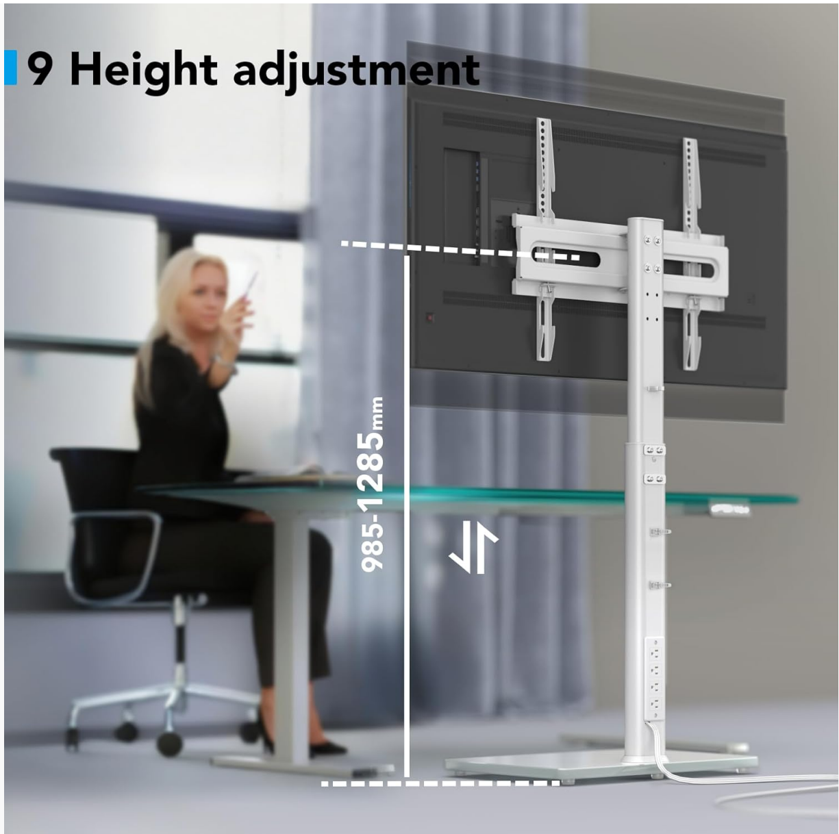
Figure 5: Height adjustment range of the TV stand.