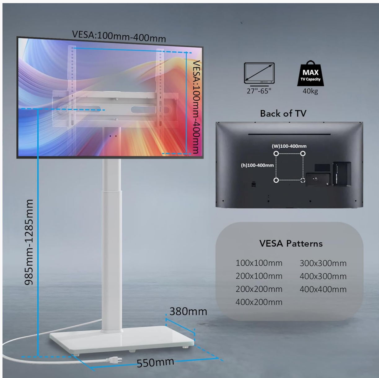
Figure 4: VESA compatibility and dimensions.