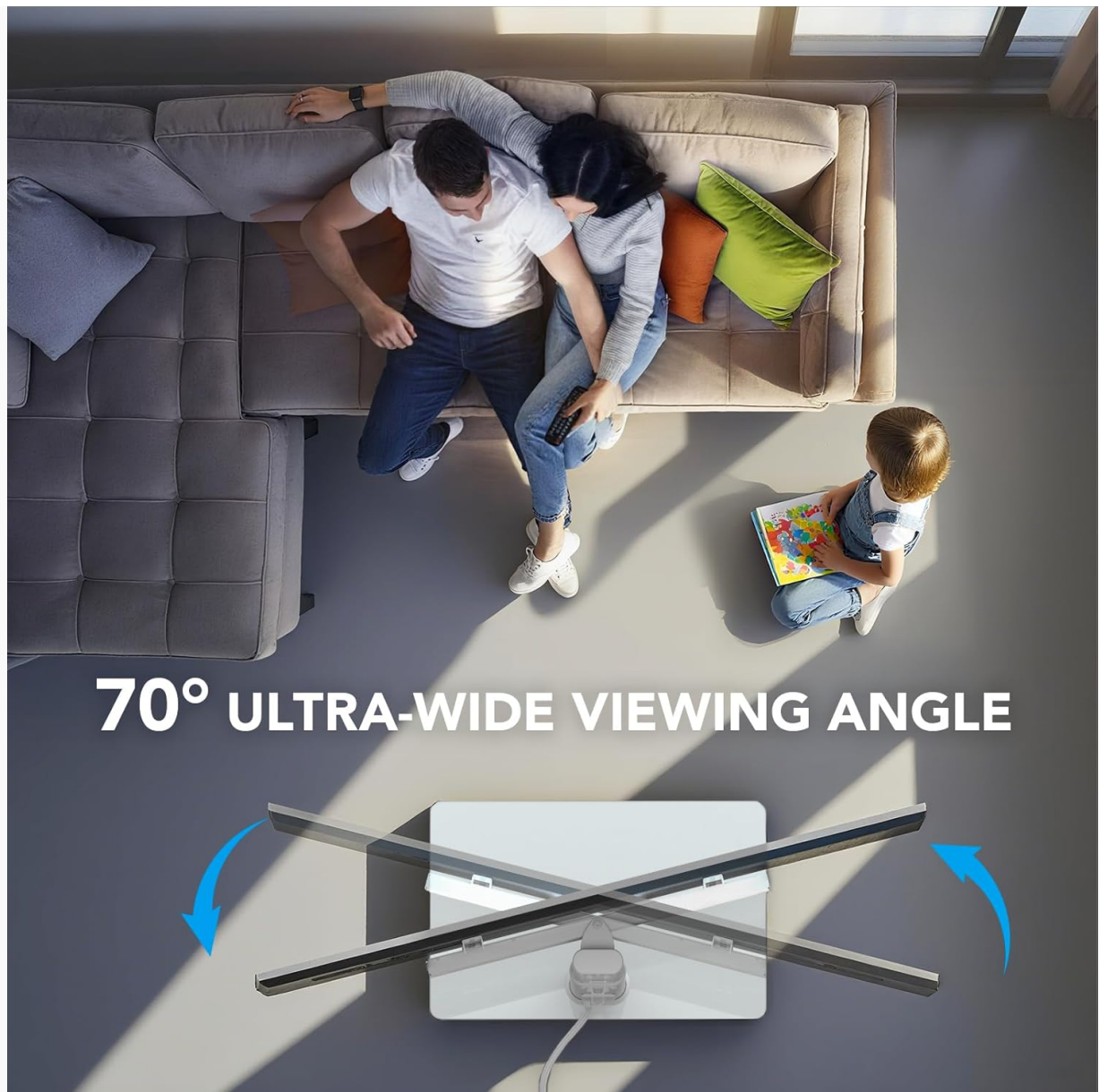
Figure 6: Swivel functionality for optimal viewing angles.