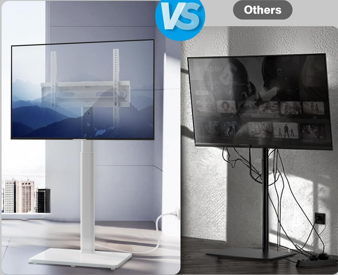
Figure 8: Cable management system.