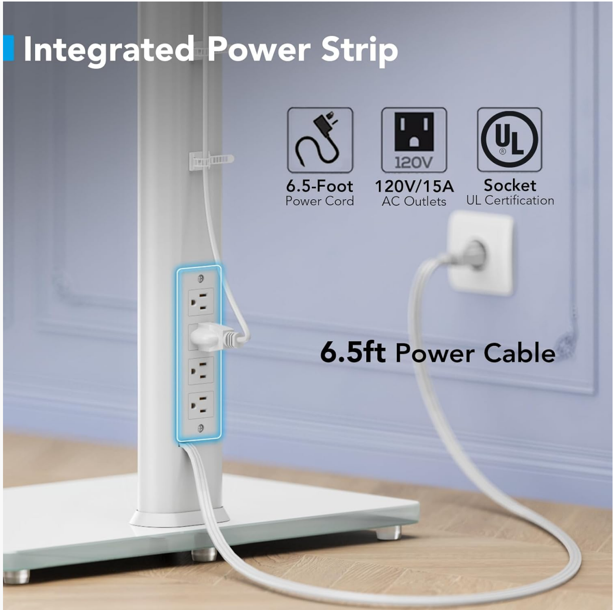
Figure 7: Integrated power strip details.