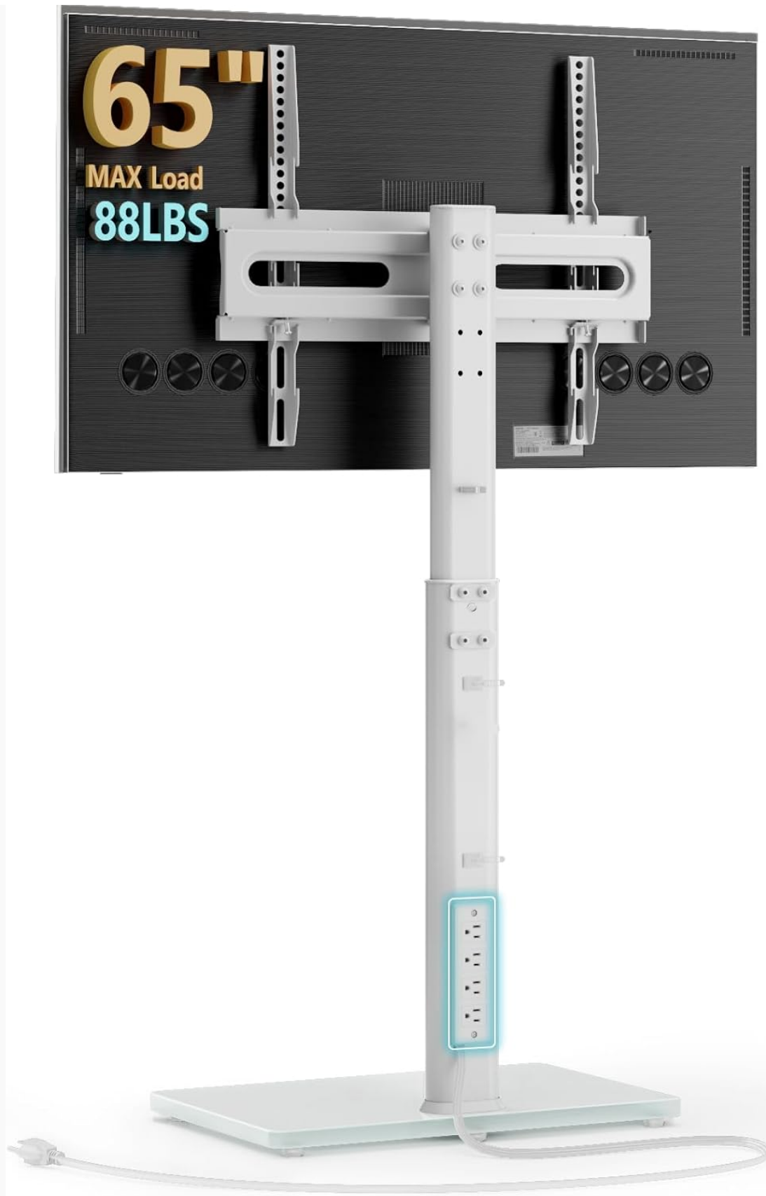
Figure 3: Overview of the AX WABER Floor TV Stand with Power Outlet.